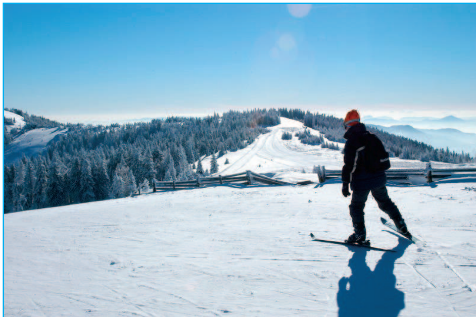
Kope and Robniško Pohorje.