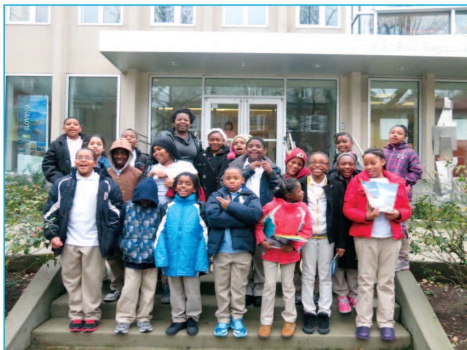
5th Grade students of the Turner Elementary School in front of the embassy.

Both the Slovenian Embassy and the school are participating in the Embassy Adoption Program, an academic program (offered in partnership with the D.C. Public Schools and the Washington Performing Arts Society), the mission of which