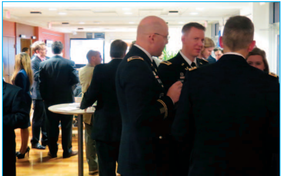
The event that featured Slovenian food, wine, art and music was attended by more than 80 guests.