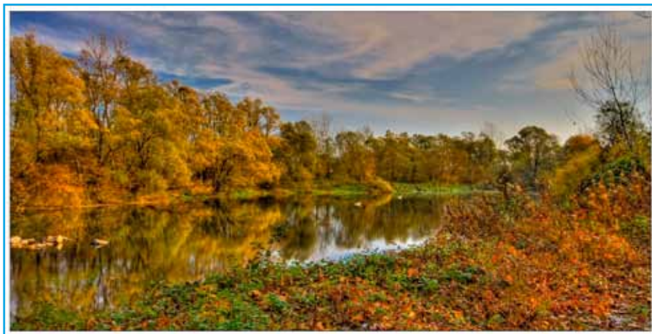
Šturmovci regional park.

The Municipality of Markovci spreads out in a lowland area of Ptujsko polje, mainly on the left bank of the river Drava. Although Markovci was first mentioned not earlier than 1215, remains of the Roman aqueduct, tools and sites of Roman military graves give evidence of ancient