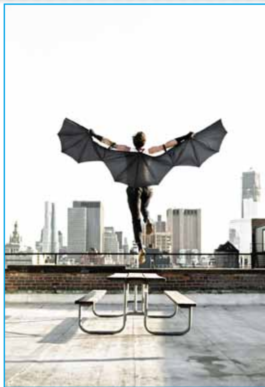
JAJA, Apnea's Rhapsody (action 2), 2012 in collaboration with Meta Grgurevič and Kalu

For RSVP (obligatory) and more information, send an e-mail to Blaz.Boznar@gov.si or call (202)386 6610