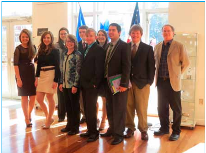
Students visited embassy's premises on Thursday, February 14.

On Thursday, February 14, the Embassy of Slovenia hosted a group of students and their mentor from Kent State University in Kent, OH, who are representing Slovenia at the 28th Annual Model NATO Conference, scheduled for February 14–17, 2013.