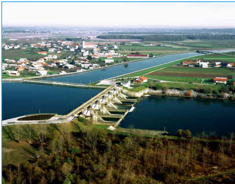
Markovci dam on Drava river.

On the right bank of the Drava river in the northeastern part of Slovenia near Ptuj is located the 300-acre wide Šturmovci Regional Park, which stretches among Haloze, Ptujsko jezero, and Ptujsko and Dravsko polje. The name Šturmovci or Šturmovec, as the locals call it, originates from a German name Sturmau (der Sturm – a storm, die Aue - a meadow) and so alludes to lively changes of the river stream through time.