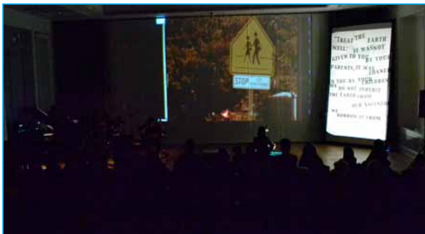
Czech Center New York at the Bohemian National Hall in New York.

The main theme of the event, composed from assorted art forms, dealt with natural disasters, which are becoming more and more frequent and can be interpreted as Earth's resistance to current