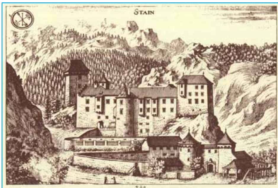
The road that passes through the village leads, past the Draga Valley, to the ruins of the 12th-century castle Kamen

The layout of the castle's Baroque garden remains,