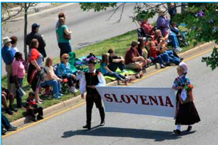
Traditional Slovenian costume from Gorenjska region.

newer members of the Alliance, and SAF members gladly provided additional information thereon. Moreover, the Slovenian presentation and performance of dance and music was honored with the second prize, the “Chairman’s Cup.” Particularly interesting for the SAF members was meeting American Slovenes at the picnic which concluded the successful day.