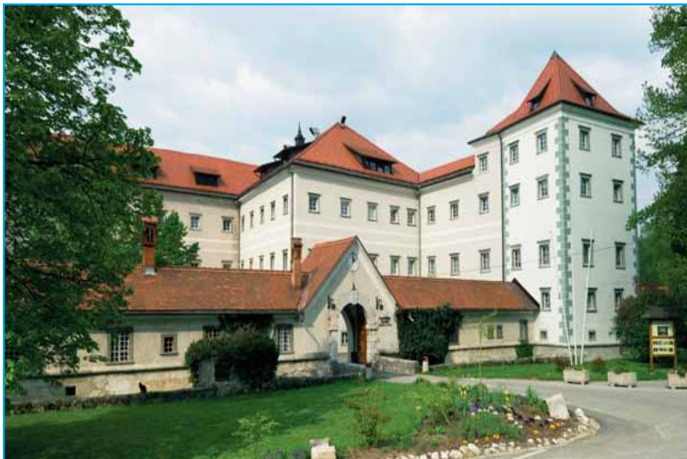
The Katzenstein Mansion is first mentioned in historical documents in 1428.

Begunje na Gorenjskem is a small village in the northernmost part of the municipality of Radovljica in the Upper Carniola (Gorenjska) region of Slovenia. First mentioned in written sources in 1050 as Begûn, the village of Begunje stretches along the Begunjščica creek. Its center is marked by the Church of St. Ulrich on one side of the road and the Katzenstein Mansion with an adjacent park on the other.