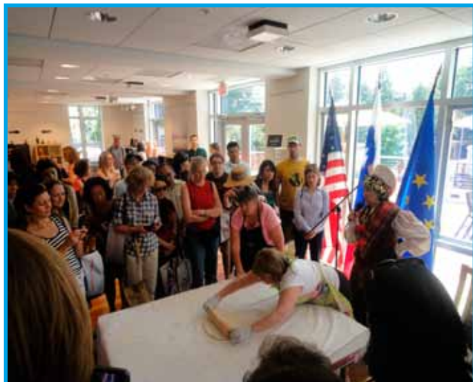
All photos are from last year's EU Open House event when more than 2000 people visited Slovenian embassy.