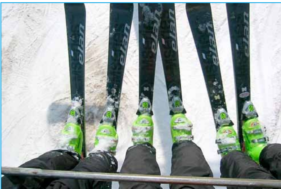
Elan SCX changed the world ski industry.