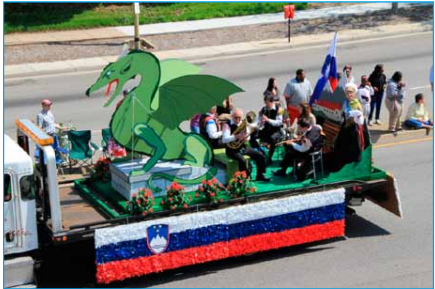
Slovenian performance at the Parade of Nations.

On Saturday, the 60th Annual Parade of Nations took place in downtown Norfolk. For the parade, the members of the Slovenian Armed Forces built a platform featuring characteristic symbols of Slovenia: a stylized Ljubljana dragon – the symbol of the capital; Mount Triglav – the “Three-headed Mountain”, the symbol of Slovenia; and the motive of Lake Bled. A musical ensemble from Cleveland enriched the parade by performing Slovenian music.