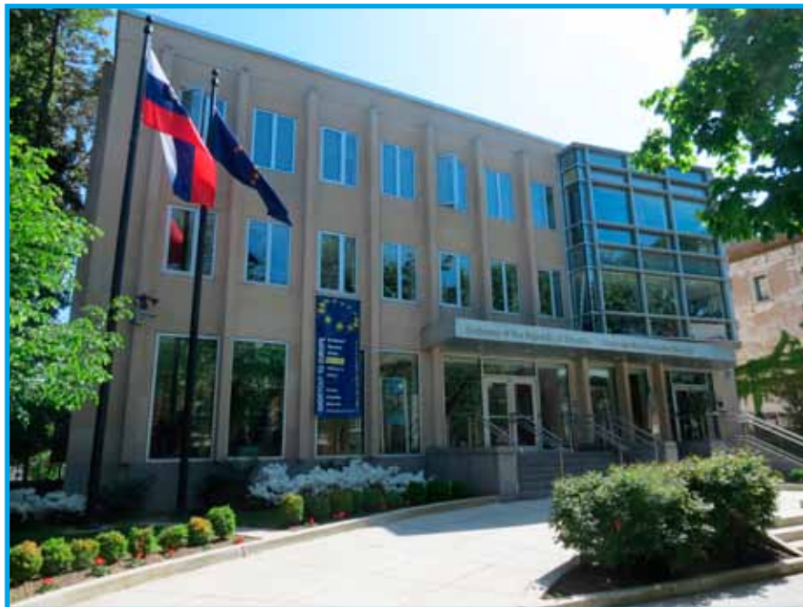
Slovenian embassy is located at 2410 California Street, NW (near Massachusetts Ave; 24th Street and S Street).

If you want to learn about the best Slovenian tourist attractions, taste Slovenian cuisine and wine, admire an exhibition of Slovenian landscape