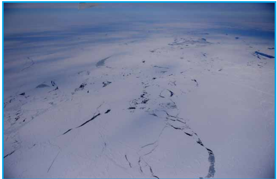
North Pole from Virus-SW.

In 2004, the Slovenian adventurer was the first person to circle the globe in an ultralight aircraft without a copilot or additional air support. Flying the Pipistrel Sinus 912 UL aircraft, which weighs a mere 284 kilograms (625 lbs.), Lenarčič also set a world