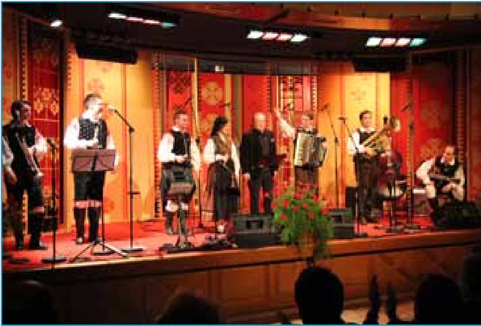
Begunje is also well known as the hometown of Slavko Avsenik, the pioneer of Slovene popular folk music. Concerts featuring national folk-music ensembles are organized every week at the Avsenik restaurant named Pri Jožovcu.

in 1418, the castle passed to Count Hermann II of Celje, and was inherited by the Austrian House of Habsburg in 1456.