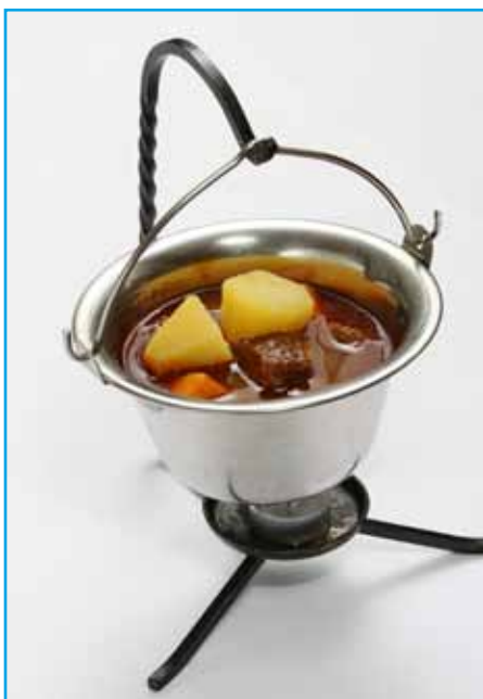
Bograč stew.

Source and more information: www.slovenia.info , http://www.lendava-vabi.si