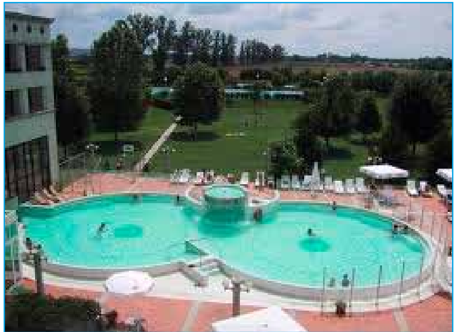
Lendava Thermal Spa.

A permanent local history exhibition, titled "Museum of Citizenry, Typography and Umbrella Manufactory", was