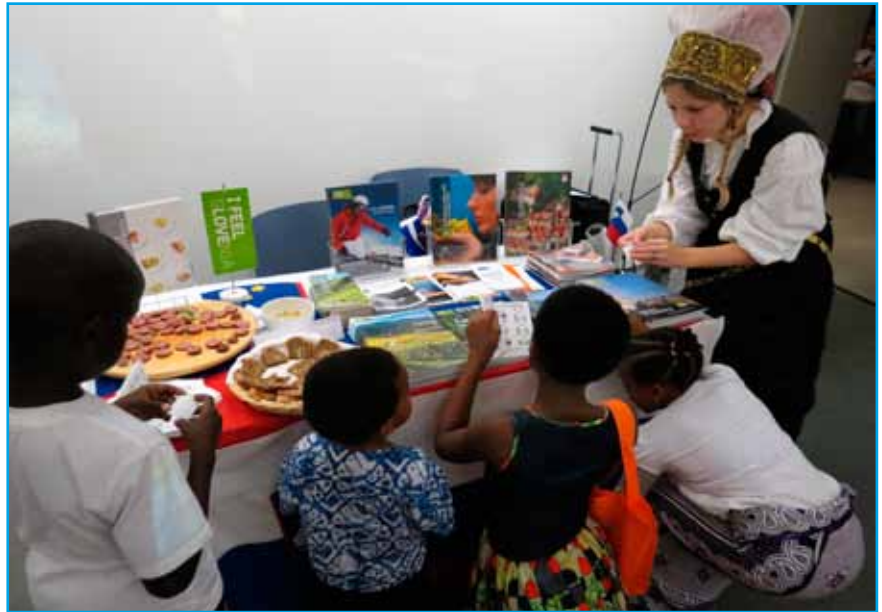
The focus of the G-Fest was on showcasing ethnic and cultural diversity by celebrating unique worldly traditions.

Next to the Embassy of the Republic of Slovenia, more than twenty embassies and other organizations presented their respective cultures in the international festival, namely, the Embassies of Saudi Arabia, Uruguay, Brazil, Bangladesh, Kenya, the Kingdom of Bahrain, Zambia, Uzbekistan, Haiti, Sri Lanka, the Republic of Bulgaria, and Serbia, and the Association of the Tanzanian Community, the Alliance Française, Italians in D.C., the Polish Library in D.C., the National Museum of Language, the Vietnamese