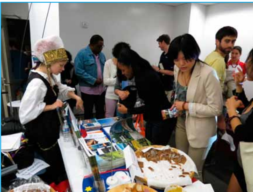
More than five hundred guests stopped by the Slovenian booth to learn about the country.

More than five hundred guests stopped by the interactive Slovenian booth to learn about the customs in Slovenia and its geographic and history highlights, and to taste Slovenian food and learn about the country's tourist attractions.