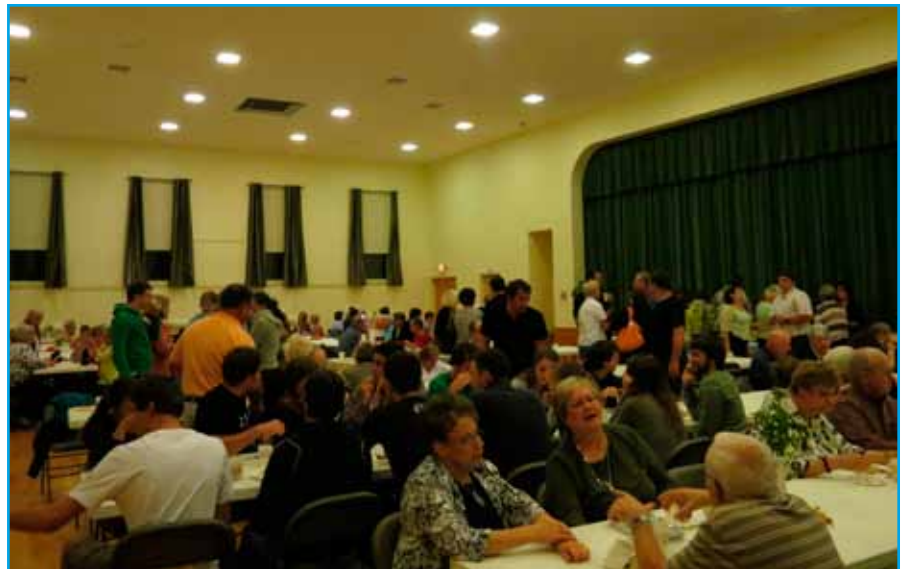
Reception following Bethlehem concert was an opportunity for Slovenian community in PA to meet with members of the choir.

On Thursday, October 3, the choir inaugurated Salisbury (MD.) University's fall World Artists Experiences series in Holloway Hall Auditorium in front of more than 300 people. The concert presented choral arrangements of Slovenian folk songs as well as contemporary compositions, music by Slovenian Renaissance composer Jacobus Gallus and