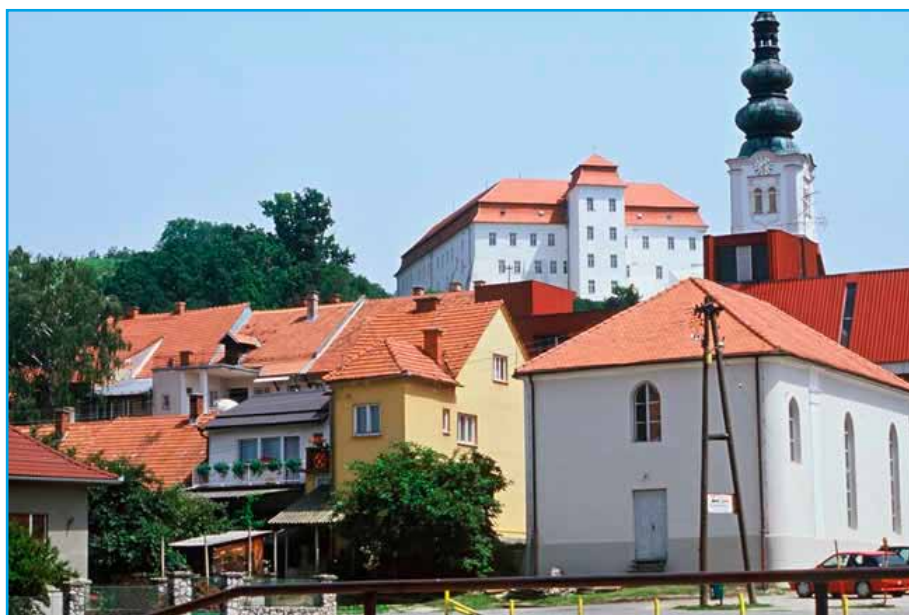
Lendava with the castle in the back.

Lendava lies in the Prekmurje region and is the easternmost town in Slovenia. Situated at an intersection of several major arteries, the settlement was called Halicanum by the Romans and was their outpost on the Poetovio–Savaria route (today Ptuj–Szombathely). The town of Lindva, named after the local river, was first mentioned in records dating