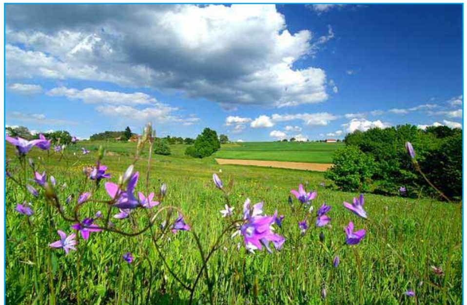
The Goričko region has been covered by forest for more or less its entire history and hence has never been densely settled.

More information available at: www.park-goricko.org , www.goricko.net