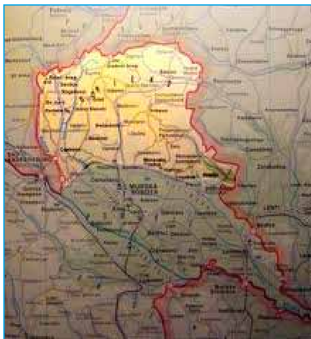
Goričko lies in the northeast part of Slovenia.

As far back as the Middle Ages, the Goričko inhabitants were already famous for their fruit-growing and orchards with trees bearing several hundred kinds of fruits, which still grow today. In some places, the old rustic architecture is still preserved as well as some crafts, which elsewhere have already disappeared. One can find numerous old mills, old thatched-roofed farms, centuries-old Protestant