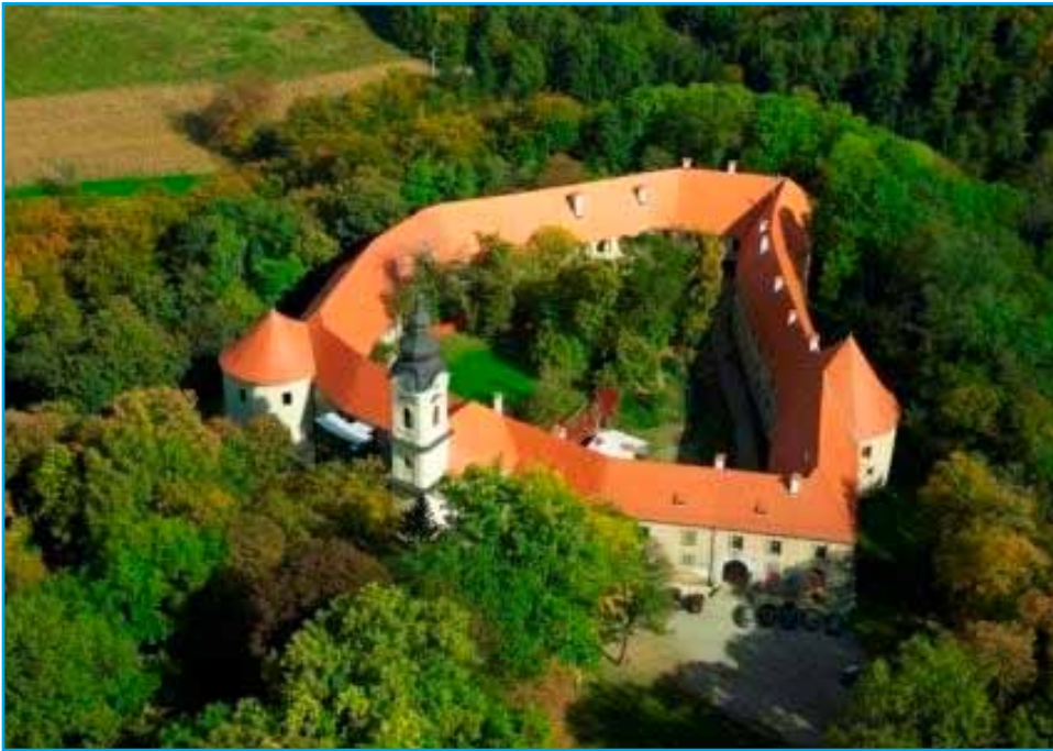
The Grad castle in the village of Grad has 365 rooms – as many as there are days in a year – and is the largest castle in Slovenia.

and Catholic churches. Most of Prekmurje's Protestants (Evangelicals and some Calvinists) today live in Goričko, and one of the first organized Protestant communities during the Reformation was at Sv. Benedikt (Kančevci), where a monastery operated during the Middle Ages.