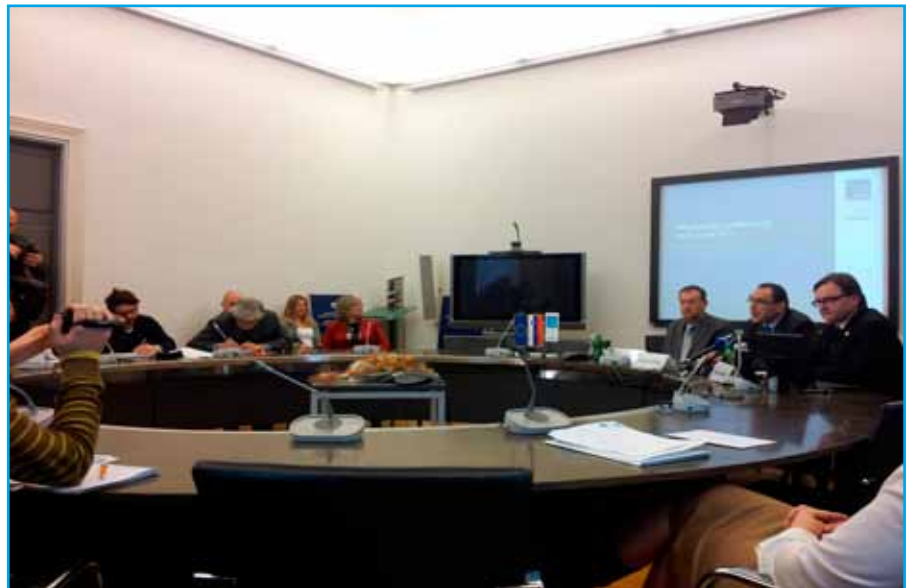
The Ministry of Foreign Affairs of the Republic of Slovenia has pledged to support the international 'Lend Your Leg – Roll Up Your Pants Leg' campaign.

ITF Enhancing Human Security is a non-profit organization, established by the Government of Slovenia in March 1998, in close partnership with U.S. The initial aim of ITF was to provide humanitarian aid to Bosnia and Herzegovina, reflecting the active engagement of Slovenia in the aftermath of the Balkans conflict in the '90s. Since its inception, the ITF has focused its fundraising activities and support on humanitarian mine action in S.E. Europe. As the European Commission acknowledged the ITF as the reference model of regional organization in de-mining action, the ITF was asked by mine-affected countries and donors to expand their operation to