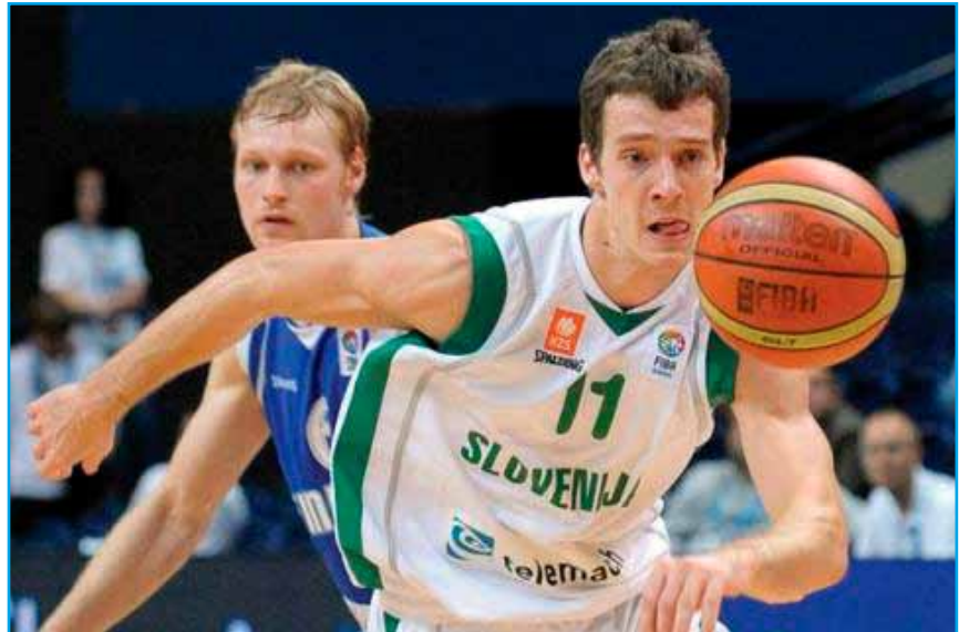
Goran Dragić, a guard for the Phoenix Suns, scored 18 points to lead Slovenia to a 78-69 upset victory over defending champion Spain on Thursday night.