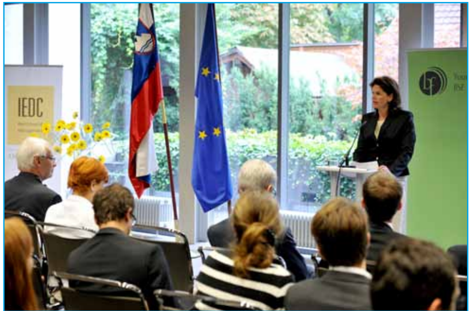
Prime Minister Alenka Bratušek addressed yet on Sunday, September 1, the participants of Young Bled Strategic Forum.

The proceedings for BSF 2013 got under way on Sunday, September 1, with the Young Bled Strategic Forum, which brought decision-makers of the future to Bled to discuss issues facing young people. The opening of Young BSF was addressed by BSF Secretary General Brian Alain Bergant, who welcomed the young professionals and future leaders on behalf of Foreign Minister Karl Erjavec and the co-organizers of the Young BSF Solutions Generator Conference, the Centre for European Perspective. Coming