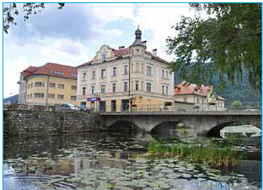
The town lies within the meanders of the Karst river Rinža.

In 1247, the Patriarch of Aquileia granted the area around the town of Ribnica to the Carinthian counts of Ortenburg. When the counts, in 1336, received from Patriarch Bertram further estates on the wooded plateau