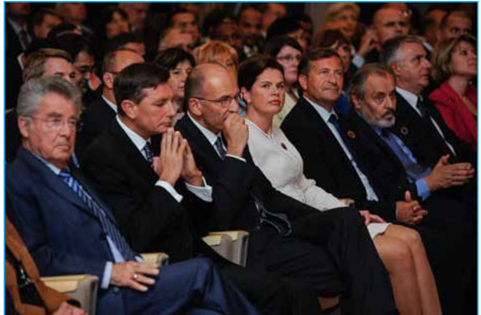
From left: Austrian President Heinz Fischer, Slovenian President Borut Pahor, Prime Minister Alenka Bratušek, Foreign Minister Karl Erjavec and Constitutional Court's Chief Justice Ernest Petrič at the conference.

The conference saw in attendance Prime Minister of the Republic of Slovenia Alenka Bratušek, President of the Republic of Slovenia, Borut Pahor, Austrian President Heinz Fischer, Italian Prime Minister Enrico Letta, the Chief Prosecutor of the International Criminal Court, Fatou Bensouda, the Deputy Secretary General of the OSCE, Yves Leterme as well as 17 ministers and multiple high