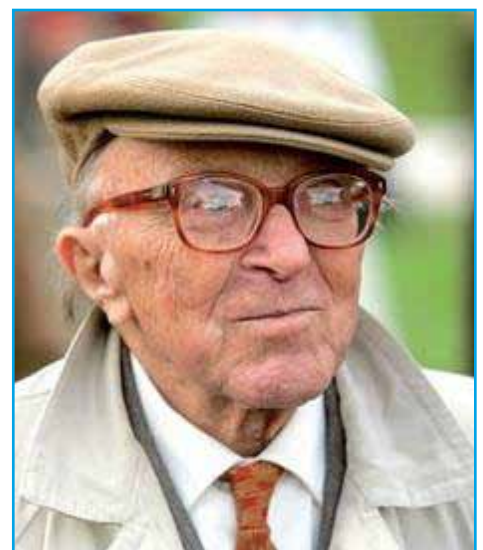
Boris Pahor's is a living witness to the horrors of 20th century totalitarianisms.