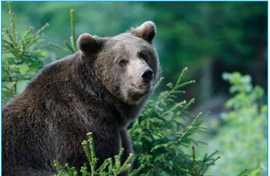
Kočevje is also known for its unexplored forests that are home to a growing population of brown bears.

One of the many nearby attractions is the Lake of Kočevje, which was created after the coal production was stopped in 1978. The lake is home to numerous kinds of animals: over 64 species of birds come to nest there. The