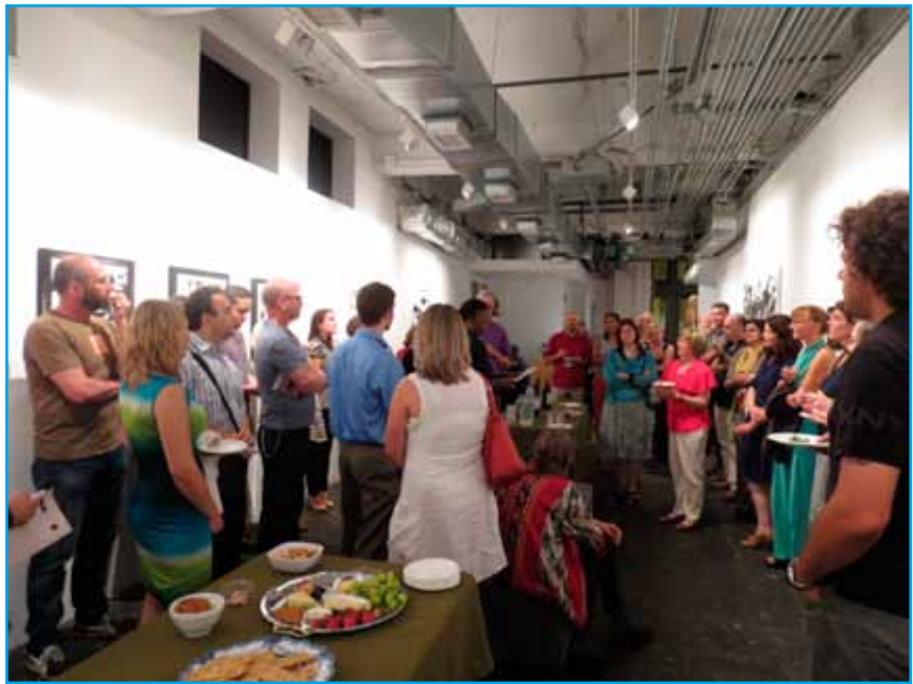
Tuesday's performance was followed by a reception at the Flashpoint Gallery.