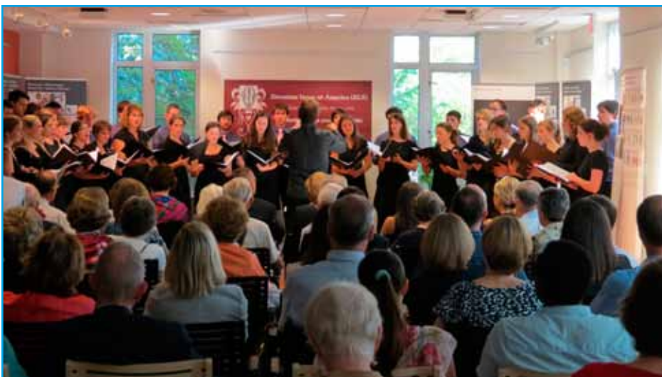
Concert by Megaron Chamber Choir which on occasion performed numerous Slovenian songs, including Slovenec sem and Triglav moj dom.