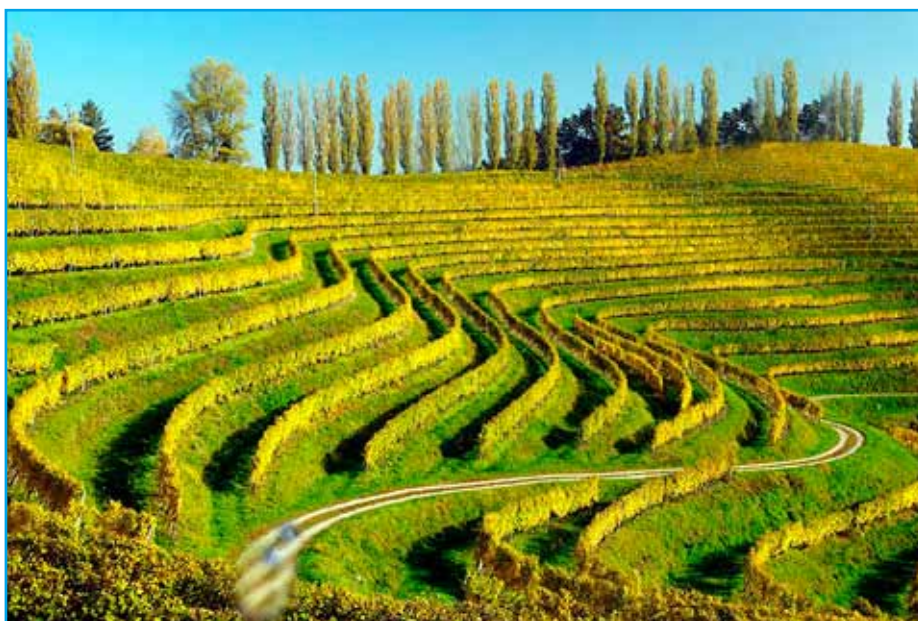
Bizeljsko vineyards.

German name, Wiesel, was first mentioned in the 12th century and later converted into Wissel: the Slovenian Bizelj, hence Bizeljsko. In 1475, one of the largest clashes between the joint Styrian and Carniolan army and Turkish troops took place in the Bizeljsko area. In the 16th century, Bizeljsko was the locale of the two most notable peasant revolts. After 1848, the region began to connect administratively and politically with Brežice, and after WWII the area became existentially dependent on the nearby urban and employment centers.