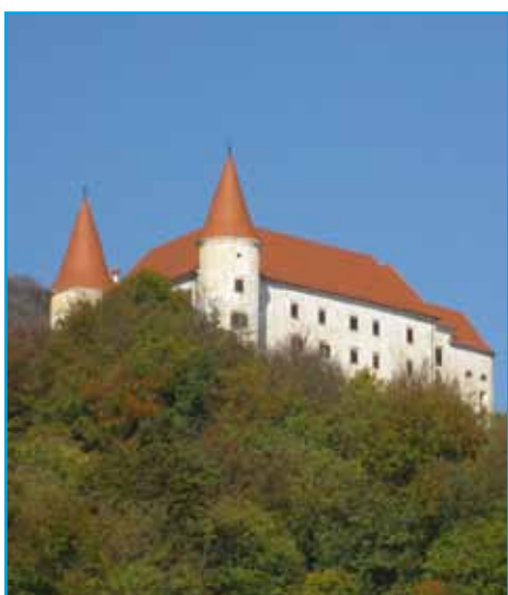
Renaissance Bizeljsko castle.

In the 7th and 8th centuries, the area was permanently settled by the Slavs, who soon began to pass under the political authority of the medieval German state. Its