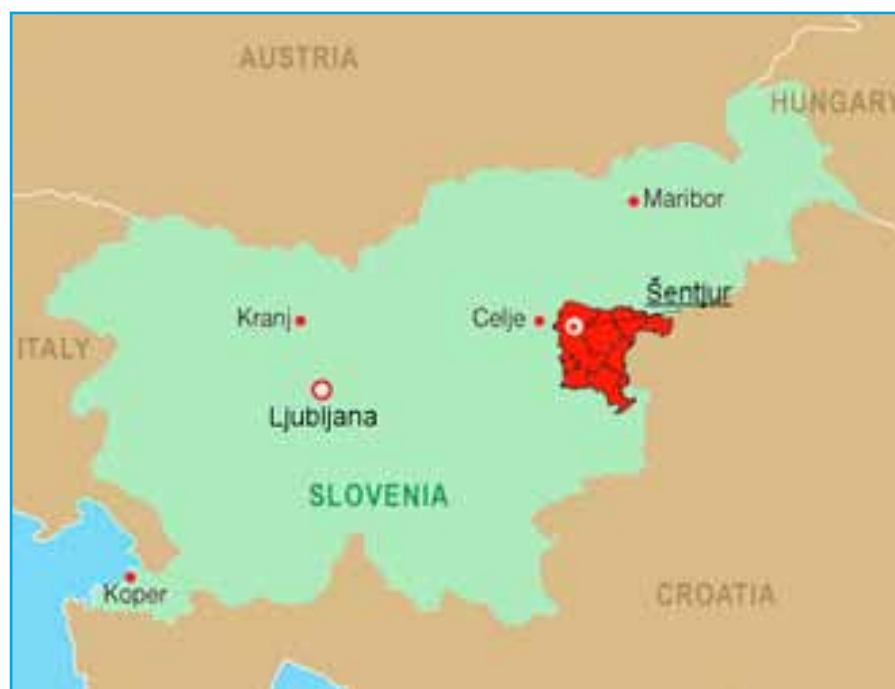
Obsotelje and Kozjansko region on the map of Slovenia.

The presence of Germanic people is evident from some minor findings. Svete gore above Bistrica ob Sotli, with a Slavic necropolis, can be dated back to the Slavic period. All findings from the above