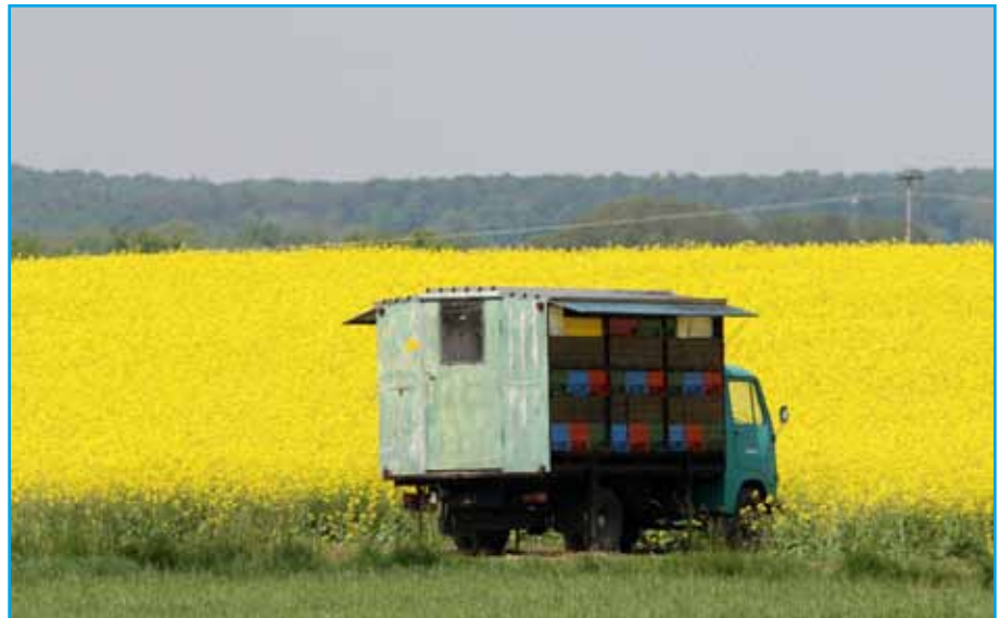
Beekeeper`s vehicle in the field

Nowadays, Slovenia is the only European Union member state to have protected its native bee, the Carniolan bee. This indigenous Slovenian species is regarded as the second most widespread bee breed in the world and it is famed for its docility, hard work, calm character, utilization of forest forage; and excellent sense of orientation. Its advantage lies in its rapid spring development, good cleaning instinct, disease resistance and frugality because it over-