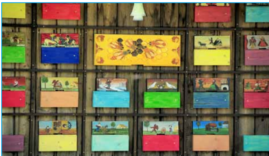
The painted wooden front panels of beehives became a rural art form in Slovenia – hives, painted in various colors and bearing interesting scenes are today recognized as an open-air art.

Another special feature of Slovenian beekeeping that has gained international recognition is in the area of folk art – this being the art of painting wooden beehive front panels with fascinating images, something not known anywhere else in the world. The beginnings of this folk art can be traced back to the middle of the 18th century. Slovenia’s museums have preserved a good number of original paintings from which countless replicas have been made – new beehive panels done in the antique style are among the more original Slovenian tourist souvenirs. More information is available at Beekeepers’ Association of Slovenia at http://www.czs.si/turizem_en/ .