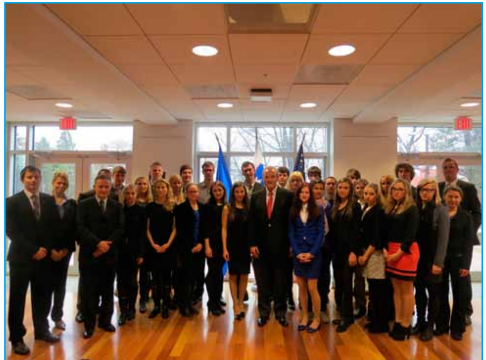
University of Ljubljana law students on the embassy's premises.

Each year in March, a group of law students from the University of Ljubljana, Slovenia, makes an excursion to the United States. Within their trip, they visit various important institutions in New York City and Washington. On Tuesday, March 12, 2013, a group of 30 students, accompanied by Professor of