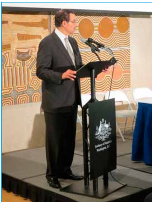
Vincent C. Gray, Mayor of the District of Columbia addressing the diplomatic court.