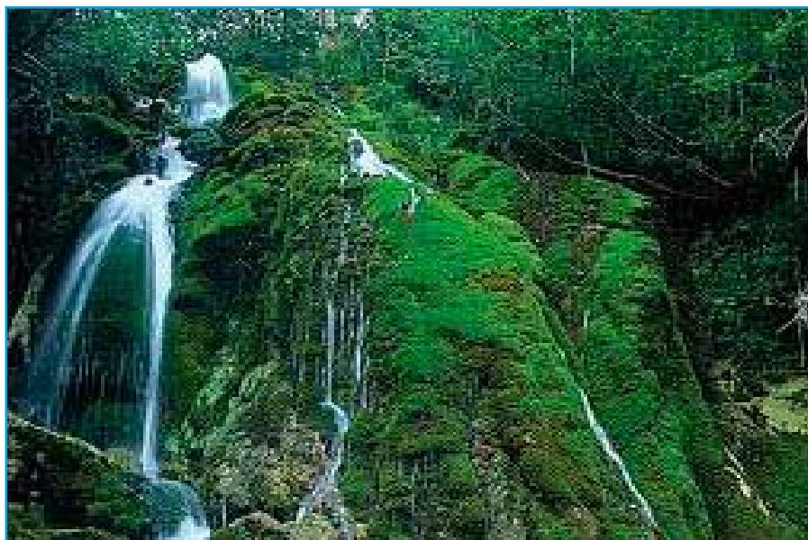
Beautiful nature surrounds Kostel.

Kostel and its surroundings are also famous for various cultural, social, and sports and recreation events. The most important of them is the cultural-ethnological event called "Tamburanje va Kostelet," taking place on August 15. After the mass, celebrating the holy day of the Assumption of Virgin Mary, a special arts and crafts fair takes place, as well as a procession of national costumes, and workshops for children. A special type of music is also present in the Kostel region – it includes tambura, violin, accordion, and singing. Popular groups, which successfully perform this type of music are Prifarski muzikanti and Tamburaška skupina Dupljak.