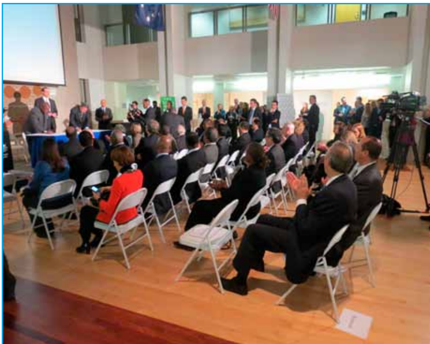
The event was held at the Embassy of Australia.