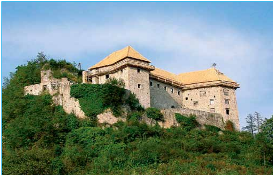
The Kostel castle.

Kostel is a small settlement, located on the left bank of the beautiful, clean and biodiverse Kolpa River next to the Slovenian border with the Republic of Croatia. Kostel is part of the region of Lower Carniola and now the center of the Municipality of Kostel, which has just 700 inhabitants, although it had more than 3,000 less than 100 years ago. Living in a border settlement, people of Kostel speak a special Slovenian dialect, in which they don't use the grammatical dual, otherwise characteristic of the Slovenian language.