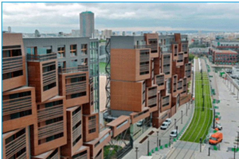
Basket apartments in Paris by OFIS.