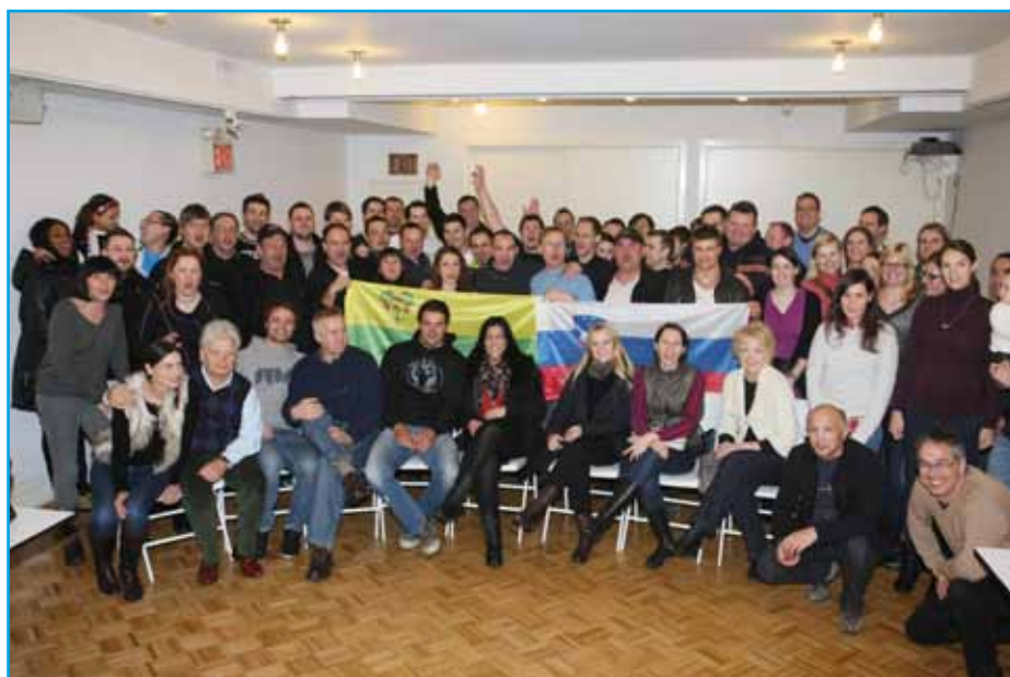
The evening gathering before the match at St. Cyril's.