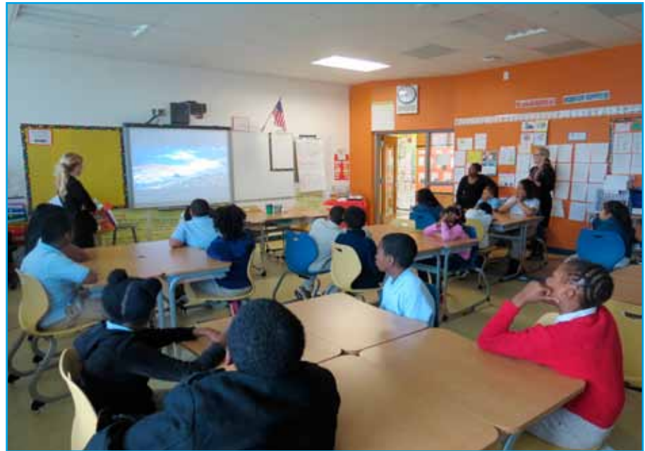
In the classroom presenting Slovenia with a short film.

Together with the embassy representatives, the classroom delved into a globally themed lesson unit, as the