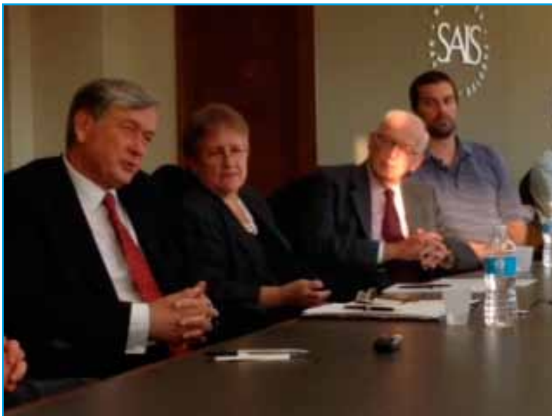
Dr. Türk discussed the U.N. crisis management and possible political solutions for existing conflicts.

While in Washington, the third Slovenian president also attended meetings at the U.S. Department of State and the National Security Council. In New York, he is meeting with several U.N. officials and delivering a lecture at Columbia University. He is also visiting Boston, where he will have meetings at Harvard Law School, Harvard Kennedy School of Government, and Suffolk University. Dr. Danilo Türk will also join former U.S. President Bill Clinton at the annual Clinton Global Initiative conference.