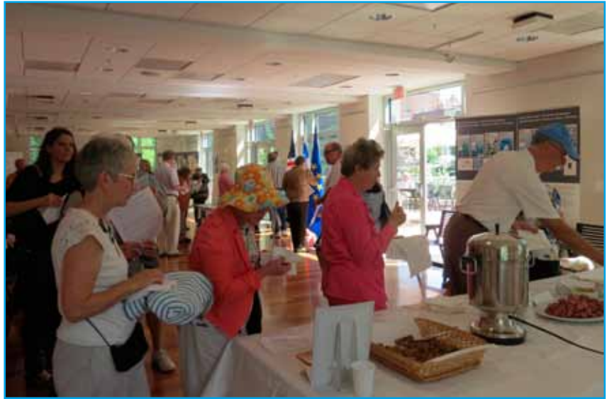
Around four hundred people visited the Embassy of Slovenia.

The building of the Embassy of Slovenia was formerly the Embassy of the Socialist Federal Republic of Yugoslavia in Washington. It was allocated to