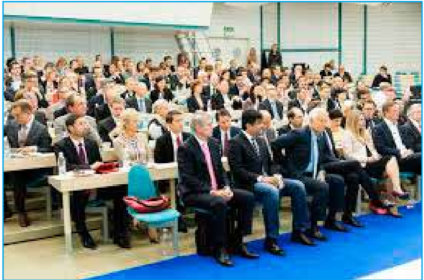
Over two hundred participants attended the annual FDI summit in Ljubljana, Slovenia.

More information are available at: http://www.fdi.si/ (Source: STA)