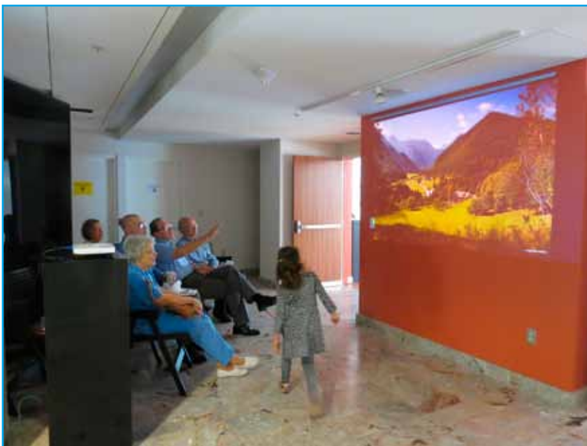
Ambassador Dr. Božo Cerar giving a presentation on Slovenia.

At the Embassy of Slovenia, visitors could taste some of the traditional Slovenian food, such as Carniolian pork sausage and the typical Slovenian festive dessert "potica", a walnut roll cake. They could view the display titled Identity of Slovenia--Design for the State, listen to Slovenian music and enjoy watching videos and images of Slovenia.