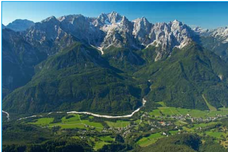
Gozd Martuljek (Photo courtesy: LTO Kranjska Gora, photographer: Matjaž Vidmar).

Following World War I, there were 19 flour mills and 4 sawmills in Rute; the residents were also involved in farming and lumbering. Numerous coal pits