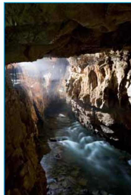
Pivka Cave and Black Cave.

Pivka's abundance of water can also be noticed in 17 intermittent lakes, which fill up in the hollows of the eastern basin ridge after heavy rainfalls. The best known are Lake Petelinje and Lake Pačje, which retain water for most of the year and are completely dry only during the driest seasons.