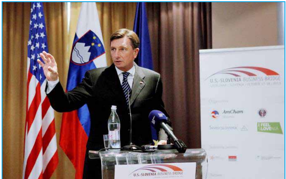
Opening address by President of the Republic of Slovenia Mr. Borut Pahor.

Organized by the American Chamber of Commerce in Slovenia – AmCham Slovenia, in cooperation with the U.S. Embassy in Ljubljana, and the SPIRIT - Public Agency for the