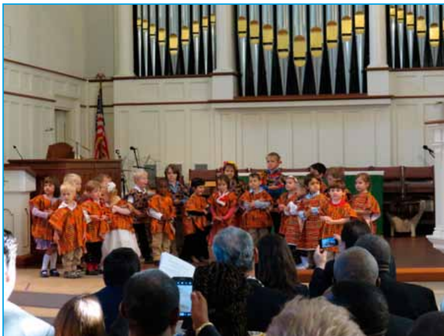
The event is one of the highlights of the Oneness-Family school year.

During the program on October 25, the students