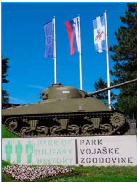
Park of Military History in Pivka

The territory has been inhabited since prehistoric times and Slavic tribes settled in the area approximately 1000 years ago. Throughout the centuries, many empires, kingdoms and countries have tried to subordinate and fortify the broader area of the Postojna Gate (also known as the Gate of Italy) as this has always represented