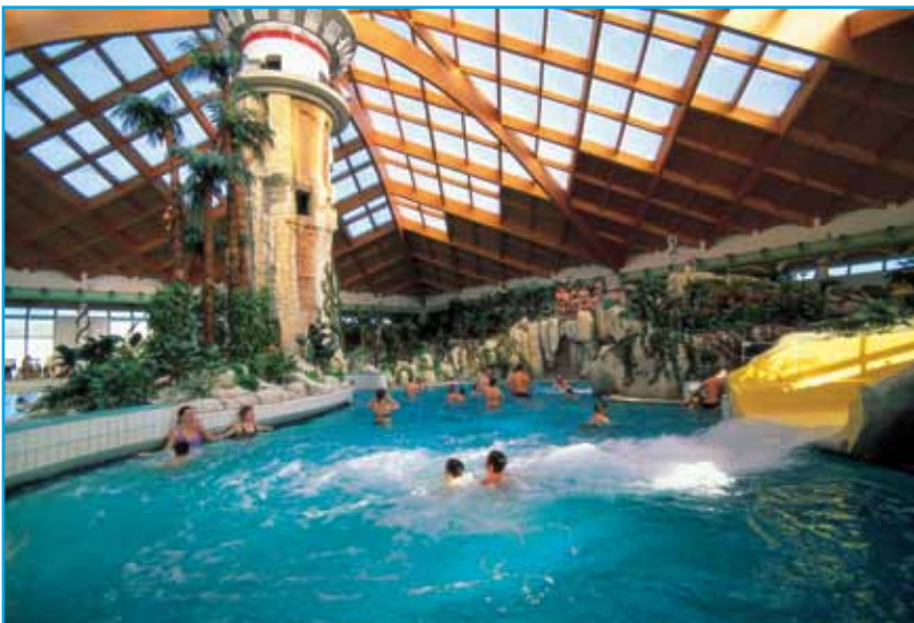
Čatež thermal riviera.

For more information about Brežice visit: www.visitbrezice.si