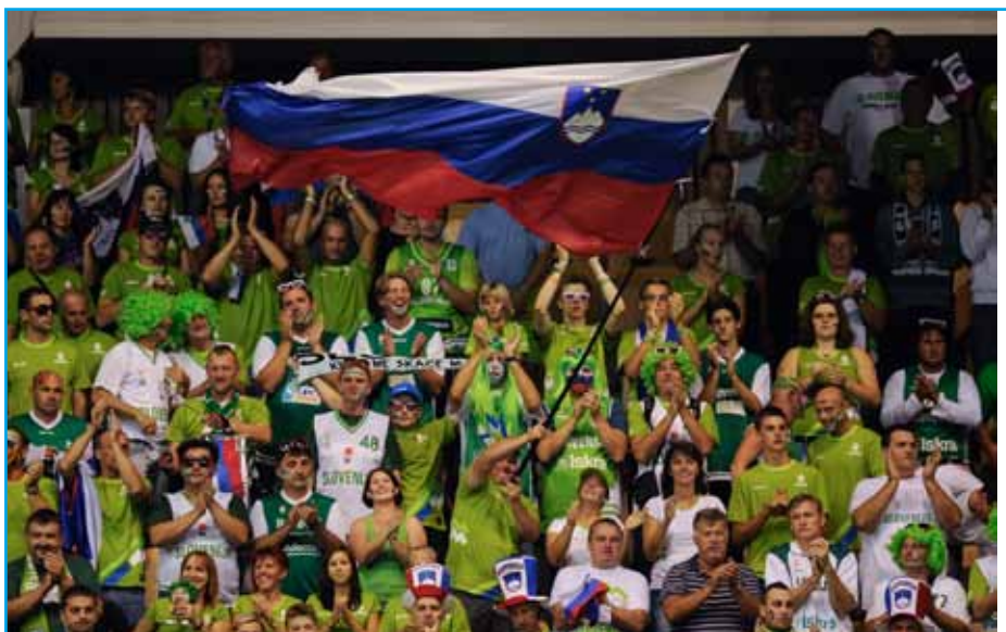
Fans.

Slovenian guard Goran Dragič, who plays for Phoenix Suns in the NBA, was named