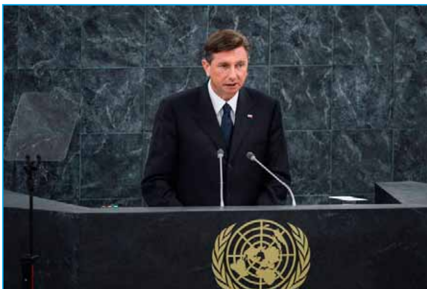
President of the Republic of Slovenia addressing U.N. Genreal Assembly.

President Pahor, who headed the Slovenian delegation, addressed the U.N.