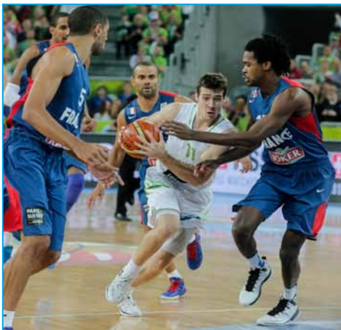
Slovenian guard Goran Dragič in action.

A total of 90 matches, played at the tournament, were watched by a total of 330,000 spectators, which amounts to 3,700 spectators per match. Altogether, 182,000 tickets were sold and a total of 55,000 foreign guests visited Slovenia during the tournament. The event was also a major success in business terms and a major promotion of basketball among young people.