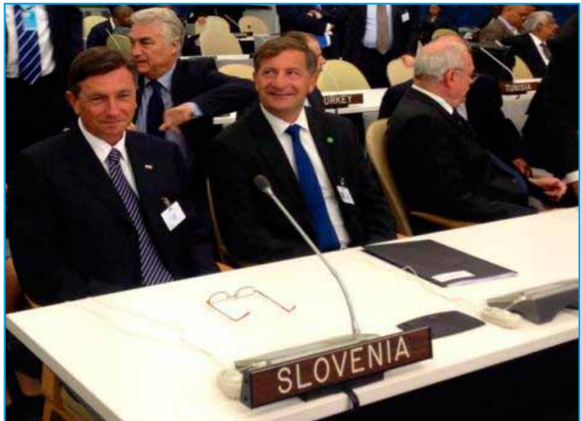
President Pahor and Foreign Minister Erjavec participated in several discussions while in New York.

On the sidelines of the session, Pahor had other engagements, including attending a reception hosted