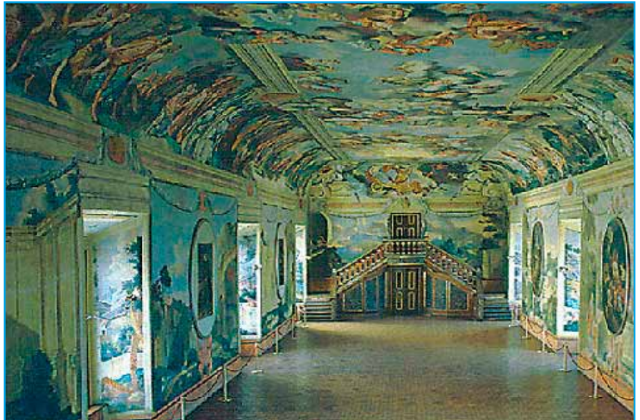
A decorated hall with preserved double staircases at its sides is the best secular painted Baroque space preserved in Slovenia.

Since 1949, the castle has been the home of the Posavski Regional Museum, which contains archaeological and ethnological exhibits, exhibits on the Croatian and Slovenian peasant revolt, and a modern history collection. It is one of the largest regional museums in the country. Concerts and other cultural events take place throughout the year in the Knight's Hall, the largest secular frescoed room in Slovenia, and, in summer, the castle hosts the central concerts of the Brežice Festival of Early Music SEVICQ.