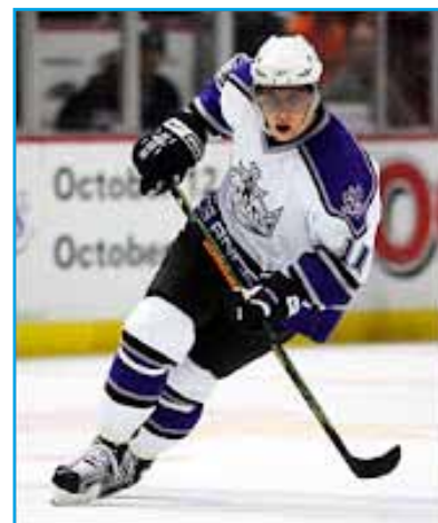
Slovenian hockey player Anže Kopitar of LA Kings.

During their race to the 2012 Stanley Cup Championship, the spotlight was on several players, but there is no doubt that much of attention was focused on the 24-year-old Anže Kopitar from Hrušica. Kopi, as Kopitar is known in Slovenia, is the first Slovenian to play in the NHL and the first Slovenian to win the Stanley Cup. In trying for the playoff lead, he had a starring performance in points (20) and goals (8).