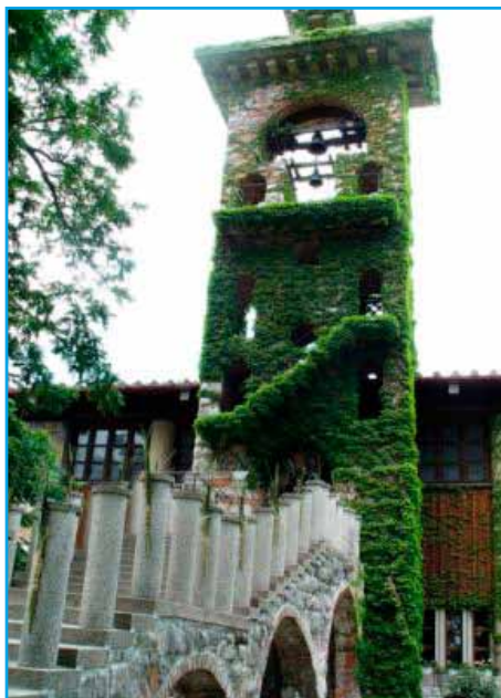
St. Michael's Church in Črna vas was designed by architect Jože Plečnik.

butterflies, and a hundred bird species -- half of all the bird species in Slovenia -- nest in the area. Their number is even higher if they include all the species that come to the Ljubljana Marshes to spend the winter there or stop in the marshes on their way to some