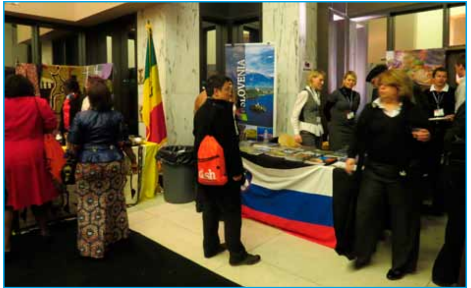
The event was attended by more than 1600 people.

Each year, the highlight of the Francophonie Cultural Festival in Washington, D.C., is La Grande Fête, which this year took place on Friday, March 22 evening at La Maison Française, with more than 35 embassies and organizations presenting its respective culinary specialties and traditions.