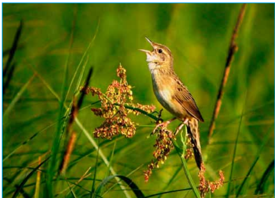
Kobiličar - Grass warbler ( Locustella naevia ) is one of the rare species found in the Ljubljana Marshes.