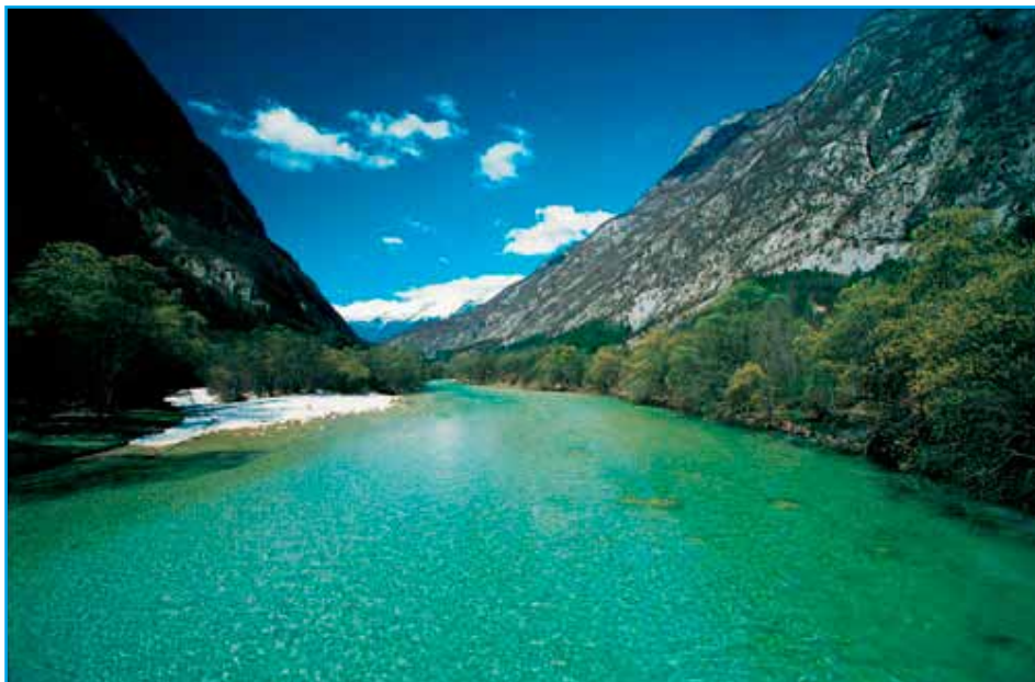
Soča is one of the cleanest Slovenian rivers.

Minister of Foreign Affairs Erjavec stressed that water is becoming an increasingly important item on the foreign policy agenda. Slovenia, with its wealth of natural resources, has a sound basis for enhancing international cooperation in water. In the international arena, Slovenia is engaged in the U.N. Open Working Group on Sustainable