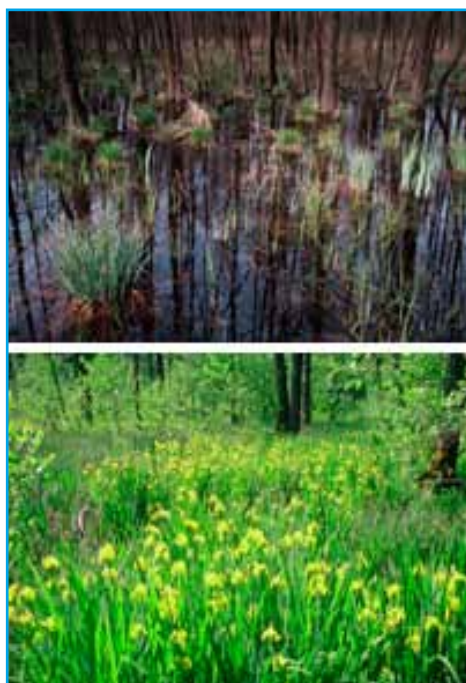
The peat bog, called Mali Plac or Mali Blatec, at Kostanjevica near Bevke.

More information: http://www.ljubljanskobarje.si/?lang=en