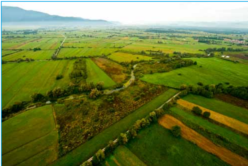
A view of Ljubljana Marshes from hot-air balloon.

The Ljubljana Marshes extend over the south and southeast part of the Ljubljana Basin between the towns of Škofljica, Ig, Podpeč, Borovnica, Vrhnika, Drenov Grič and Brezovica, and measure approximately 100 square miles. The marshes were created by the Ljubljanica River, which flows through them and is named after the capital of Slovenia, Ljubljana.