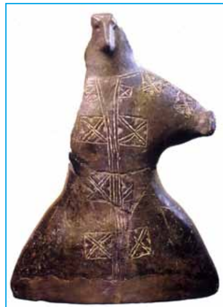
Equrna, the winged goddess of the pile dwelling tradesmen.

An outstanding architectural object in this area is the Church of St. Michael in the village of Črna vas, which was designed by the Slovenian foremost architect, Jože Plečnik, and built between 1937 and 1940. The church is the most beautiful architectural monument on the Ljubljana Marshes. Since the bearing capacity of the marshy ground is weak, the church had to be built on 350 eight-meter (26 ft.) long oak piles. Plečnik decorated