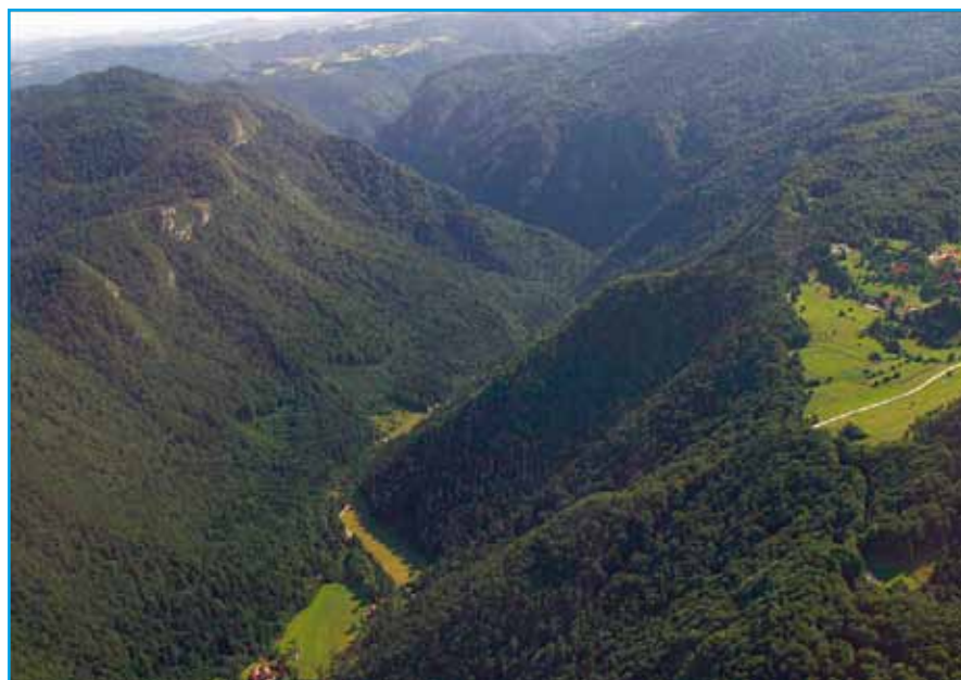
The picturesque gorge of the nearby Iški vintgar is carved deeply in the limestone dolomite plateau by the Iška river.

The picturesque gorge of the nearby Iški vintgar, carved deeply in the limestone dolomite plateau by the Iška river, is one of the most recognizable