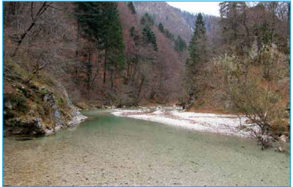
One can find numerous rapids, small cliffs, refreshing green river pools, waterfalls, and other phenomena in the Iška gorge.

natural pearls of Slovenia Its stunningly beautiful landscape attracts swimmers, hikers and cyclists. Along with the numerous rapids, small cliffs, refreshing green river pools, waterfalls, and other phenomena, one can also find indigenous vegetation and numerous animals. Interestingly, the part of the river Iška that runs through the gorge between the villages of Iška vas and Strahomer vanished underground during the night between September 20 and 21, 2010. The river may have moved underground after a crack opened in the riverbed, however, no earthquake was reported.