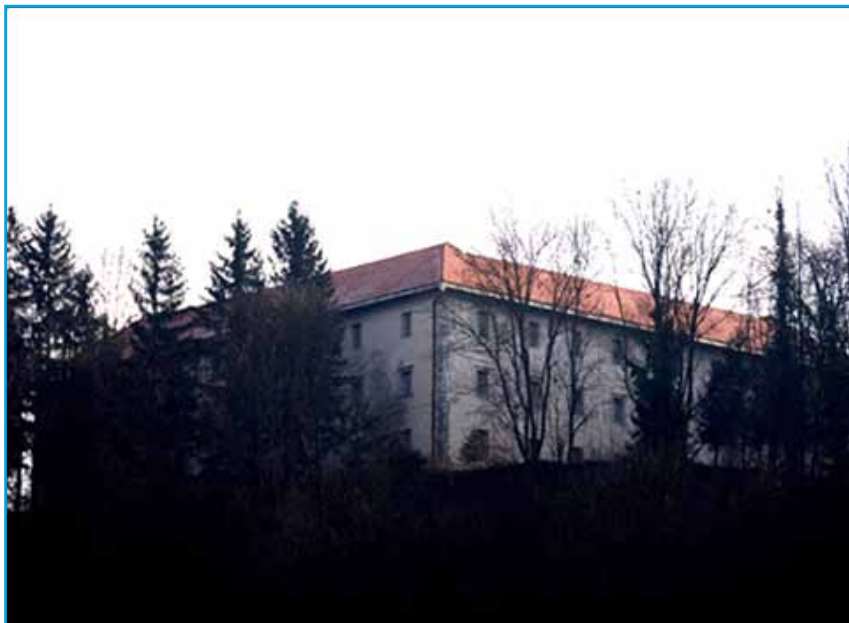
Ig Castle was first mentioned as hof Ig in 1369.

The parish church in Ig, dedicated to Saint Martin, was built in 1780. Another church, built in the 14th century on Pungart Hill west of the main settlement, is now in ruins. Pungart Hill is also the location of