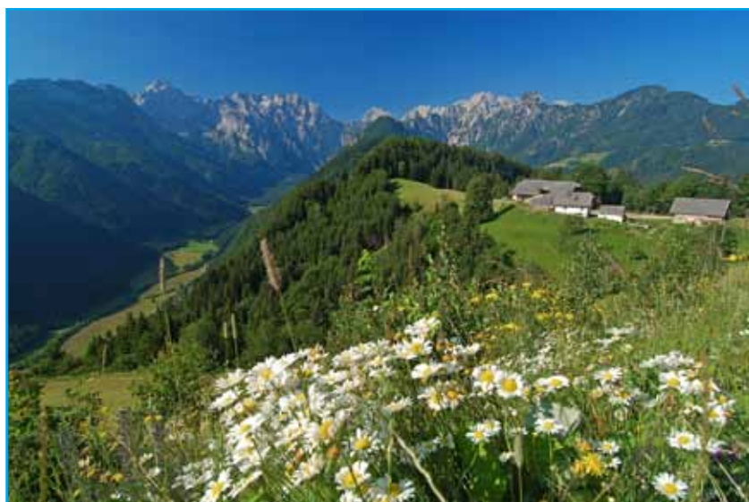
Logarska Valley

The Logar valley lies in the middle and is the longest and