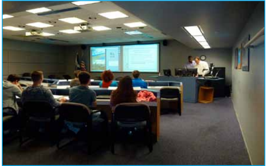
IUPUI-Primorska videoconference.

The primary purposes of the cooperation were to promote cultural and educational exchanges between Indianapolis and Piran. From an early project that included e-mail exchanges between elementary school students in both cities, the program expanded to Skype videoconferences and other projects, such as exchange of books between the Piran and Indianapolis libraries, which resulted in the Indianapolis-Piran Sister City Committee's (IPSCC) suggestion for an "Indianapolis Sister City" section in the Central