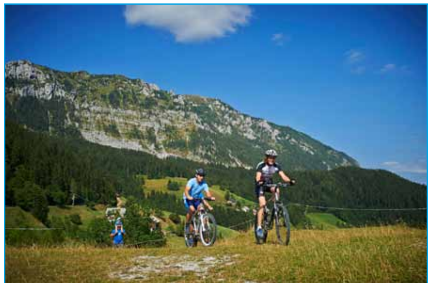
Cycling in Solčavsko. (Photo: http://www.solcavsko.info/ ).