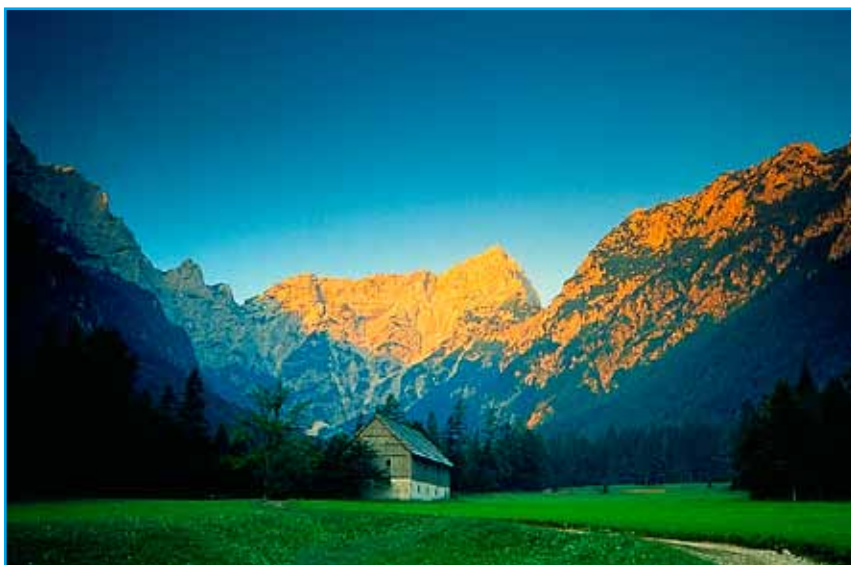
Robanov Kot.

The mountain-encircled Solčavsko is located at the upper course of the Savinja river, which in the distant past cut a narrow gorge through the rocky massive of the Kamniško–Savinjske Alps. The sunny slopes above the Solčava district saw first settlements over a millennium ago, but people used to seek shelter there before that. A small part of the mysteries of its underground caves has already been explored. The most famous among them is the Potočka zijalka cave in Olševa, where 30 thousand–years-old remains of humans have been found. The most valuable finds include stone and bone tools, lances,