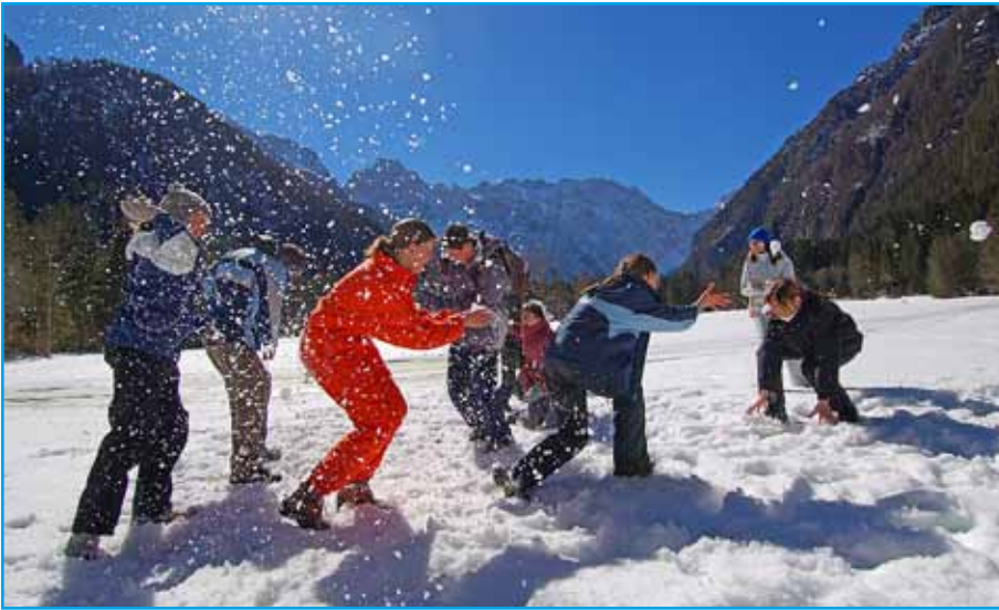
Solčavsko in the winter.

best known valley in Solčavsko. A nature-ethnological trail runs along the valley to Logarski Kot, where past several attractions, the walkers are brought to the magnificent Rinka waterfall at the end of the valley. The Logar valley is a great starting point for mountain trips to mountain huts and, further up, to the peaks of the Kamnik-Savinja Alps.