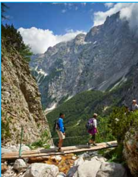
Hiking is very popular activity in this part of Slovenia.

People in Solčavsko have lived in harmony with nature for centuries. Many customs, traditions and beliefs from the past can still be found in the everyday life of the hospitable locals. There are several sustainable development projects going on in Solčavsko, promoting the development of felt products made of wool of the Jezersko-Solčava sheep breed, the development of wooden products made of the Solčava mountain wood, the development of new tradition-based food products, and development of products made of the local stone – the Logar marble. The Rinka Center, which is a multi-purpose center for sustainable development of the area, has been opened in Solčava. In 2009, Solčavsko received the title of European Destination of Excellence for Tourism in Protected Areas. Such a confirmation of our past activities pleases and binds us. For more information contact: mako.slapnik@solcavsko.info or http://www.solcavsko.info/