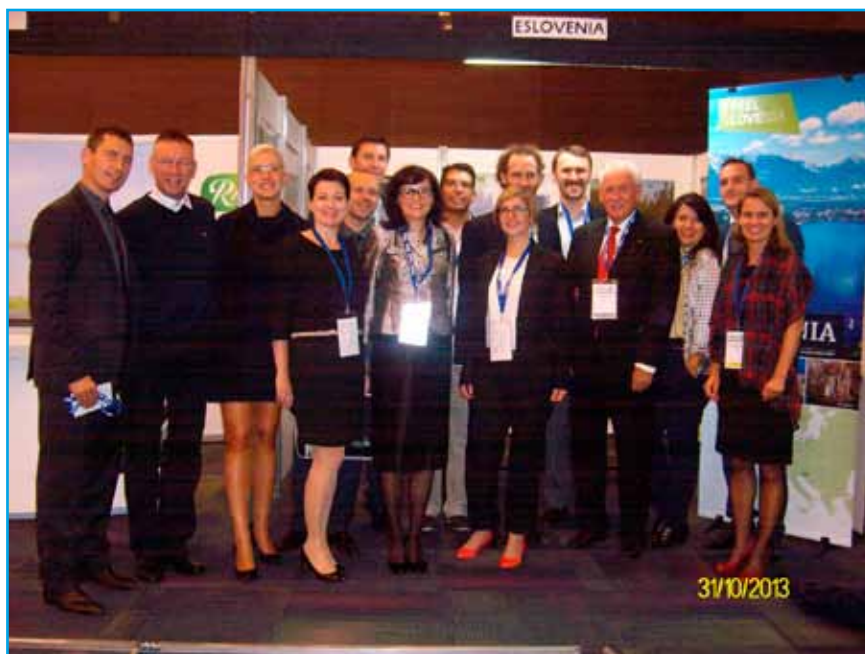
Slovenian business delegation at the event.

One of the highlights of the three-day forum was the conference focused on business opportunities in Slovenia, held on the first day. It featured the companies participating in the delegation,