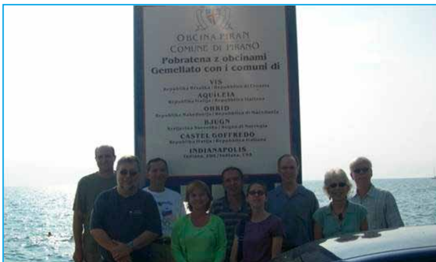
Delegation in Piran.