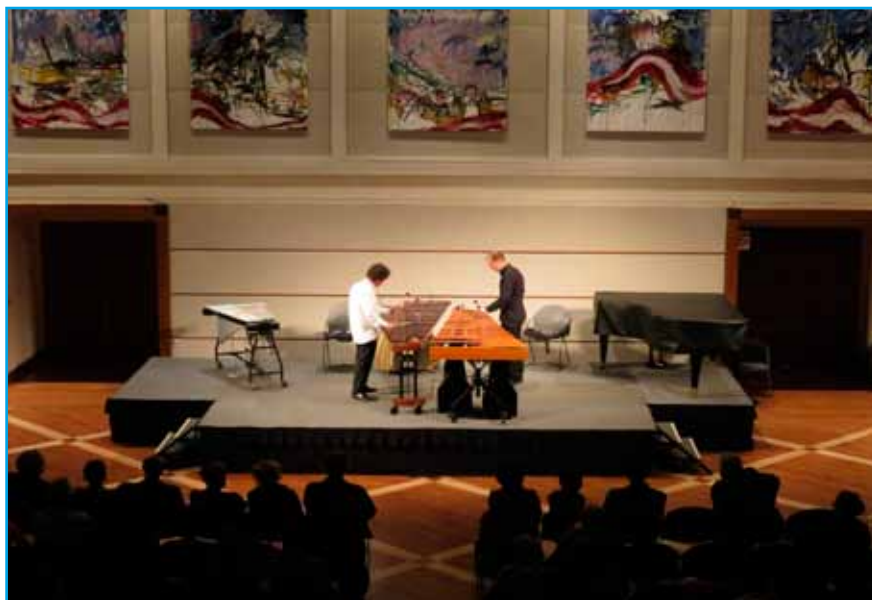
Duo Drumartica presented music by European composers.

The Duo Drumartica is one of the most active percussion ensembles in Europe today. After a great success at prestigious competitions such as IPCL in Luxembourg, PENDIM