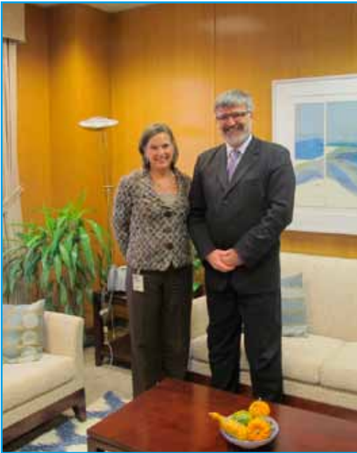
Defense Minister met with Assistant Secretary of State for European Affairs Victoria Nuland.