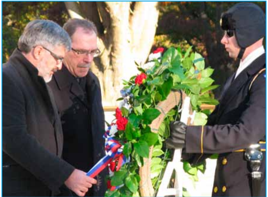
As part of the visit Defense Minister Mr. Jakič together with Ambassador Dr. Cerar presented a wreath at the Tomb of the Unknown Soldier at the Arlington National Cemetery.

countries, Slovenia's engagement in post-2014 Afghanistan, defense spending and regional defense cooperation initiatives. Secretary Hagel expressed his appreciation for Slovenia's close military cooperation, and its valuable contributions to our common security objectives in the Balkans, Afghanistan and at the North Atlantic Treaty Organization (NATO). Secretary