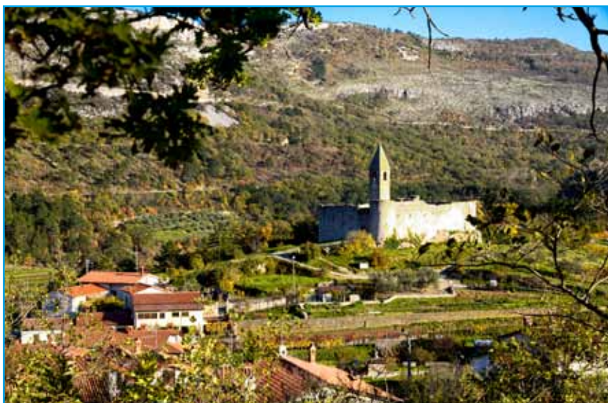
Hrastovlje with the Holy Trinity Church.

The jewel among the monuments of Hrastovlje is undoubtedly the 12th century church of the Holy Trinity. It is an example of a typical Romanesque basilica built of stone blocks with a bell tower attached to it. What distinguishes this particular church from others is