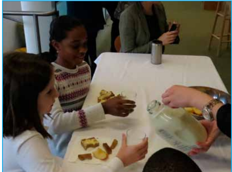
Children breakfasted on brown bread, honey, butter, milk and apples.

In Slovenia, the third Friday in November has ever since 2011 been celebrated as Slovenian Food Day. On that day, Slovenian farmers, agricultural companies, food-processing companies and beekeepers contribute bread, butter, milk, honey and apples to primary schools and kindergartens throughout Slovenia.