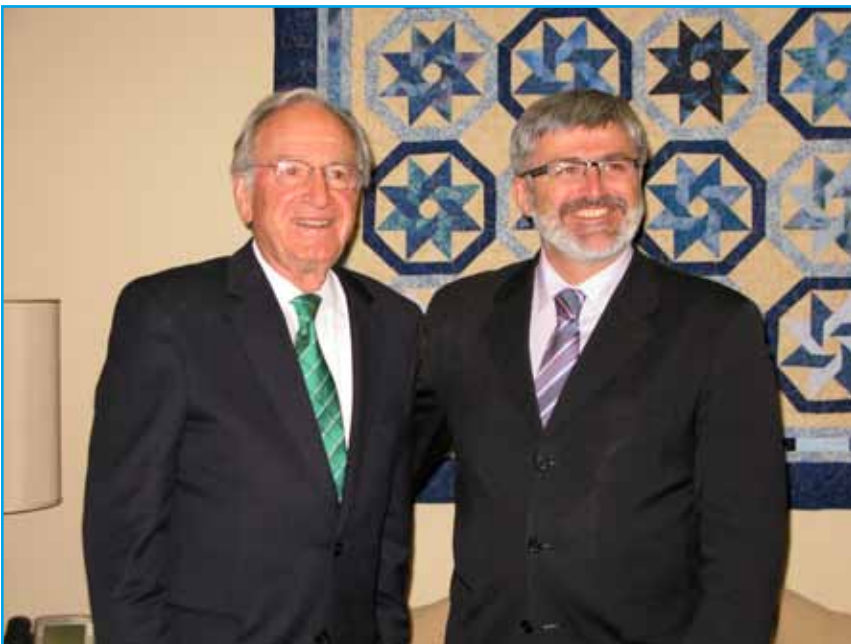
Senator Tom Harkin of Iowa received Defense Minister on Tuesday.