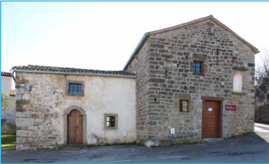
Exhibitions are on display in old Istrian houses.

village church. In the gallery, one can admire some of his paintings, which express a fate full of hope and glory.