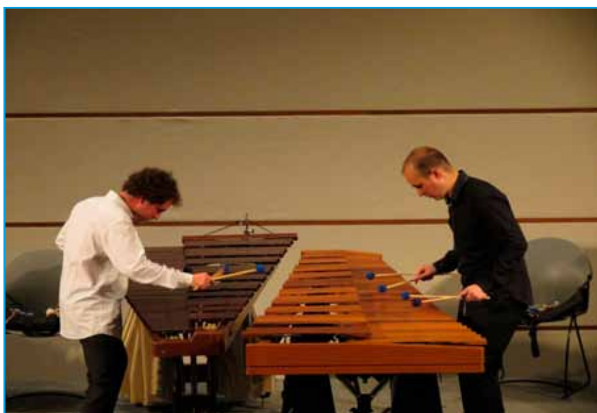
This 60 minutes long program with two marimbas and a vibraphone is a mixture of classical music arrangements and contemporary music pieces.