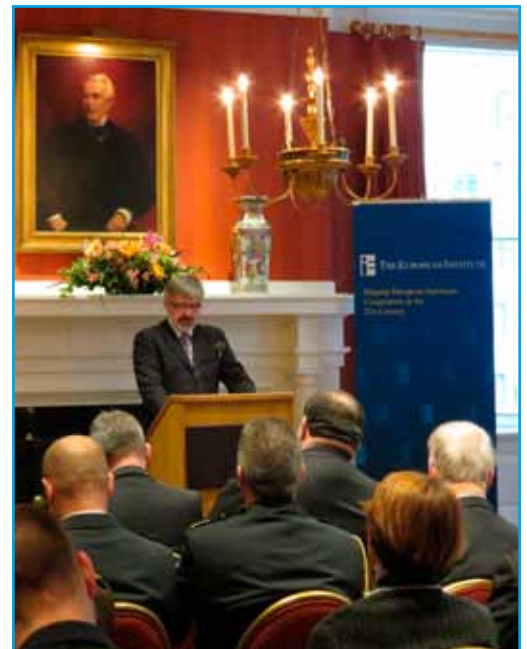
Defense Minister also lectured at the European Institute.