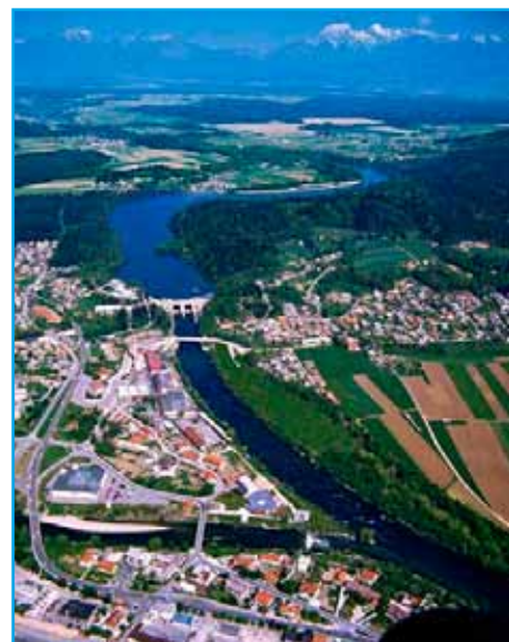
View on Medvode from an airplane.

The territory of the present-day settlement has been inhabited since prehistoric times, a fact demonstrated by the find of a bronze axe during the construction of the hydroelectric plant on the river Sava at Medvode, the traces of a Roman settlement in Rakovnik and by gold coins in Ladja – proof that the area was crossed by important routes linking the Primorska (Littoral) and Koroška (Carinthia) regions with the Gorenjska (Upper Carniola) region. At the southern edge of Medvode, a local road branches off past the Goričane Manor and the famous church of St. Andrew in Gosteče in the direction of Škofja Loka.