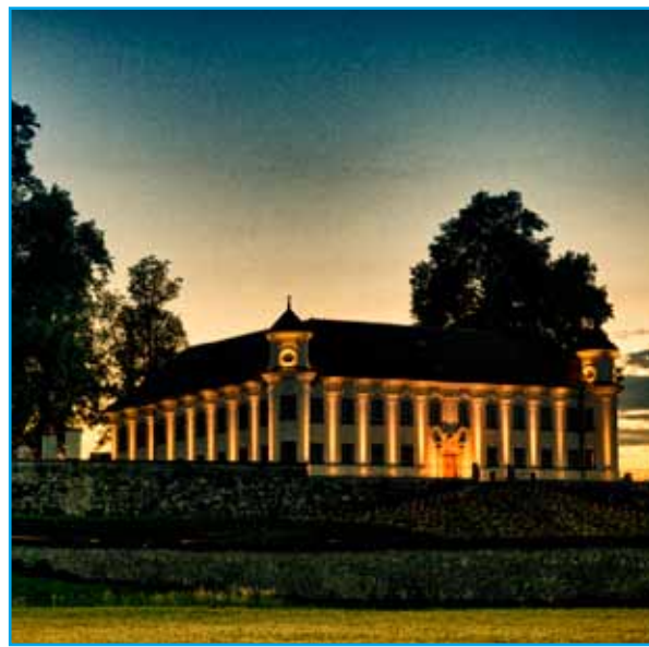
Manor Goričane.