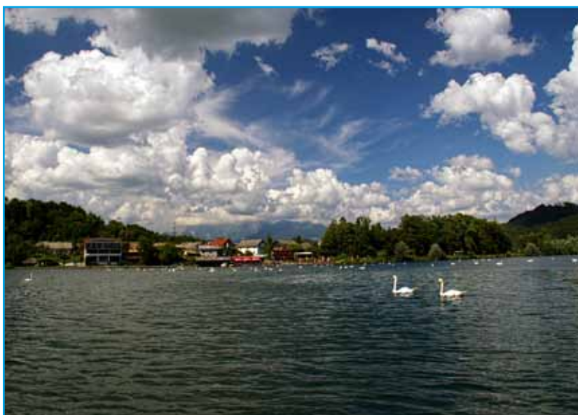
Lake Zbilje

The surroundings of Medvode are full of popular destinations for many visitors looking to take a trip for recreation and relaxation. Geographically, the area is very diverse and is known for its rich vegetation and wildlife. Like the surrounding hills, the plains around Medvode offer many possibilities for walking, hiking, biking trips around the Sora Plain or boating on lake Zbilje.