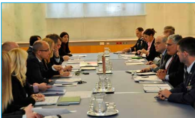
Photo was taken in December 2012 in Ljubljana during last year's political consultations with the U.S.