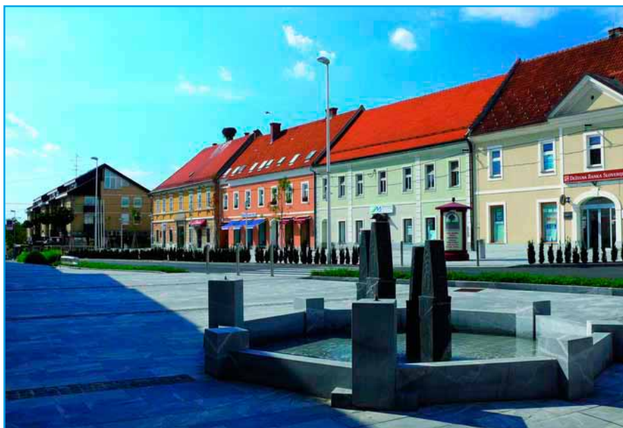
View of Kerenčič Square in Ormož.