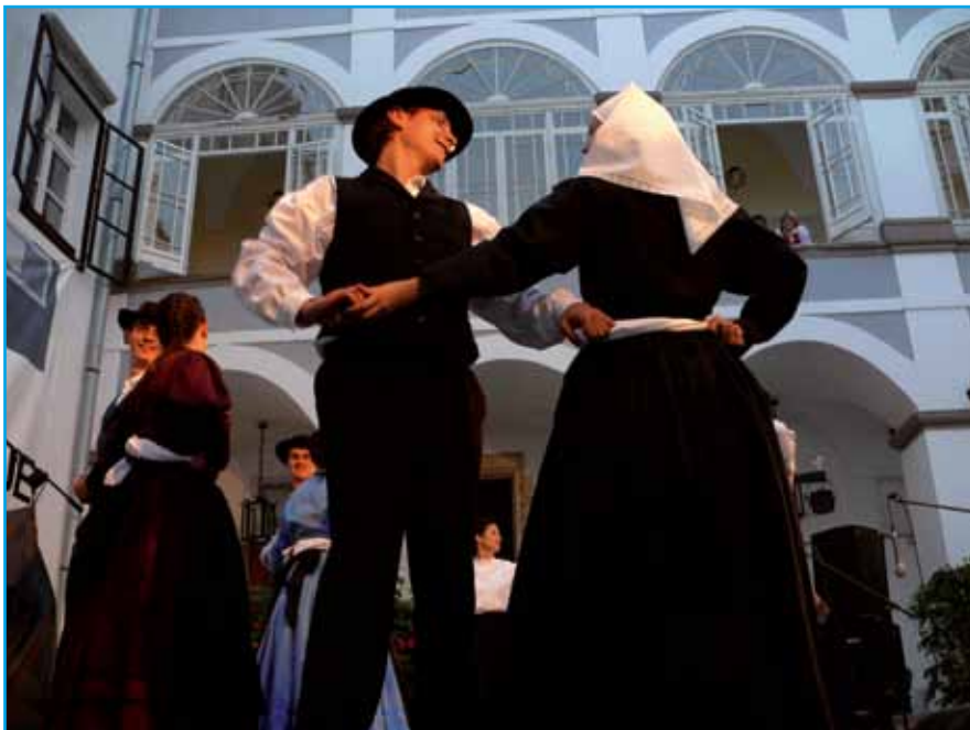
Each year, summer evenings are enriched by a series of events in the courtyard of the Ormož Castle, including theatre shows, concerts, and workshops.

A number of traditional wine cellars stand on the hills surrounding Ormož, typically wooden, straw-covered, with their origin dating back to the 18th and 19th centuries. The locals call such wine cellars 'klečaje' ('klečaja' in singular). Vineyard cottages, wine shops, taverns and tourist farms located in the area offer excellent wine and diverse culinary delights, and are included in the Ormož Wine Route, which is itself suitable for biking, horseback riding, carriage rides and for long walks on well-marked trails. For more information on visiting Ormož see: www.Ormož-info.si or www.slovenia.info/Ormož