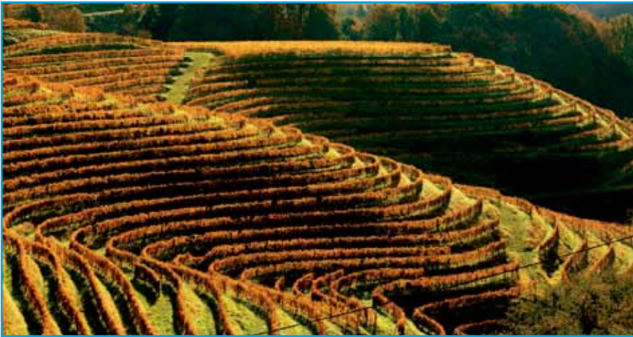
The area around Ormož is known for beautiful terraced vineyards.