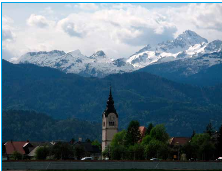
Lesce. (Source of the photos and the text: Krajevna skupnost Lesce at http://www.lesce.si/ )

In the center of the old town, there is a three-nave pilgrimage church, dedicated to the Assumption of the Virgin. Originally a Gothic church with remnants of 14th-century