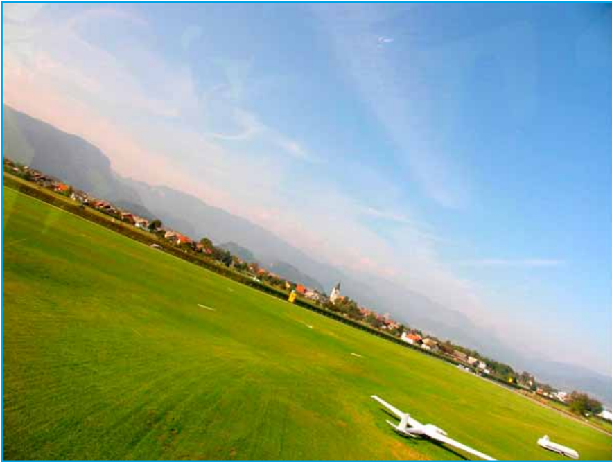
Lesce - Bled Airport.

There is also an airport, Lesce-Bled, operated by a Public Commercial Institution ALC Lesce-Bled. For experienced and ambitious glider pilots, Lesce-Bled can be an ideal starting point for long-distance flights in the direction of Italy, Austria