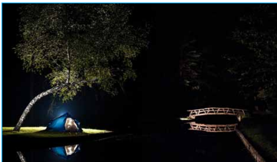
Campside Šobec.

In the late 1950s, the Šobec campground was opened. It is the biggest campground in Slovenia and also one of the best in the country. It is the main provider of accommodation in the municipality and a really popular tourist destination because of its unique location in a pine tree forest and on the left bank of the river Sava Dolinka. Near the campground, there are also wetlands and a stream, carved into the rock.