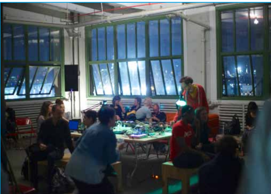
The workshop.

During their stay in the U.S., Theremidi Orchestra also attended the Maker Faire