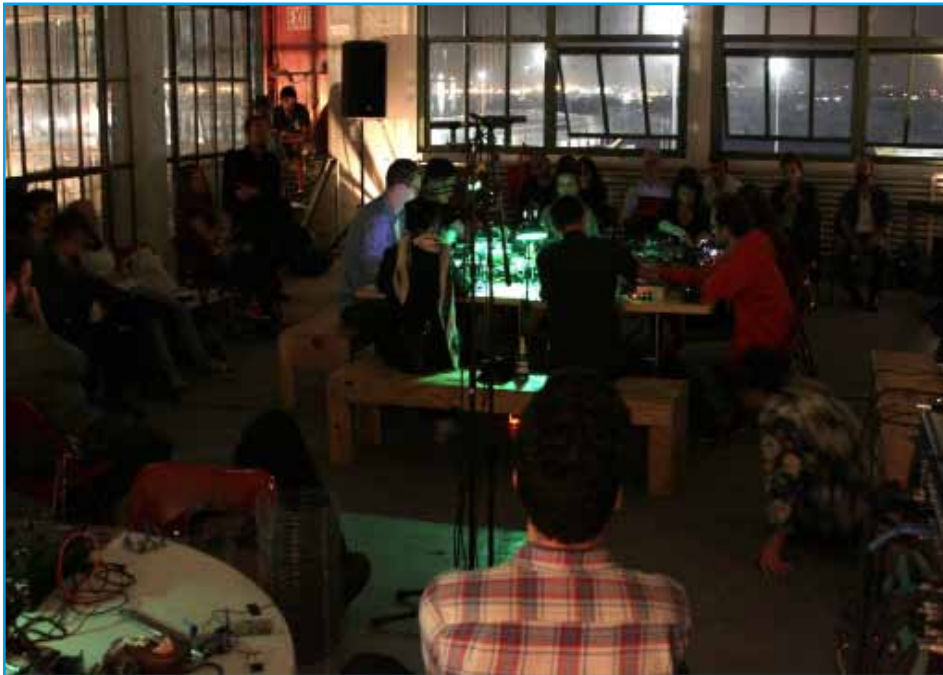
The workshop.

(September 20-21) at the New York Science Hall. Attendance at the Faire, which praises U.S. and international makers, was a great success; the TO's DIY instruments workshop and hands-on stand attracted attention of the Maker Faire board, which bestowed on them 'Best in Class' and 'Editor's Choice' awards.