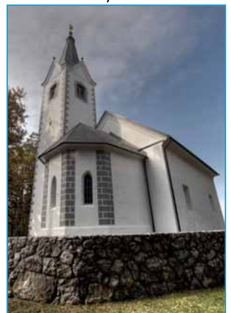
Magdalene Mountain church.

raids. Besides protecting the lives of the inhabitants, the church also served as a safe storage place for the farmers’ food and valuables. The only way to pass to the other side of the wall was across a wooden drawbridge. There are also three watchtowers, which lend a better view of the surroundings. Numerous two-storey crenels were used for shooting with crossbows. A special feature of the church is the arched wall painted with frescoes from the 16th century.