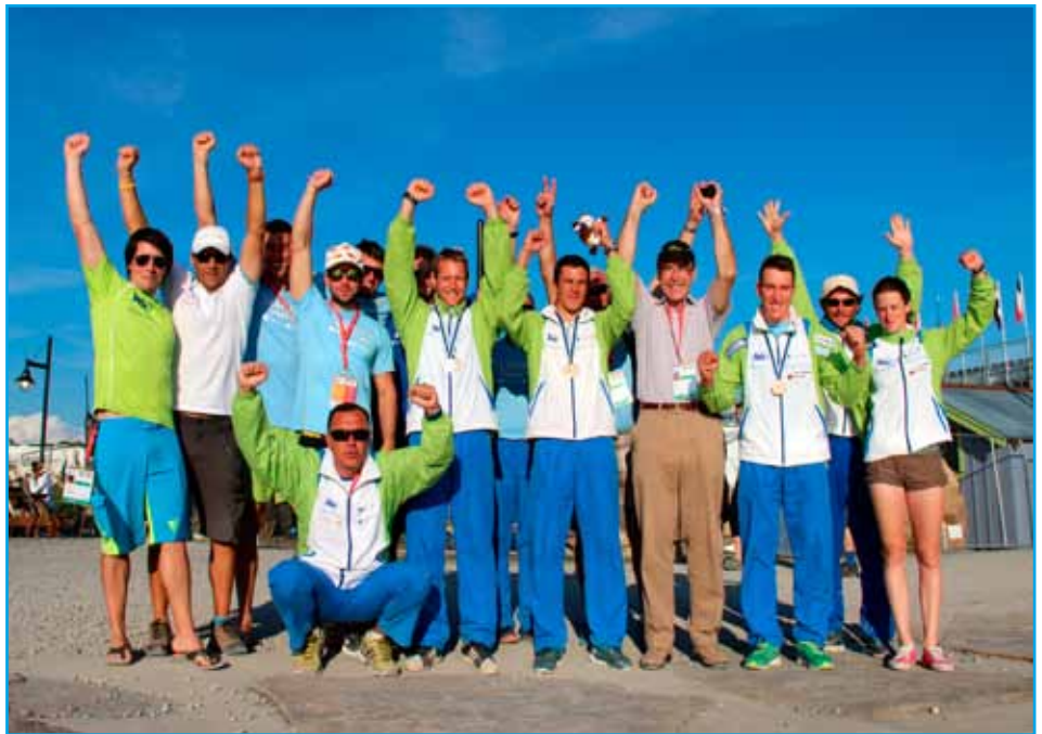
Slovenian canoe team.