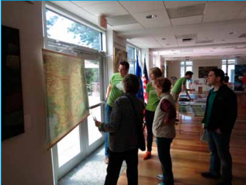
Some 100 guests attended the event.

The 29th Kalorama House and Embassy Tour took place on Sunday, September 15, 2013, from noon to 5 p.m. Organized by the Woodrow Wilson House, this self-guided walking tour and open house featured several Washington embassies and residences in the Kalorama neighborhood, including the Embassy of Slovenia, which traditionally participates in this fundraising event, the proceeds