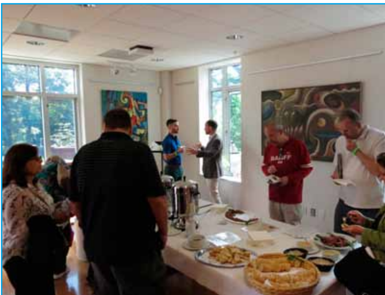
Presenting Slovenian cuisine.

At the Embassy of Slovenia, visitors could taste some of the traditional Slovenian food, such as Carniolian pork sausage and the typical Slovenian festive dessert "potica", a walnut roll cake. They could view an exhibition by Slovenian American artist Miro Zupančič, titled Horizon, listen to Slovenian music, and enjoy watching videos of Slovenian landscape and learn about the economic and business features of Slovenia.