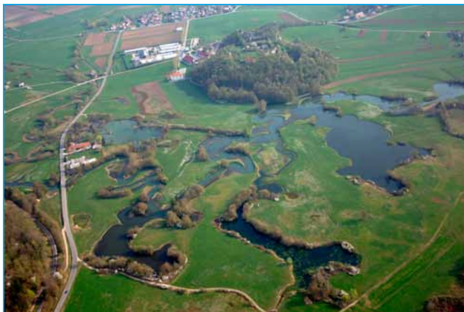
Radensko polje.

through millennia of symbiosis between man and nature. As the smallest of the nine karst fields of Slovenia, it allows us to explore all typical karst phenomena concentrated in a small area. The field is surrounded by steep wooded slopes, while in its middle the isolated limestone hill of Kopanj rises up mysteriously. In autumn and spring, the field turns into a vanishing lake. In