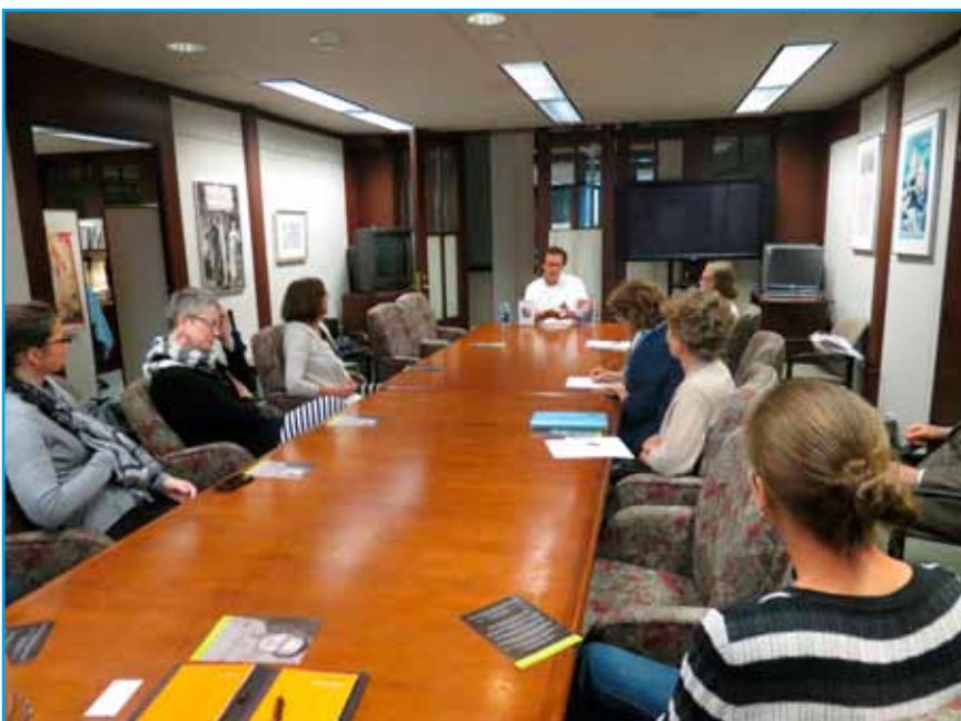
The event was part of the European Division's program.