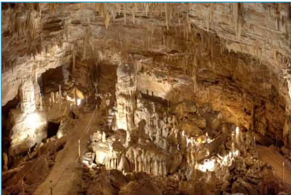
The Mayor’s cave.

This underground treasure of the Slovene Karst boasts all manner of karst phenomena and shapes: stalactites and stalagmites of all shapes and colors, chasms, shafts, calcareous panholes with crystal-clear water and, in the winter, icicles in the Ice Cave. The cave is also home to a number of animals and plants, which have adapted to its dark and damp environment. The Mayor’s Cave is a textbook example of the karst underground. The cave consists of seven beautiful underground halls connected by 600 meters (abt. 2000 ft.) of well-tended walkways.