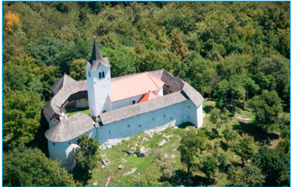
Tabor Cerovo.