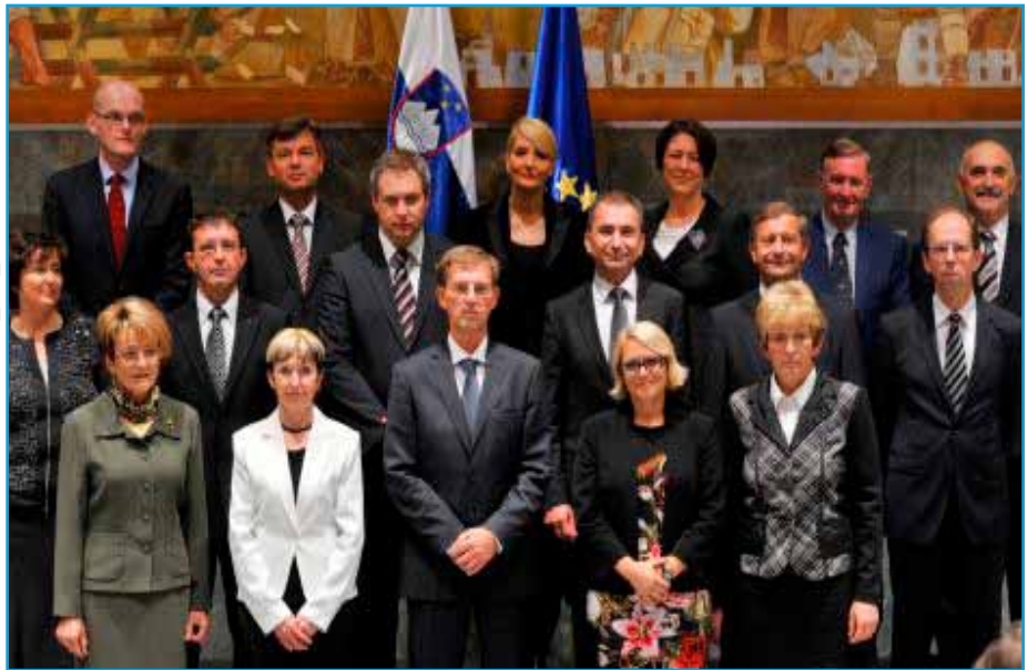
The new Slovenian government lead by Miro Cerar was sworn on September 18th.

The Party of Miro Cerar (SMC), which won the early election on July 13, formed a coalition with the Pensioners' Party (DeSUS) and Social Democrats (SD), both of which had been part of the outgoing Alenka Bratušek cabinet. Thus, four members of the new government will continue at the departments they ran in the former, Alenka Bratušek, cabinet, namely, foreign minister, Karl Erjavec; Gorazd Žmavc, minister