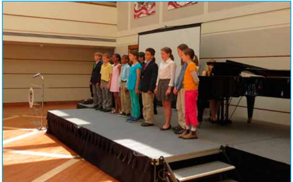
Janney ES students presented Slovenian anthem, a folk song and a traditional tale.

The featured Schools were Capitol Hill Montessori EC, which had been matched with France, the Beers Elementary School, matched with Germany, Garfield Elementary School, which