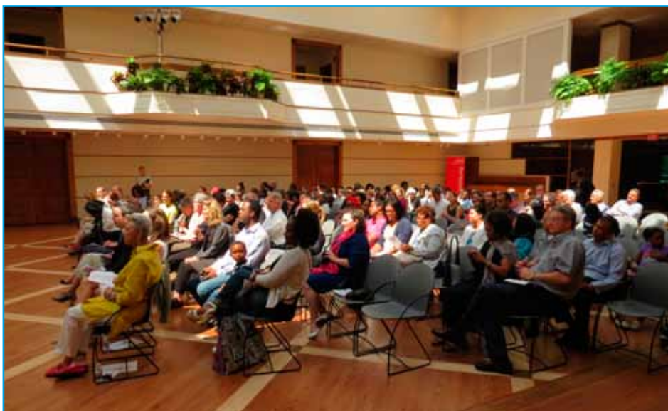
Audience at the embassy of Austria.

and sixth grade students in the District of Columbia Public Schools (DCPS) an opportunity to increase their knowledge about a certain country in the way that culture, government, arts, and geography of other nations were presented by diplomats of respective embassies.