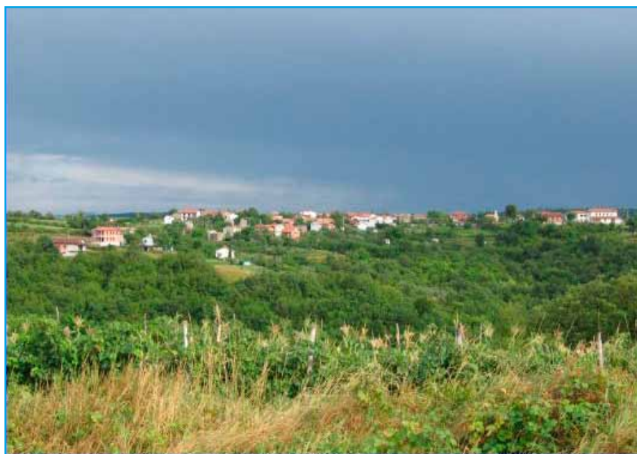
Boršt village lies in Koper municipality.

In the past, the local population was involved in