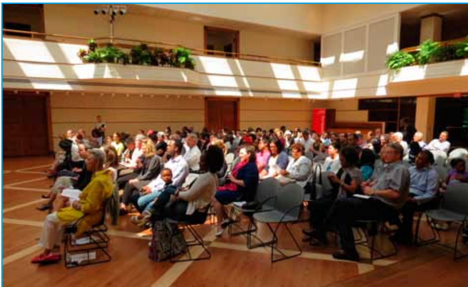
Audience at the embassy of Austria.

and sixth grade students in the District of Columbia Public Schools (DCPS) an opportunity to increase their knowledge about a certain country in the way that culture, government, arts, and geography of other nations were presented by diplomats of respective embassies.