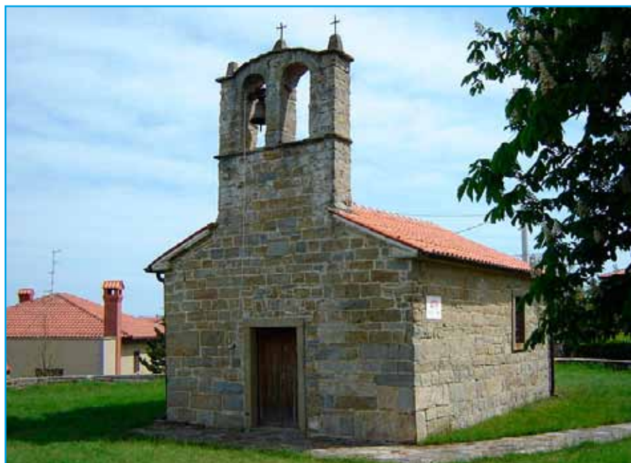
Church of St. Rocco and St. Sebastian (sv. Rok and sv. Boštjan) from the 13th century.