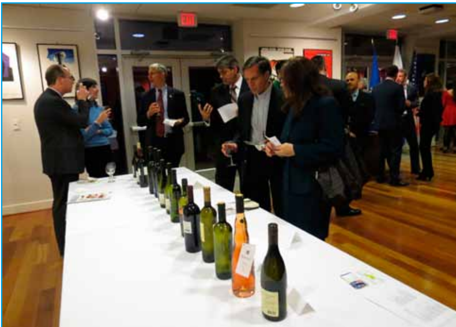
Showcase of Slovenian wines available in the U.S. market.

alphabet, dictionary and useful phrases. The Žepna slovenščina guide of 125 pages was recently translated, besides English, also to 22 other languages by the Centre for Slovene as a Second Language on the occasion of the Days of the Slovene language, celebrated in more than 50 universities worldwide from December 1 to 5.