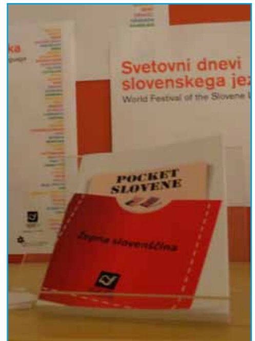
To order Pocket Slovene send an e-mail to: knjigarna@ff.uni-lj.si