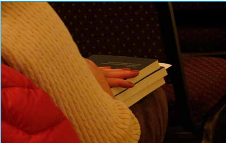
Boris Pahor is best known for his novel "Necropolis" .

2010, showcases the key moments which marked the author's life and present the core of his literary creation. The film was made as a part of a "Sons of Two Nations - Great Men of Slovenia" project, which presents the lives of people who have made an impact in the multi-cultural area between Italy and Slovenia.