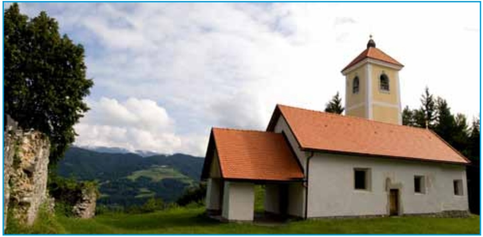
Church of St. Agnes.

visitors can revel in other priceless architectural monuments: St. Luke's Church in Spodnje Prapreče, a unique example of Gothic church architecture in Slovenia; St. Agnes' Church in Golčaj above Blagovica with its Renaissance-panelled ceiling; and St. Margaret's Church in Gradišče near Lukovica, with its Gothic frescoes. Southeast of the settlement, at the Gradiški grič foothill, there is the Gradišče lake, which represents the wet retarding basin on the Drtijščica creek. The greatest feature and quality of this area is a dynamic relief, where the steep surfaces are covered by forests and the southern slopes, which are less steep, are covered by meadows with strips of trees, bushes and overgrown ravines. The bottom of the valley is mostly a marshy terrain with abundant marsh vegetation. The Drtijščica creek is enclosed by strips of forests. The biological diversity of the area and its remoteness from urban centers allow the area to be used for recreational and sporting