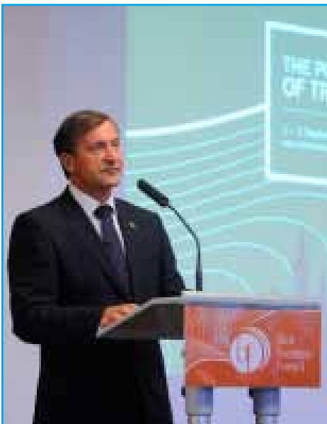
Address by Minister of Foreign Affairs Karl Erjavec.

affairs, held talks with President Borut Pahor on the margins of the Bled Strategic Forum. He stressed that the U.S. “greatly appreciates” cooperation with Slovenia through NATO, where “we are able to work side-by side with our soldiers in some of the most difficult places in the world”. However, he also said that he would like to see even greater and stronger commerce and trade between the two countries.