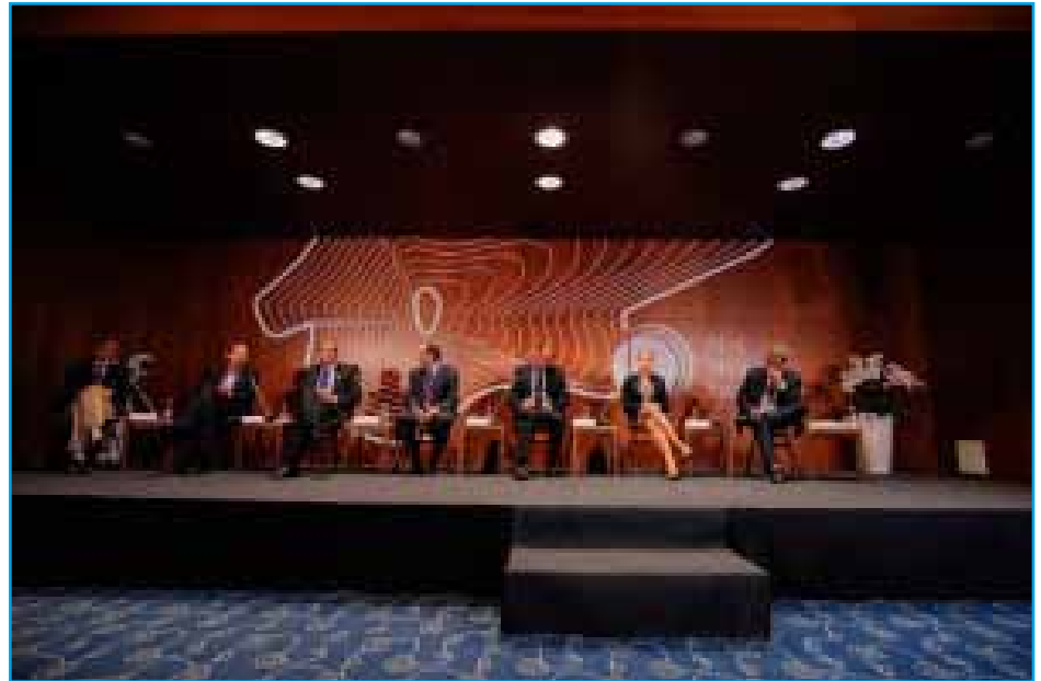
A panel on regional cooperation.

The Business Bled Strategic Forum was tied in with the Young Bled Strategic Forum as a part of which teams of business students were given the task of coming up with new ideas for the management of Slovenia’s forests. The prize went