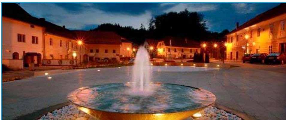
Fountain in the center of the town.