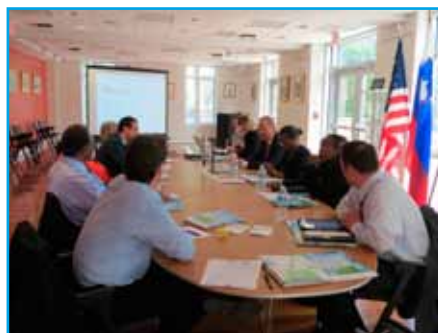
Conference with POLIMAT.

40th anniversary. While in New York, the ambassador also attended an event launching Slovenia Vodka, made from Slovenian buckwheat. On April 24, the Embassy of Slovenia in Washington, and Polimat Centre of Excellence in cooperation with the Embassy of Kenya hosted a high-level event featuring a presentation and discussion of cutting-edge biopolymer projects in medicine, agriculture and waste management. Slovenian Finance Minister, Dr. Uroš Čufer, and the Governor of the Slovenian central bank, Marko Kranjec, paid a visit