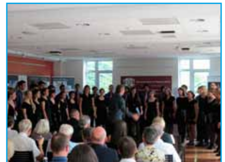
Megaron concert and 10 years of SUA Br. 108 celebration.

As traditionally on the first Friday of October , the Embassy of Slovenia, on October 4, 2013, hosted the annual meeting of consuls general and honorary consuls of the Republic of Slovenia in the United States. On Saturday, October 5, as part of the celebration of the 10th anniversary of Washington area's Slovenian Union of America's Branch 108, the Megaron Chamber Choir from Ljubljana, Slovenia, performed at the Embassy of Slovenia. During its U.S. tour, the chamber choir also performed in Cleveland, OH, Bethlehem, PA, Salisbury, MD, and Annapolis, MD. Slovenian Finance Minister Uroš Čufer and the new Governor of the Slovenian Central Bank, Boštjan Jazbec, paid a visit to Washington to attend the annual meeting of the IMF and the World Bank. The Investment and Development Conference U.S.-Slovenia Business Bridge took place in Ljubljana, Slovenia, on October 17-18, 2013, attended by more than 800 participants. On Friday, October 25, the Embassy of Slovenia joined the Oneness-Family School in Chevy Chase, Maryland, for the annual