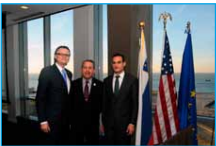
S-ABA conference organized by Consulate General in Cleveland.