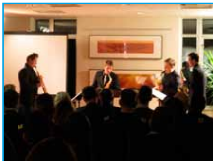
Concert by 4Saxess quartet.

Slovenian food, wine, art works, and a musical performance by the Slovenian saxophone quartet 4Saxess. With the support of the Slovenian Embassy in Washington, the Slovenian community in New York marked the Cultural Day by organizing a concert by the same quartet at St. Cyril's Parish in New York. The musicians also held a concert in Salisbury, Maryland and Hartford, Connecticut.