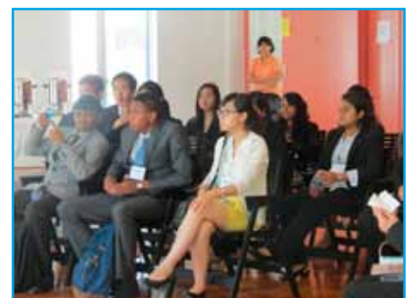
Global young leaders at the embassy.