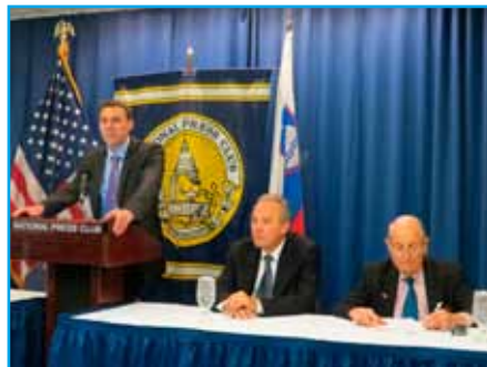
Finance minister Čufer in D.C.

in Kansas City with the movie "Bread and Circuses", and -- as traditionally -- in the European film festival Disappearing Act V in New York with the film "Feed Me with Your Words". On April 20, Ambassador Kirn participated in a round table at Columbia University, organized by the Society for Slovene Studies, which in 2013 celebrated its