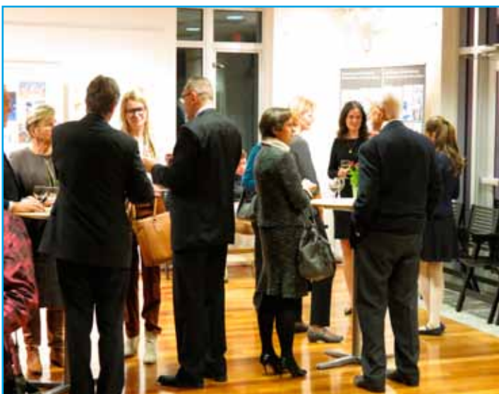
Ambassador wished all the guests a happy new year.