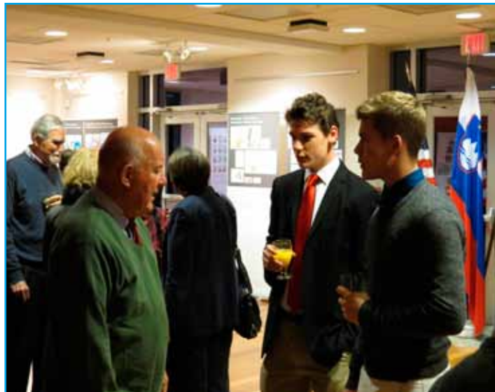
The reception was attended by local Slovenian community members and their families.

who voted and 88.5% of all eligible voters) that Slovenia had six months after the plebiscite to conduct disassociation talks with the other Yugoslav republics and persuade foreign countries to grant recognition to the new state. The plebiscite took place following the first multi-party election in Slovenia in April of 1990.