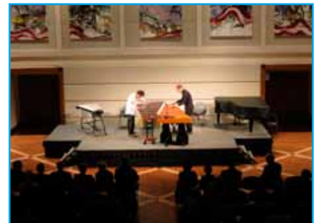
Duo Drumartica performs the first concert of EUNIC Concert Series.

for U.S. Companies. The Embassy of Slovenia, together with the tourist agency Imperial Travel from Slovenia organized in Washington a presentation of Luxury Slovenia brand. As part of the year-long Embassy Adoption Program, Slovenian embassy officials on November 6, 15, and 25, as well as December 5 visited Janney Elementary School, where they presented Slovenian culture, customs and history, and also served the traditional Slovenian breakfast. As part of the first season of the EUNIC Washington Concert Series, Slovenian percussion duo Drumartica performed at the Embassy of Austria in Washington. Playing on two marimbas and a vibraphone, the musicians presented music from different corners of Europe. On Wednesday, November 20, the Embassy of Slovenia hosted members and guests of the Young Professionals in Foreign Policy community, who were