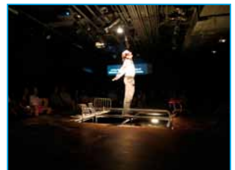
Nijinsky's Last Dance at Mead Theatre.