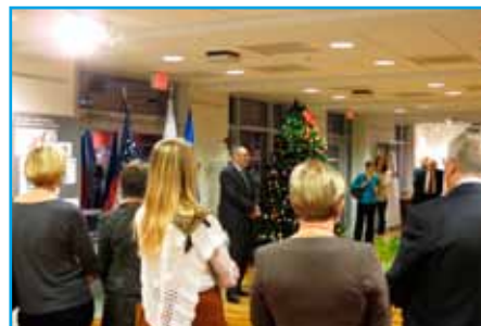
Independence and Unity Day Reception.