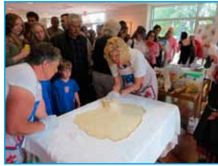
EU Open House at the embassy.