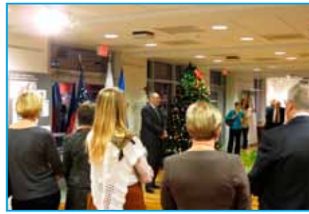
Independence and Unity Day Reception.