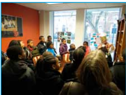
Turner ES students visited the embassy in January.