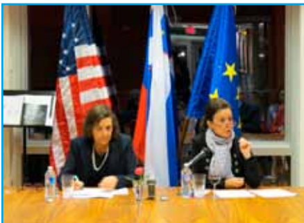
Event with Women's Foreign Policy Group.