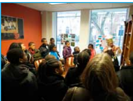
Turner ES students visited the embassy in January.