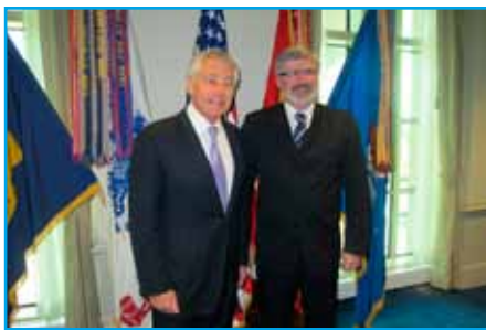
Defense Minister Jakič meeting with U.S. Defense Secretary Hagel.