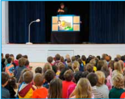
Fru Fru Theatre at Kids Euro Festival.

celebration honoring the United Nations Day. From October 27 to October 30, the FRU-FRU Puppet Theatre from Ljubljana, as part of the Kids Euro Festival, entertained its audiences with the show My Umbrella Can Be a Balloon, Too! The sixth annual Kids Euro Festival, organized by E.U. member-states is one of the largest performing arts festivals for children in the U.S.