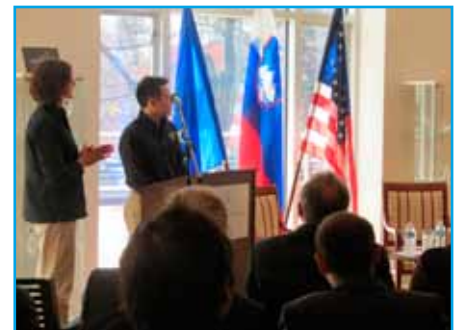
Astronauts Sunita Williams and Akihiko Hoshide lectured at the embassy.