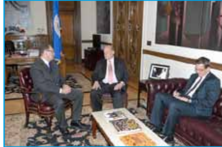
Ambassador with OAS Secretary General Insulza.