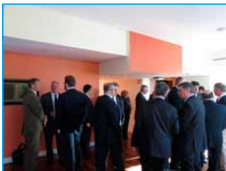
15 years of ITF.