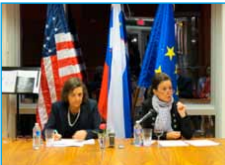
Event with Women's Foreign Policy Group.