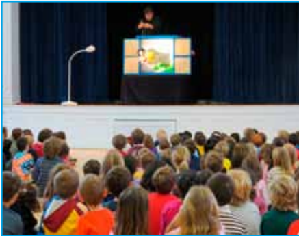
Fru Fru Theatre at Kids Euro Festival.

celebration honoring the United Nations Day. From October 27 to October 30, the FRU-FRU Puppet Theatre from Ljubljana, as part of the Kids Euro Festival, entertained its audiences with the show My Umbrella Can Be a Balloon, Too! The sixth annual Kids Euro Festival, organized by E.U. member-states is one of the largest performing arts festivals for children in the U.S.