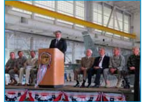
Defense minister Jakič in CO.

parish of the Holy Cross in Fairfield. The embassy hosted a sale exhibition of works by local artists to fund the non-governmental organization Sukyo Mahikari. At an event, held at the Embassy of Bahrain,