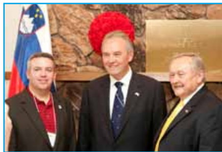
Opening of honorary consulate in MN.