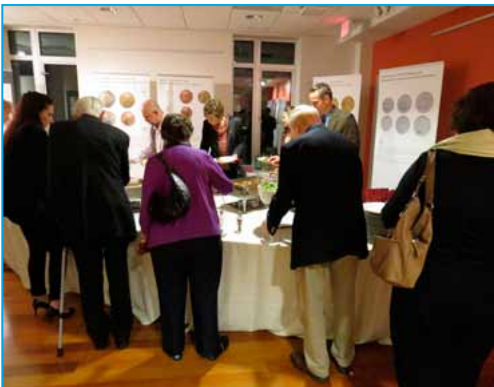
Slovenian food and wine were served on the joyous occasion.