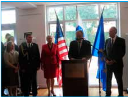
Senator Harkin addressed guests for the National Day of the Republic of Slovenia.

Groups of high-school students participating in the Global Young Leaders Conference, which took place in Washington, last summer, visited the Slovenian Embassy in June and July to learn about the country and its role in the international community. Slovenian high school students