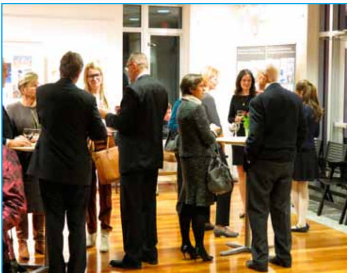
Ambassador wished all the guests a happy new year.