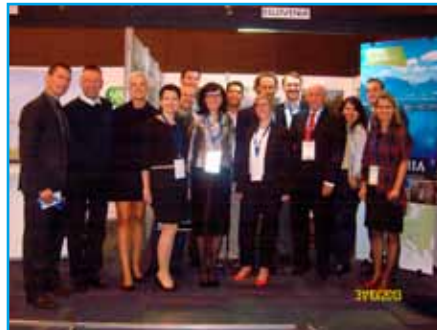
Slovenian business delegation at Americanallia in Mexico.