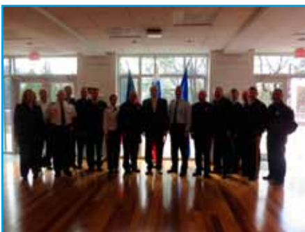
Colorado National Guard annual visit to the embassy.