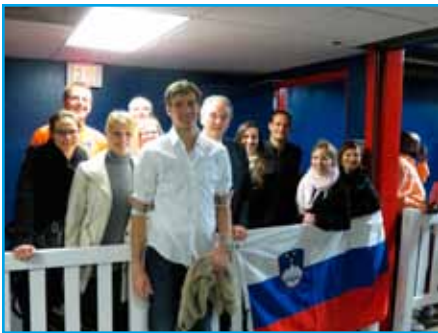
Embassy staff met with Goran Dragič.