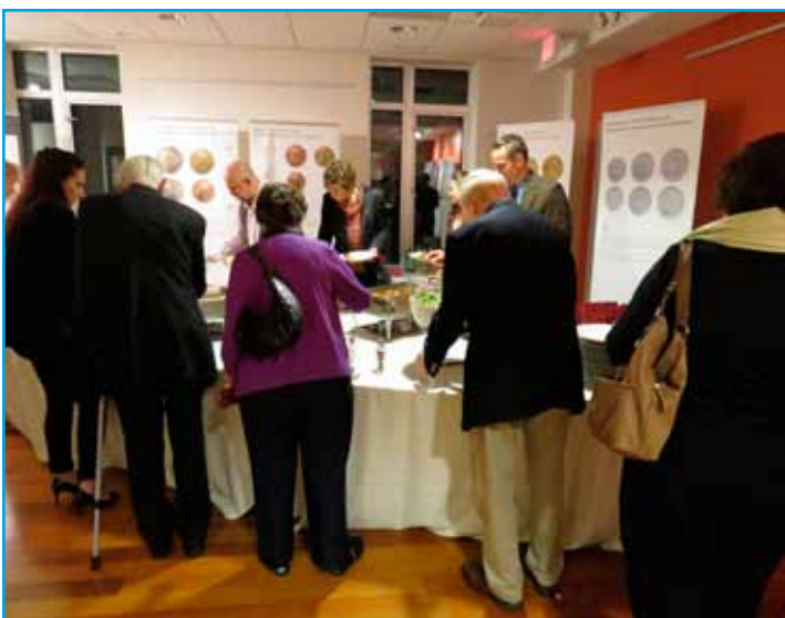
Slovenian food and wine were served on the joyous occasion.