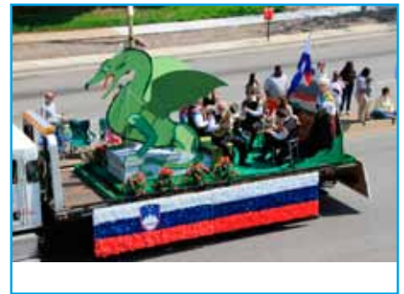
NATO Fest in Norfolk took place in April.