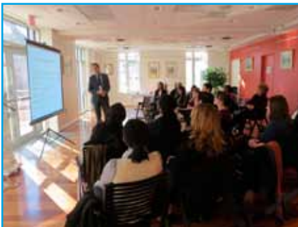
Marymount University students at the embassy.