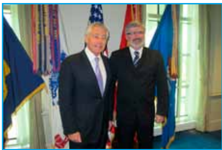
Defense Minister Jakič meeting with U.S. Defense Secretary Hagel.