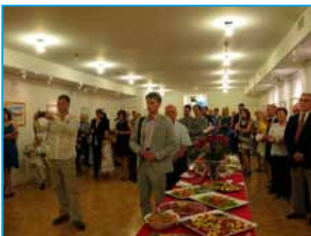
Reception in New York.

took part for the third time in the U.S. Department of State's Youth Leadership Program with Central Europe (YLPCE), organized by the Meridian International Center. In Slovenia, for the third successive year, the Government's Office for Slovenians Abroad sponsored the annual homecoming event for Slovenians living abroad, entitled "Welcome Home" and the Government Council for Slovenians Abroad met in a session. U.S. representatives on