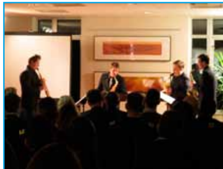
Concert by 4Saxess quartet.

Slovenian food, wine, art works, and a musical performance by the Slovenian saxophone quartet 4Saxess. With the support of the Slovenian Embassy in Washington, the Slovenian community in New York marked the Cultural Day by organizing a concert by the same quartet at St. Cyril's Parish in New York. The musicians also held a concert in Salisbury, Maryland and Hartford, Connecticut.