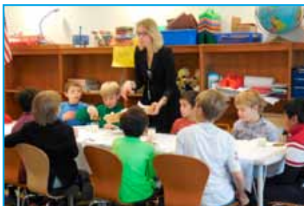
Traditional Slovenian Breakfast at Janey ES.

book Necropolis , written by Boris Pahor, a Slovenian writer, who celebrated his 100th birthday on August 26, 2013. An excerpt from Necropolis was published also in the U.S. on the Storyville