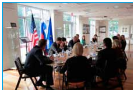
The annual meeting of honorary consuls.