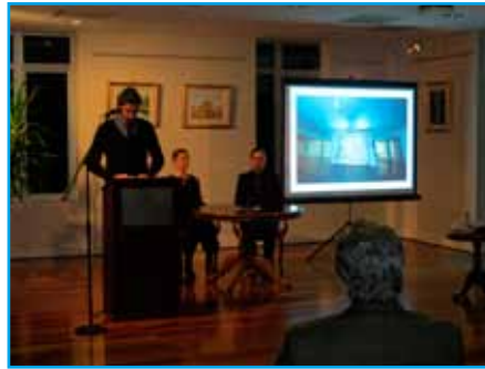
Structure of Life project.

In early March , when Slovenian singing group Perpetuum Jazzile toured the U.S., the Embassy of Slovenia actively participated in the organization of its concert at the Listner Auditorium in Washington, the embassy also participated in the promotional event International Night at Kensington Parkwood EC School in Maryland. Lehigh University's students from PA visited the embassy prior to their research trip to Slovenia in May. At the event of La Grande Fête de la Francophonie, held annually at the French Embassy during