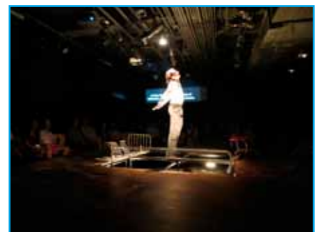
Nijinsky's Last Dance at Mead Theatre.