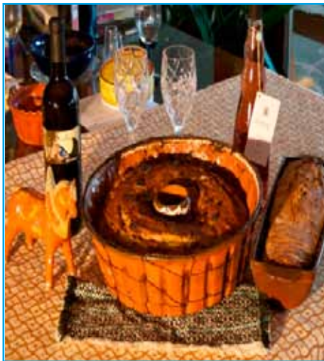
A long day of baking is rewarded by slices of potica and some excellent Slovene organic wine.