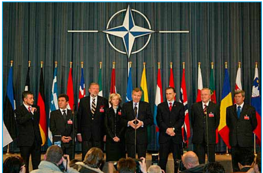
Ceremony in Brussels 10 years ago.

Since the beginning of its membership, Slovenia has participated actively in debates and drafting policies within the Alliance. In the past decade, Slovenia has contributed a great deal to the credibility of the Alliance and to collective and national security by participating in NATO-led operations and exercises, by contributing its proportional