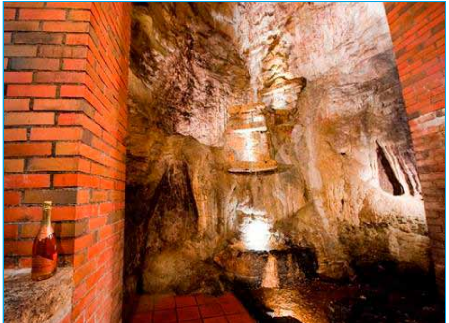
Cellar under a waterfall.