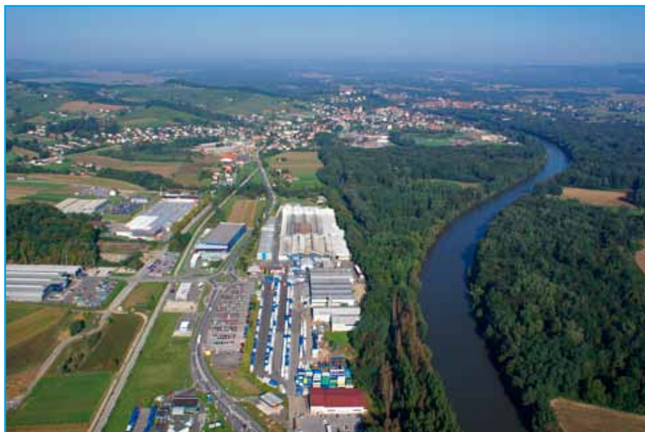
Gornja Radgona and the Mura river.

Gornja Radgona was once a defensive stronghold for today's Slovenia's regional center and its twin city, Bad Radkersburg, on the other side of the Mura River in Austria. The towns were split in 1919, when the province of Styria was divided between Austria and Slovenia. After that, they developed separately and Gornja Radgona grew into a new town center.