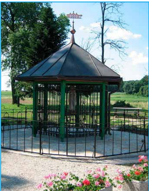
The surroundings of Gornja Radgona are rich on mineral water springs.

army equipment, and building. Two other significant fairs are connected with local patron saints: Petrov sejem (St. Peter's Fair) on June 29, and Leopoldov sejem (Leopold's Fair) on November 15, which runs simultaneously in Gornja Radgona and across the border in Austrian Bad Radkersburg. For more information visit: http://kultprotur.si