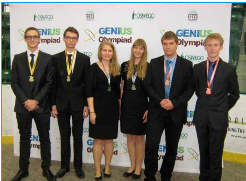
Six students from Slovenia were honored the awards.