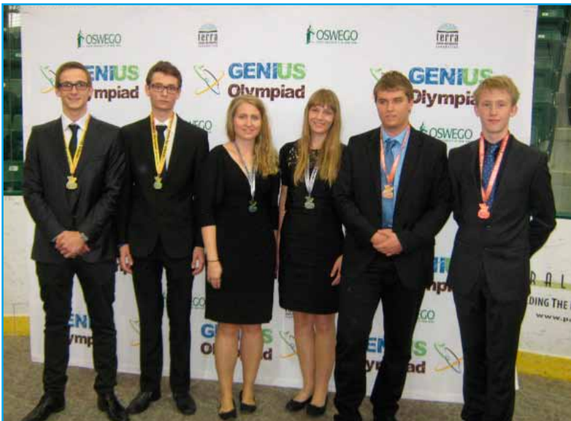
Six students from Slovenia were honored the awards.