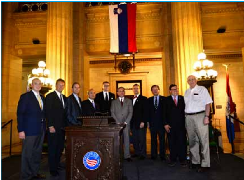
Reception was held at the City Hall in Cleveland.