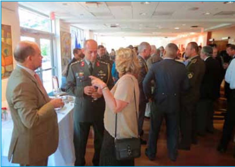
Around 250 guest attended the reception.