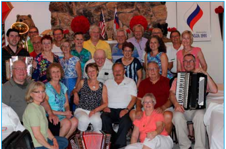
There were 72 people celebrating the 23rd anniversary of Slovenian Independence at the Consulate of the Republic of Slovenia in St. Paul, Minnesota.

There were 72 people celebrating the 23rd anniversary of Slovenian Independence at the Consulate of the Republic of Slovenia in St. Paul, Minnesota, on Saturday, June 21. The National Day was celebrated in conjunction with the annual Twin Cities Slovenians dinner and featured a "balinanje" (bocce ball) tournament for which 32 people signed up. Unfortunately, the tournament had to be cancelled due to excessively wet conditions caused by a record amount of rain this June. This was unfortunate, not only because the guests didn't get to play, but also because "Trije Prijatelji" (Three Amigos), as the community affectionately