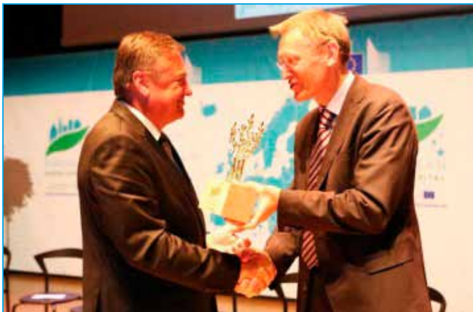
Zoran Jankovič, Mayor of Ljubljana, receiving the European Green Capital Award from commissioner Janez Potočnik.

The European Green Capital Award is an annual event that promotes and rewards the efforts of cities that are committed to improving the urban environment. The award is given to a European city that has a well-established record of achieving high environmental standards and is committed to ongoing and ambitious goals for future environmental improvement and sustainable development.