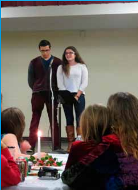
More performances by children of the local Slovenian community.

on December 6, along with other small gifts, cookies, dried fruit and, sometimes, if they hadn't been so good, a switch. Special bread, called poprtnjak, is made at this time. The bread is covered with a cloth and placed on the table, but it is not eaten until the feast of the Three Kings on January 6, when it is distributed to the children.