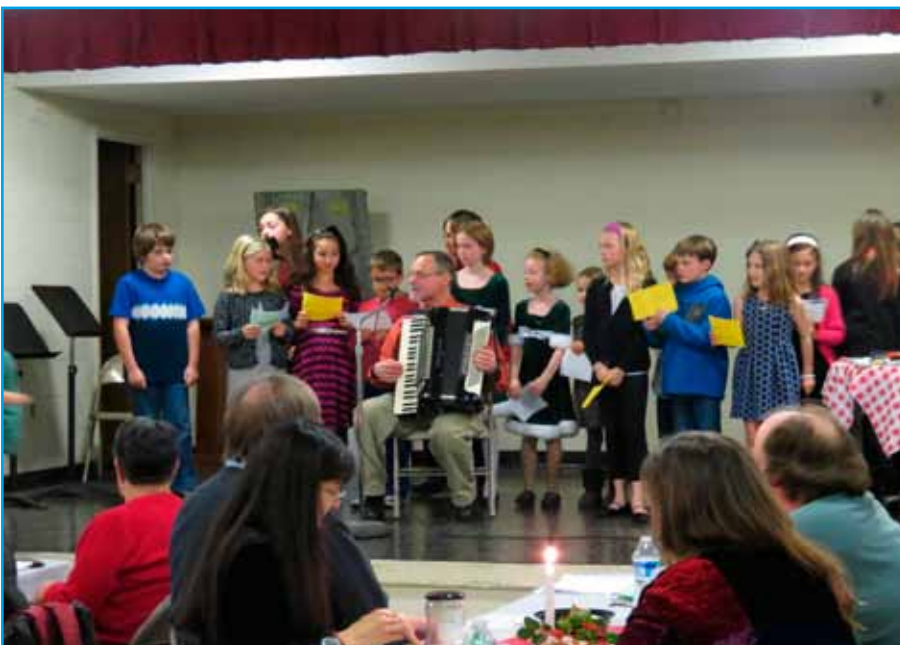
Children singing traditional Slovenian songs.

Afterwards, Slovenian foods, including traditional pastries and Carniolian sausages with sauerkraut, were offered at a buffet dinner, which provided a