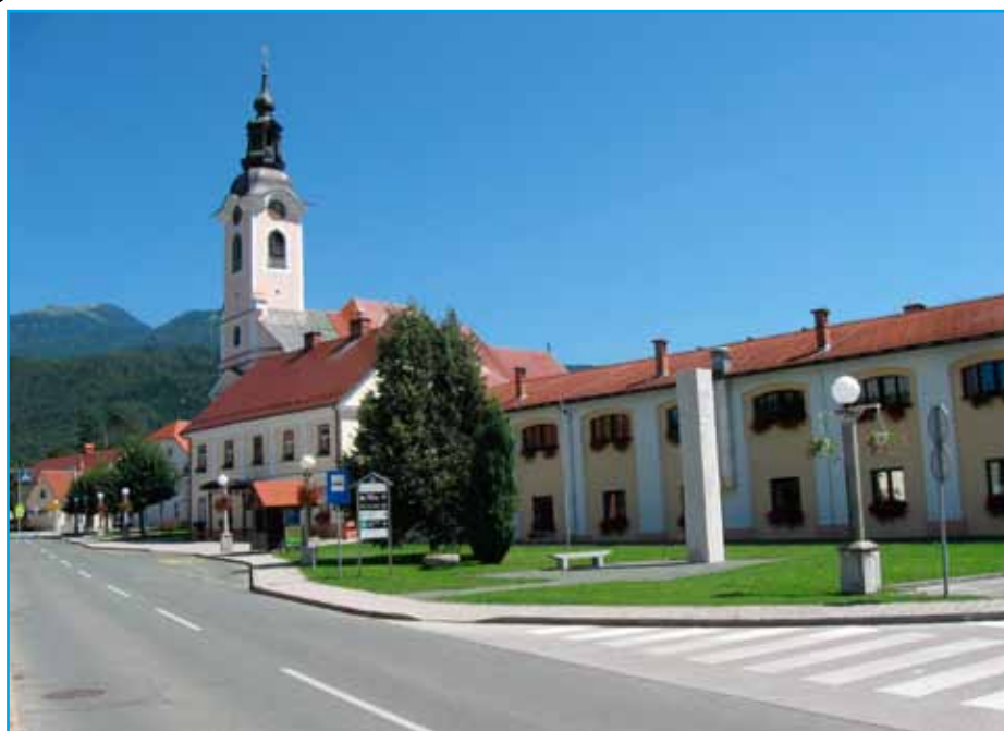
The baroque church of the Assumption in the town center of Cerklje.

In Cerklje, the past and the present go hand in hand. Its rich history and that of the surrounding areas can be traced back to Roman times. Archaeological finds give