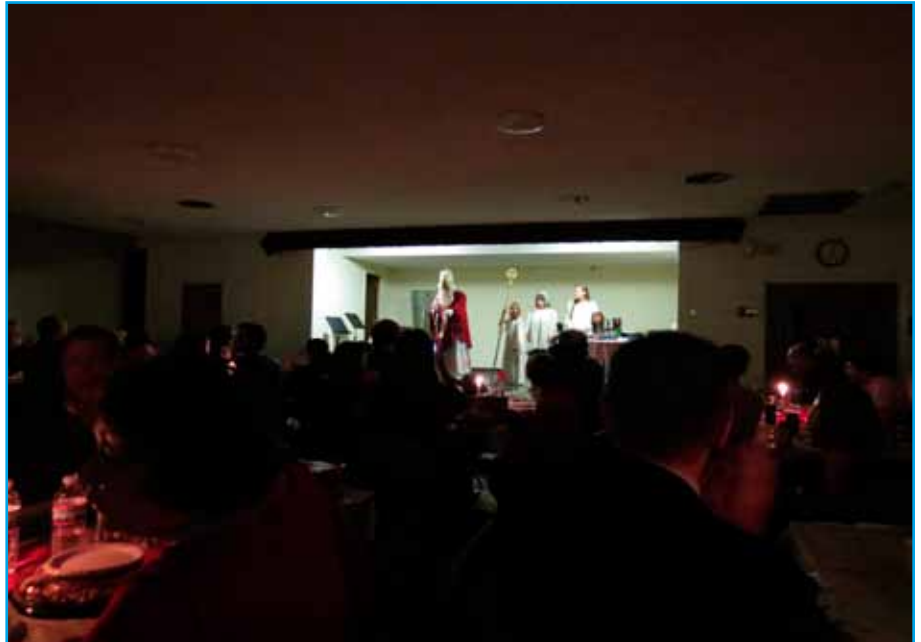
Arrival of Sveti Miklavž - St. Nicholas.