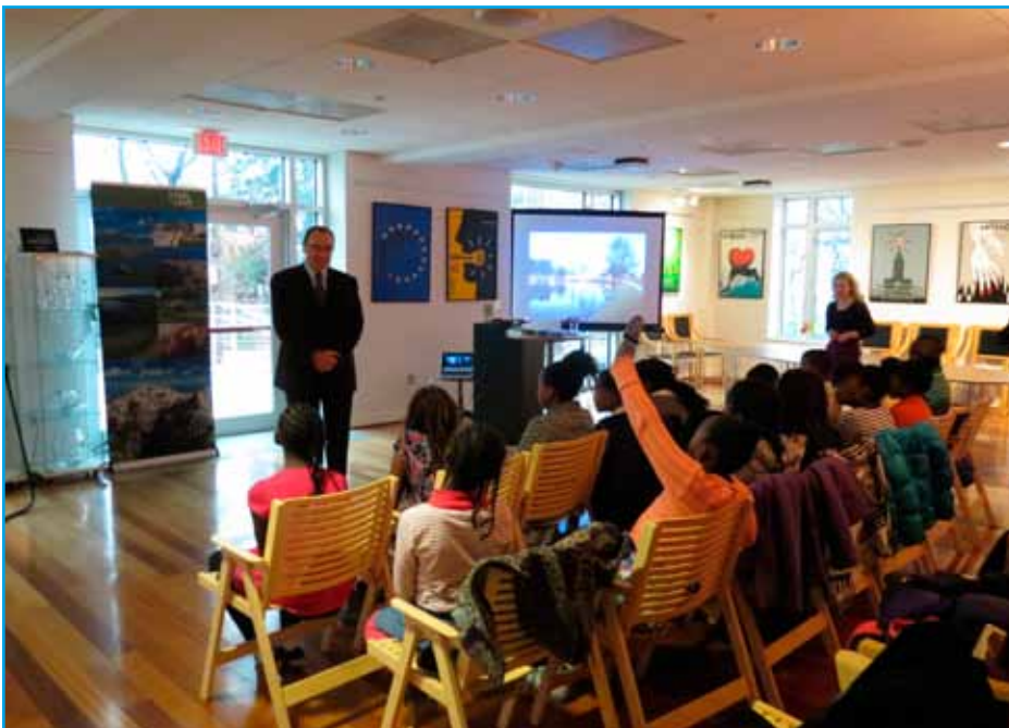
Students were greeted by the ambassador.

As a part of the Embassy Adoption Program, Hearst Elementary School students visited the Slovenian Embassy on Thursday, December 11. Both the Slovenian Embassy and