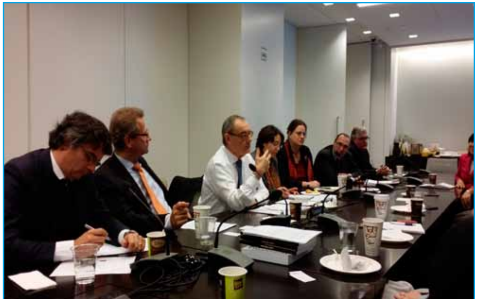
Breakfast meeting of E.U. ambassadors in Washington, D.C. with NGO representatives to celebrate Human Rights Day.