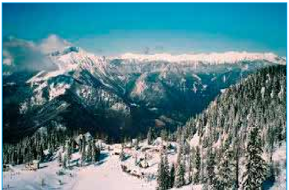
Krvavec in winter.