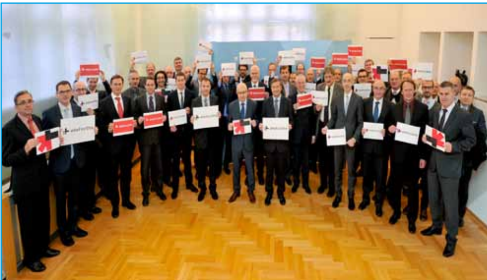
On the occasion of Human Rights Day, Minister Erjavec and his male colleagues at the Ministry of Foreign Affairs (MFA) joined the U.N. Women #HeForShe Campaign.

On the occasion of Human Rights Day, Minister Erjavec and his male colleagues at the Ministry of Foreign Affairs (MFA) joined the U.N. Women #HeForShe Campaign to highlight the significance and role of women in society.