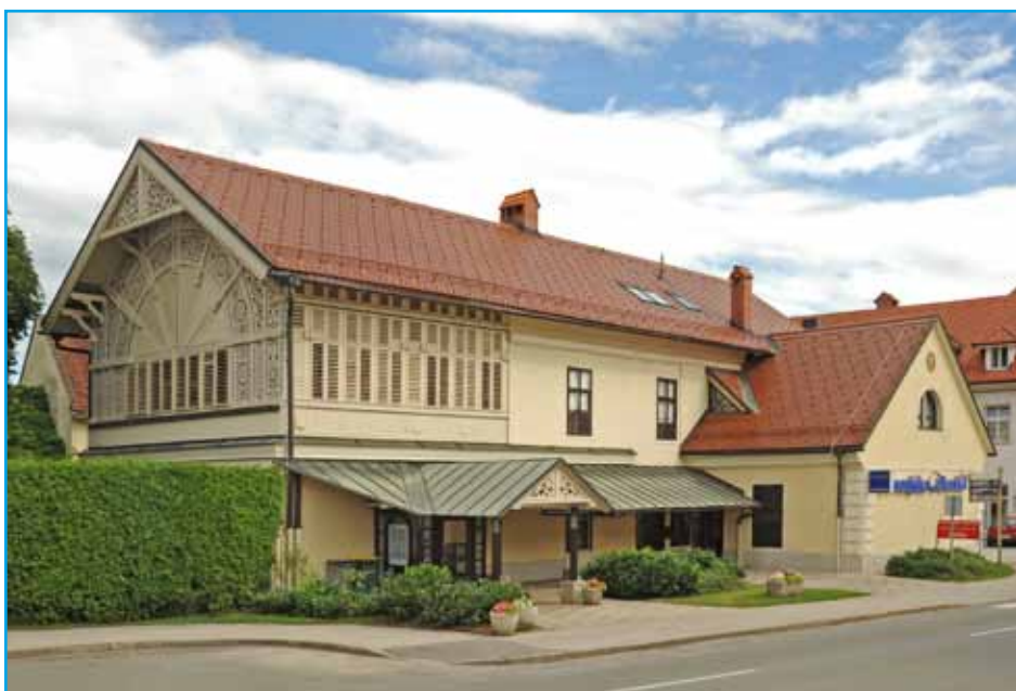
Secession villa of Ljubljana's mayor Hribar.

In written historical documents, the settlement was first mentioned in mid-12th century as Trnovlje (meaning village in thorns). The history of the area can be followed on the path of cultural heritage by visiting the baroque church of the Assumption in the town center, the secession summer residence of Ljubljana's most eminent former mayor Ivan Hribar, a chapel built by the Slovenian prominent architect, Jože Plečnik, the monument of the composer and conductor Davorin Jenko, and the memorial park of other prominent locals who have made a significant contribution to the development of the sciences and the arts not only of the region, but some of them