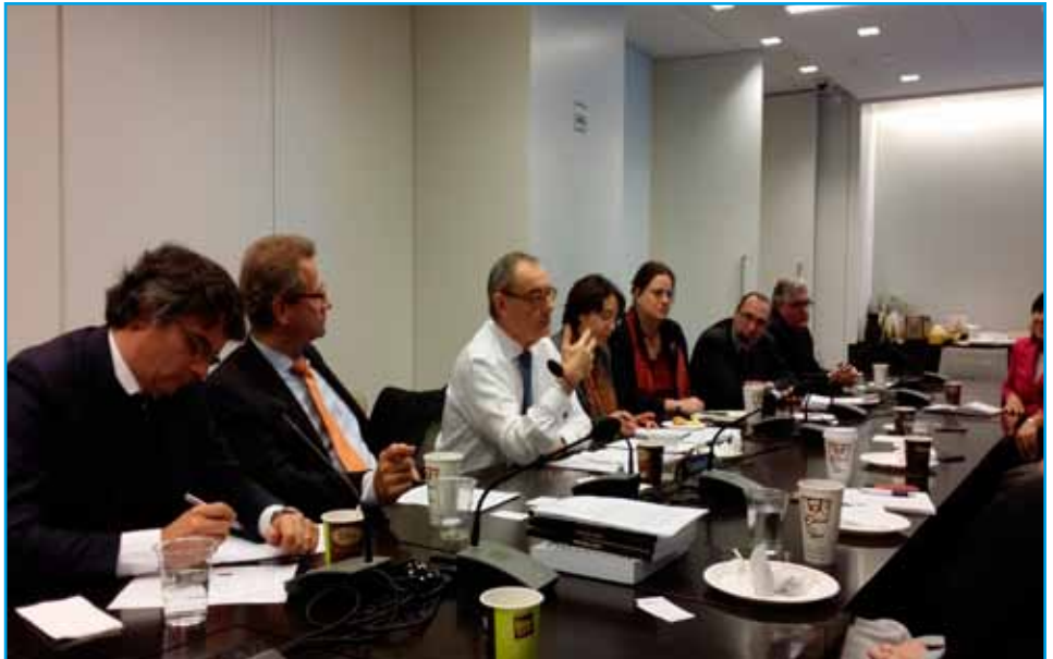
Breakfast meeting of E.U. ambassadors in Washington, D.C. with NGO representatives to celebrate Human Rights Day.