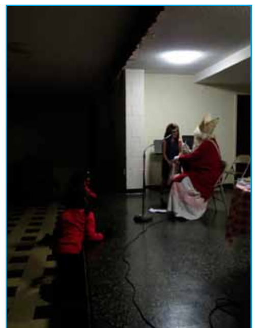
Miklavž distributing presents to children.