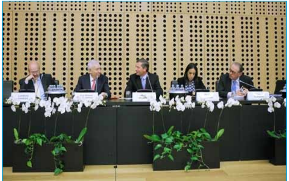
Stephen J. Rapp, Ambassador-at-Large, heading the Office of Global Criminal Justice in the U.S. Department of State was among participants of the seminar.

first addressed by the host of the seminar, Foreign Minister Karl Erjavec, who recalled the need to maintain stability and prosperity in the Mediterranean region and the proactive use of diplomacy and mediation. The guests were encouraged to discuss ways to strengthen mediation as a means of peacefully settling disputes.