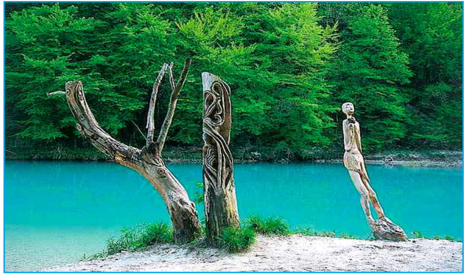
The Sotočje confluence lies at approximately 590 ft above sea level and is the lowest point of the Triglav National Park.

Next to the Tolminka River, the Zadlaščica river, a sanctuary for marble trout, also carved its