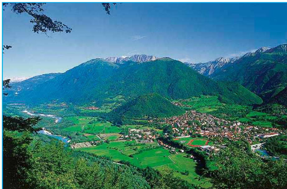
Panoramic view on Tolmin.

was conquered by the Carolingians and in 843, after the Treaty of Verdun, passed to Lotharingia. Later, it belonged to the March of Verona. In 1077, it was passed to the Patriarchate of Aquileia, before becoming part of the Republic of Venice in 1420. Finally, Tolmin was conquered by the Habsburgs in 1509.