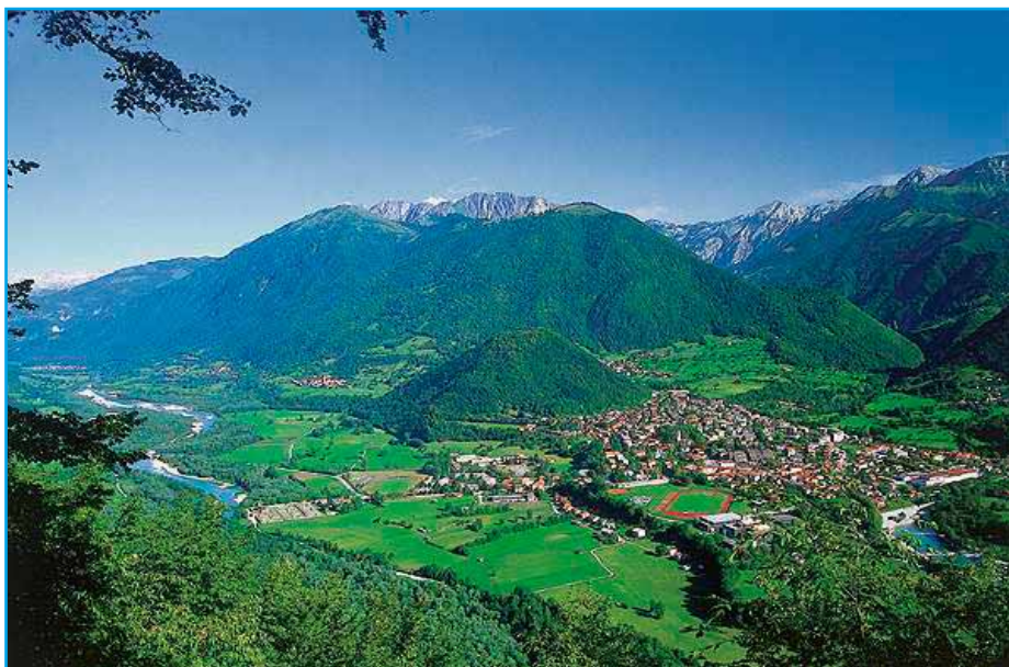
Panoramic view on Tolmin.

was conquered by the Carolingians and in 843, after the Treaty of Verdun, passed to Lotharingia. Later, it belonged to the March of Verona. In 1077, it was passed to the Patriarchate of Aquileia, before becoming part of the Republic of Venice in 1420. Finally, Tolmin was conquered by the Habsburgs in 1509.