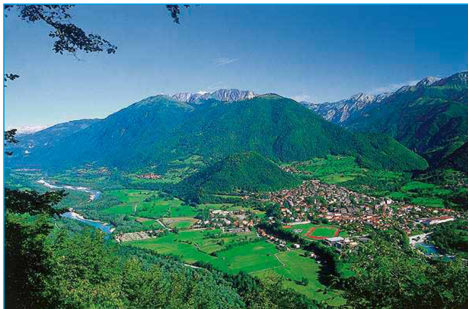
Panoramic view on Tolmin.

was conquered by the Carolingians and in 843, after the Treaty of Verdun, passed to Lotharingia. Later, it belonged to the March of Verona. In 1077, it was passed to the Patriarchate of Aquileia, before becoming part of the Republic of Venice in 1420. Finally, Tolmin was conquered by the Habsburgs in 1509.