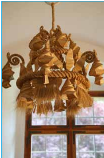
In the past, handicrafts were very important.