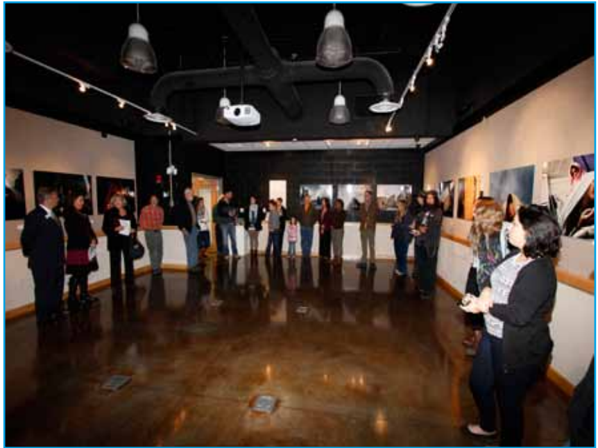
Opening of the exhibition.