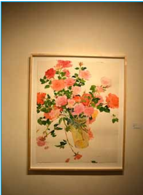
One of Bukovnik’s artworks on display.