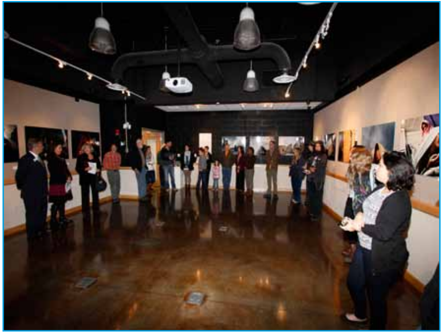
Opening of the exhibition.