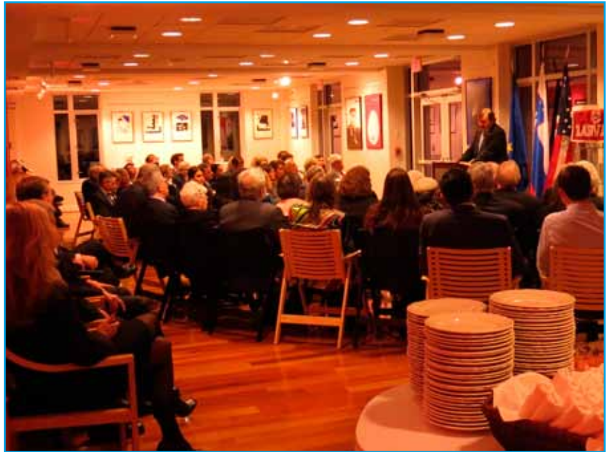
Around 70 Harvard alumni with their spouses attended the event.

the reception that followed the lecture included many of the traditional St. Martin's dishes. The guests could taste duck and goose meat, red cabbage and mlinci pasta next to the traditional Slovenian potica, prosciutto, Carniolian sausage, and trout. Because St. Martin's is mostly celebrated in connection with viticulture, the guests were introduced on the occasion to Slovenian wine from Štajersko and Primorsko regions of Slovenia, including Verus šipon, Marof chardonnay, Capris merlot, and Capris cabernet shiraz.