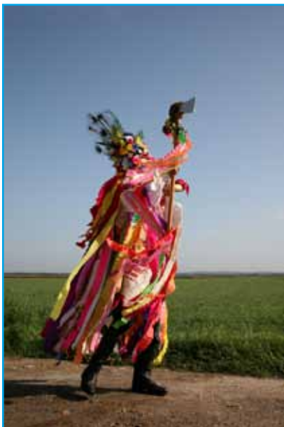
A traditional wedding-time figure the "pozvačin".

The Beltinci municipality preserves the old tradition of crossing the river Mura by ferry in Ižakovci and Melinci. In the past, the ferry was an indispensable