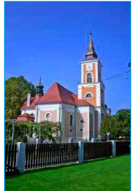
St. Ladislav's church in Beltinci.