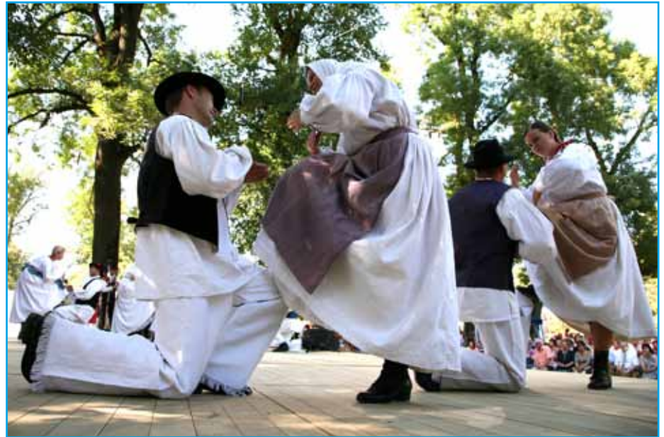
A tradition of folk dances in Beltinci is more than seventy years old.

In the Beltinci municipality, traditional crafts like weaving straw products in Lipovci, brickworks in Melinci, coopery in Gančani, handmaking of wooden troughs in Beltinci, miller's trade, and growing and working of flax in Ižakovci are still preserved today.