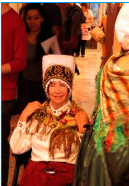
Traditional outfit from Gorenjsko region of Slovenia.