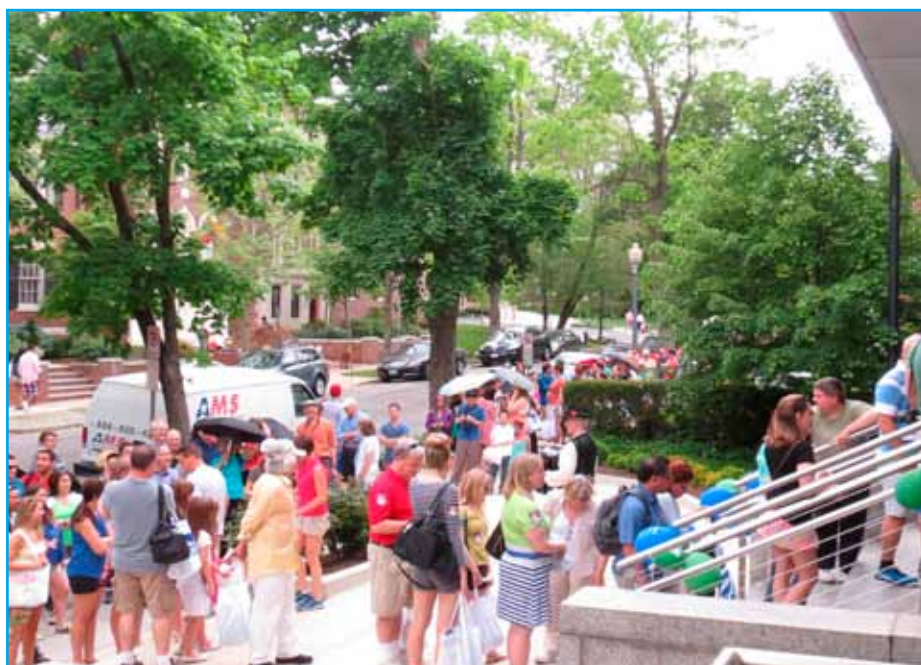
The line in front of the embassy.

The Delegation of the European Union to the United States and the embassies of the 28 E.U. member states opened their doors last Saturday to Washington public during the eighth Annual E.U. Embassies' Open House Day. This annual event is a highlight of the Washington May calendar and is celebrated during the European Month of Culture. This year was special due to the fact that on May 1 Slovenia marked the 10th anniversary of joining the European Union. Beside Slovenia, also welcomed in