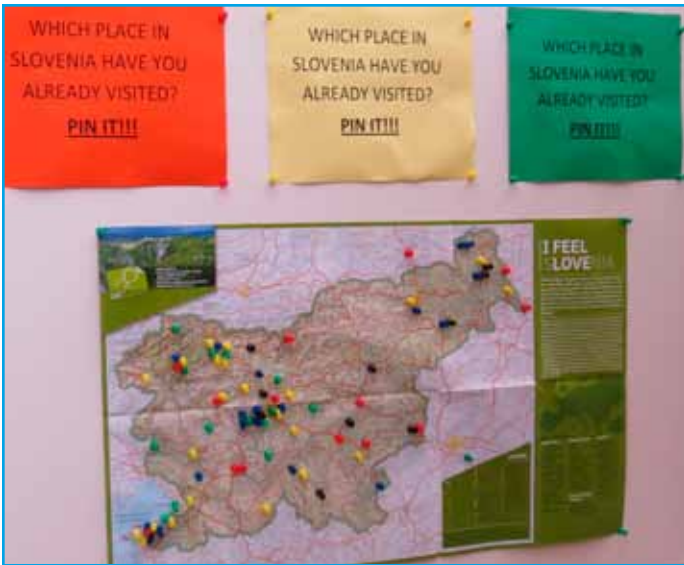
Many visitors pinned the places in Slovenia they had already visited.