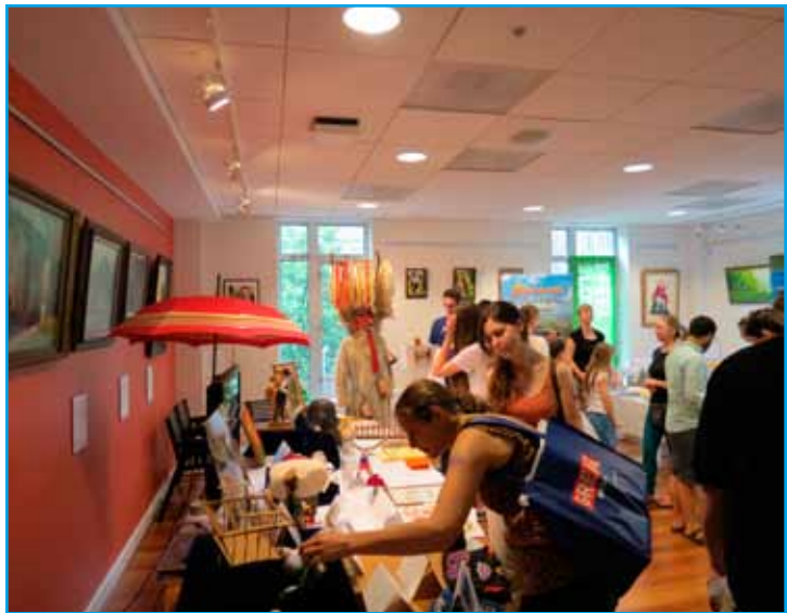
Original household items and artwork were displayed by the SNPJ Heritage Museum from Pittsburgh, PA.