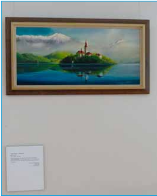
Bled by Albin Zaverl. His exhibition will be on display at the embassy till June 20.