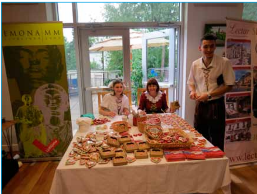
The Lectar Inn from Radovljica demonstrated throughout the day how gingerbread hearts are made.

SAVE THE DATE: In 2015, the E.U. Open House event will take place on Saturday, May 9.