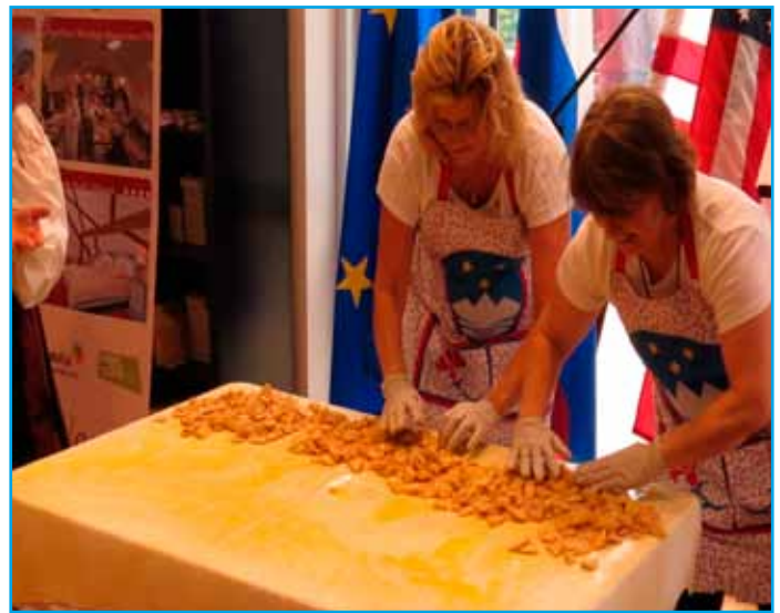
Demonstration of apple strudel making by Bajda sisters.