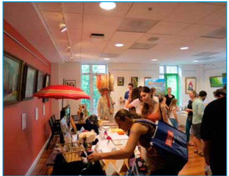
Original household items and artwork were displayed by the SNPJ Heritage Museum from Pittsburgh, PA.