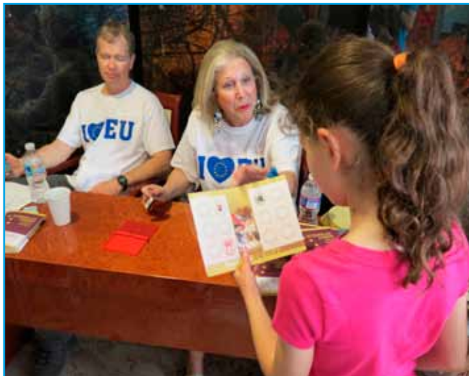
Everybody could get the Slovenian stamp in the E.U. Open House passport.