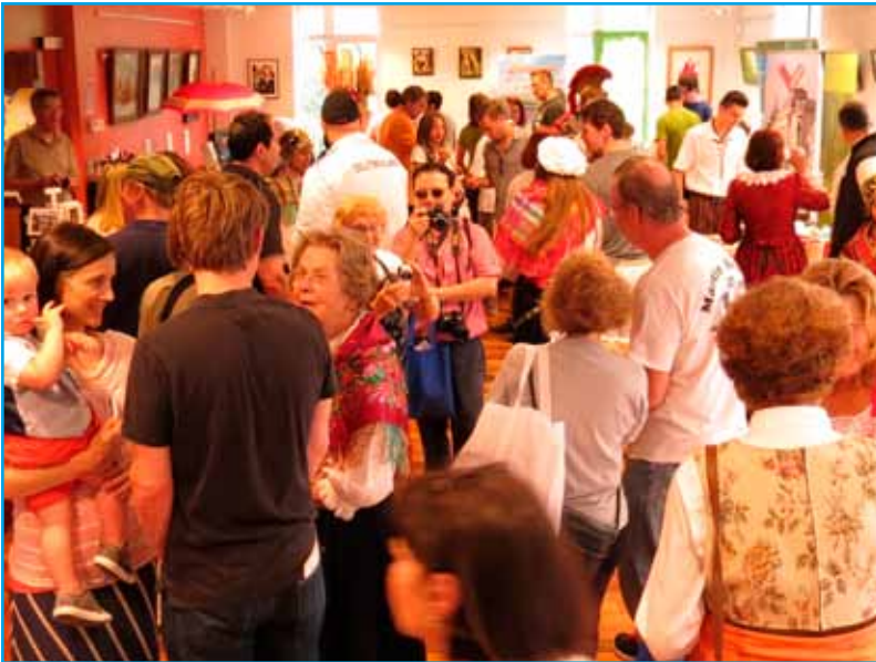
The reception room at the embassy was crowded throughout the day.