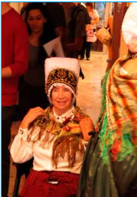
Traditional outfit from Gorenjsko region of Slovenia.