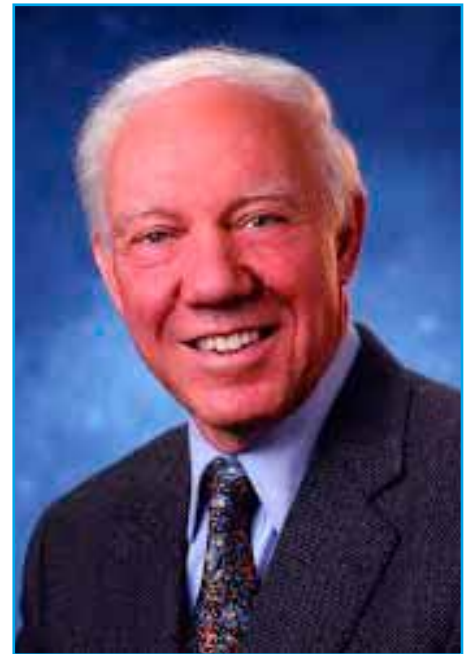
The late congressman. James Oberstar was very proud of his Slovenian heritage.

Special recognition goes to Congressman Oberstar for his active support of the International Trust Fund for Demining. He was actively engaged in fundraising and earmarking assets for the Trust fund and has never lost an