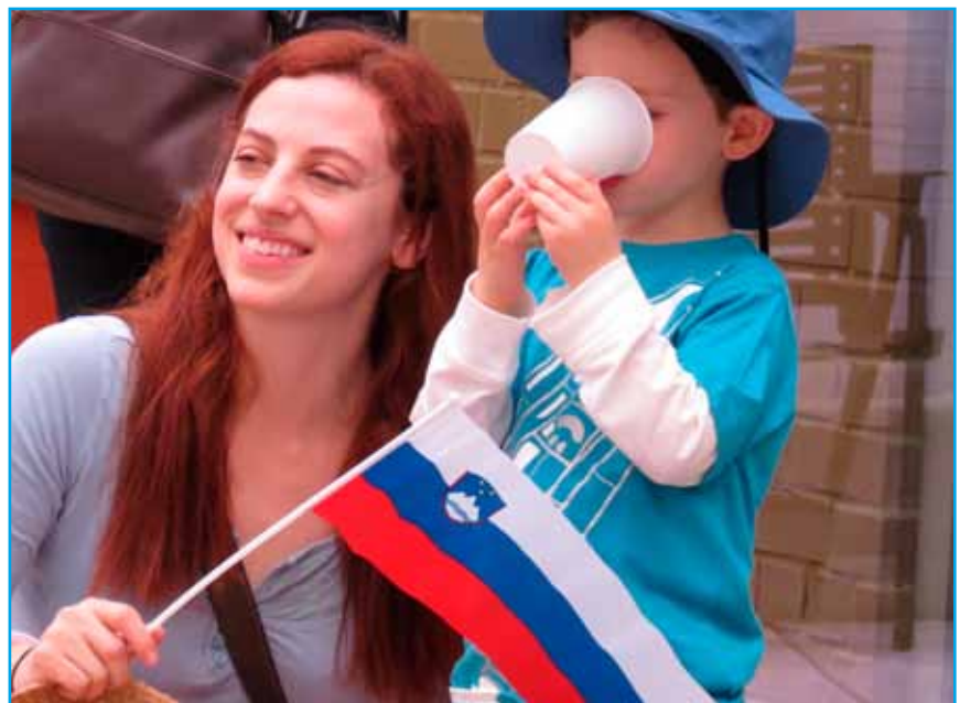
Slovenia's national flag is white, blue and red and bears the coat of arms in the shape of a shield. In the middle of the shield is the outline of Mount Triglav.