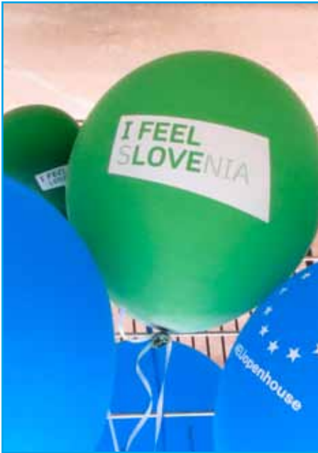
I feel Slovenia in the E.U.