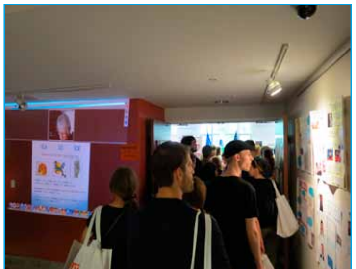
People could read on the posters about the geography and history of Slovenia.