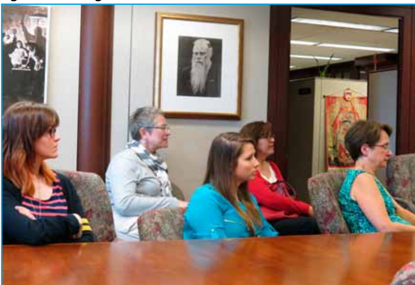
The event took place at the European Division conference room in Thomas Jefferson Building.

" The Stubborn Memory " has been previously presented at the seventh annual international film series Bridges to the World , organized by the World Artists Experiences. The series ran for five weeks from the first week of February through the second week of March at five venues throughout the state of Maryland and in Reading, Pennsylvania. Each film was introduced, screened, and followed by a discussion.