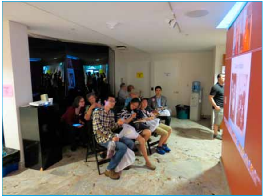
"Slovene Conversation Online – Pogovorna slovenščina preko spleta" is a project developed by volunteers of the Slovenian Union of America.