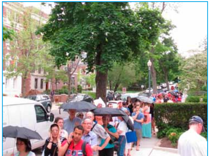
More than 4000 people visited Slovenian embassy on May 10 between 10 a.m. and 4 p.m.