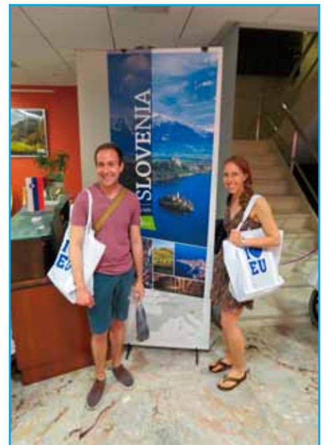
In the embassy's lobby.