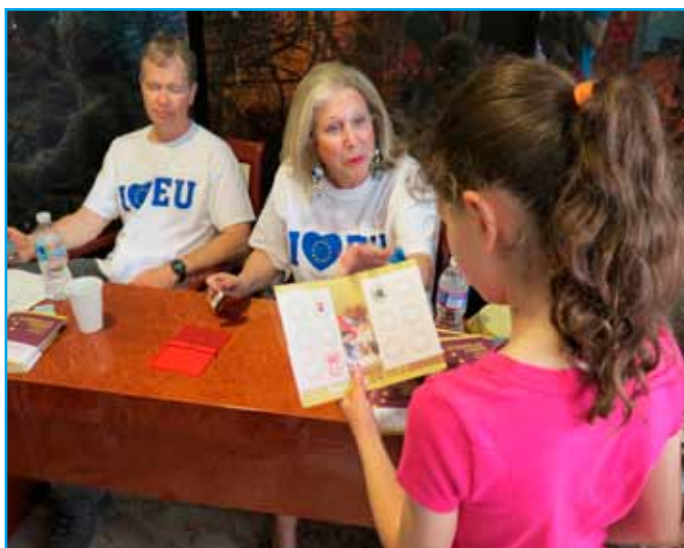
Everybody could get the Slovenian stamp in the E.U. Open House passport.