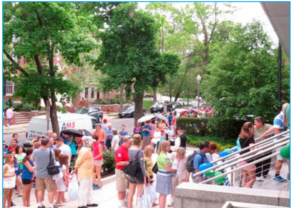
The line in front of the embassy.

The Delegation of the European Union to the United States and the embassies of the 28 E.U. member states opened their doors last Saturday to Washington public during the eighth Annual E.U. Embassies' Open House Day. This annual event is a highlight of the Washington May calendar and is celebrated during the European Month of Culture. This year was special due to the fact that on May 1 Slovenia marked the 10th anniversary of joining the European Union. Beside Slovenia, also welcomed in