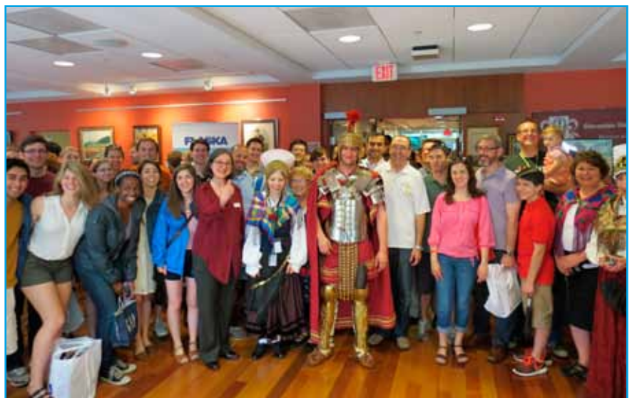
A group photo with the Ambassador.