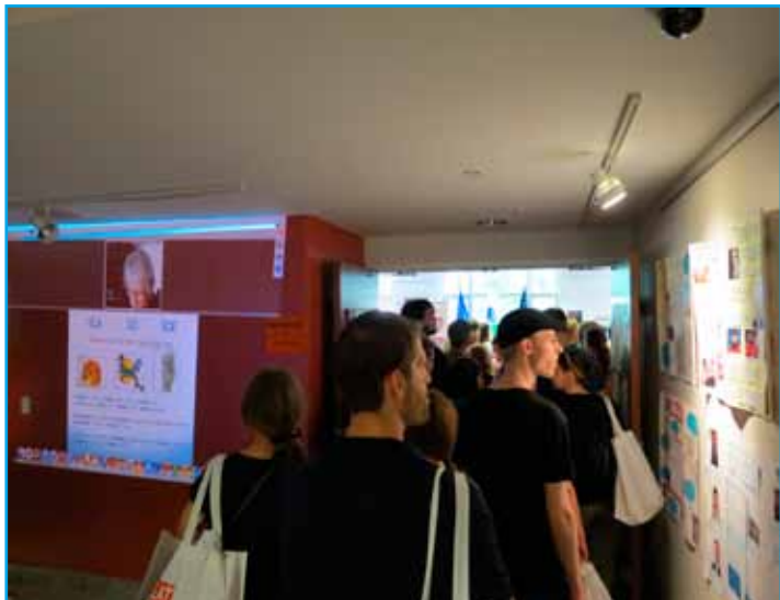
People could read on the posters about the geography and history of Slovenia.