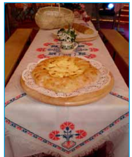
"Posmodule" are cakes typical of Preddvor. They are spread with minced lard or sprinkled with cracklings, or spread with cottage cheese and sprinkled with chopped chive.

Next to its rich history and monuments of cultural significance, Preddvor gives visitors many possibilities for cycling trips, one-day walking trips and hikes in the unspoilt natural surroundings. The Storžič mountain (2132 m; 6977 ft.), which got its name from its conical shape, plays a dominant role among the peaks that interest hikers, but, walking trails to St. Jacob and Kališče are also fascinating. Geological path to Možjanca (691 m; 2260 ft.) cuts through a steep slope that offers multicolored rocks in the exposed area, which are full of interesting animal fossils. There are numerous walking paths also along the Kokra River. More information about Preddvor is available at: http://www.preddvor-tourism.si/