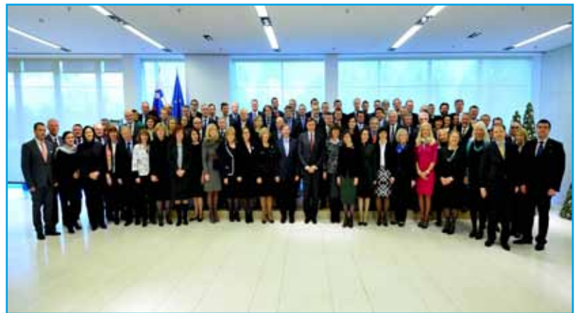
Slovenian ambassadors and senior Foreign Ministry officials together with President Borut Pahor.

Heads of Slovenian embassies, consulates and representative offices abroad and senior Foreign Ministry officials met at Brdo estate on January 6–8, 2014, for a three-day annual consultation. The event focused on Slovenia's new foreign policy strategy, topical international and bilateral issues and economic diplomacy.