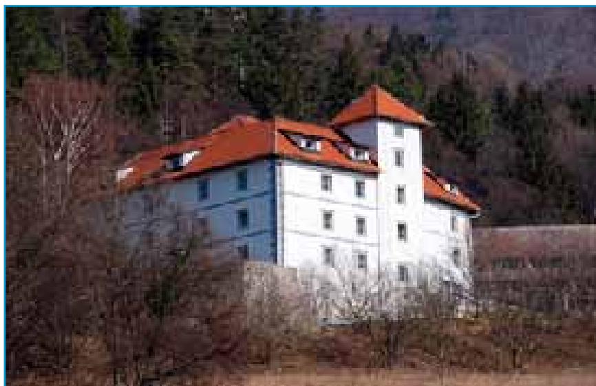
The Turn Castle.

The 16th-century Hrib Castle stands on the shore of the artificial Črnava lake, in the middle