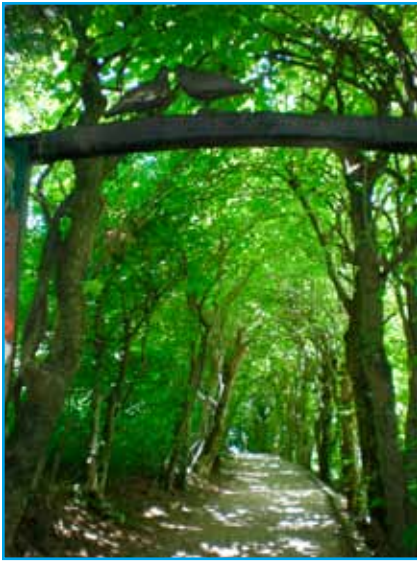
The avenue of ash trees..

of a park with exotic trees and an avenue. The castle changed many owners and went through many renovations. Currently, it is part of hotel Bor, which contains an inn with a wedding hall. The avenue of ash trees at the Hrib Castle is well-known for the intertwining of its branches at the top. The legend says that in ancient times the Hrib Castle's gardener fell in forbidden love with a castle's young lady. They had secret meetings in the avenue. Only trees understood their love, therefore, they interlaced their branches to help hiding them. When a mother-countess realized how deep their love was, she permitted their wedding. Their marriage lasted in joy and happiness for 50 years. Hence, today the Hrib Castle guarantees to newlyweds who walk through this avenue on a wedding day, 50 years of happiness together!