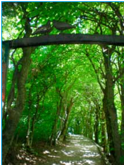
The avenue of ash trees..

of a park with exotic trees and an avenue. The castle changed many owners and went through many renovations. Currently, it is part of hotel Bor, which contains an inn with a wedding hall. The avenue of ash trees at the Hrib Castle is well-known for the intertwining of its branches at the top. The legend says that in ancient times the Hrib Castle's gardener fell in forbidden love with a castle's young lady. They had secret meetings in the avenue. Only trees understood their love, therefore, they interlaced their branches to help hiding them. When a mother-countess realized how deep their love was, she permitted their wedding. Their marriage lasted in joy and happiness for 50 years. Hence, today the Hrib Castle guarantees to newlyweds who walk through this avenue on a wedding day, 50 years of happiness together!