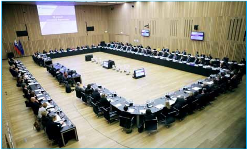
The meeting took place at the Brdo estate.

neighbors. She also cited the Western Balkans as a priority in terms of bilateral relations as well as in the context of the E.U. and NATO enlargements. At the heart of the discussion at the meeting were also the current challenges that face Slovenia's foreign policy and its diplomats, "green" policy and international development cooperation.