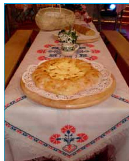
"Posmodule" are cakes typical of Preddvor. They are spread with minced lard or sprinkled with cracklings, or spread with cottage cheese and sprinkled with chopped chive.

Next to its rich history and monuments of cultural significance, Preddvor gives visitors many possibilities for cycling trips, one-day walking trips and hikes in the unspoilt natural surroundings. The Storžič mountain (2132 m; 6977 ft.), which got its name from its conical shape, plays a dominant role among the peaks that interest hikers, but, walking trails to St. Jacob and Kališče are also fascinating. Geological path to Možjanca (691 m; 2260 ft.) cuts through a steep slope that offers multicolored rocks in the exposed area, which are full of interesting animal fossils. There are numerous walking paths also along the Kokra River. More information about Preddvor is available at: http://www.preddvor-tourism.si/