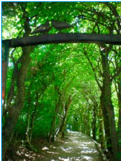
The avenue of ash trees..

of a park with exotic trees and an avenue. The castle changed many owners and went through many renovations. Currently, it is part of hotel Bor, which contains an inn with a wedding hall. The avenue of ash trees at the Hrib Castle is well-known for the intertwining of its branches at the top. The legend says that in ancient times the Hrib Castle's gardener fell in forbidden love with a castle's young lady. They had secret meetings in the avenue. Only trees understood their love, therefore, they interlaced their branches to help hiding them. When a mother-countess realized how deep their love was, she permitted their wedding. Their marriage lasted in joy and happiness for 50 years. Hence, today the Hrib Castle guarantees to newlyweds who walk through this avenue on a wedding day, 50 years of happiness together!