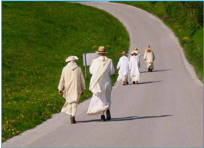
The Pleterje monastery was founded by Herman II, Count of Celje, already in 1407.

Not far from Pleterje, a visitor can explore the karst cave of Kostanjevica, the largest karst cave in Slovenia. Here, rain water and underground water spent millennia creating magnificent, dreamlike stalactites and stalagmites formed in an interesting way, and some of the formations