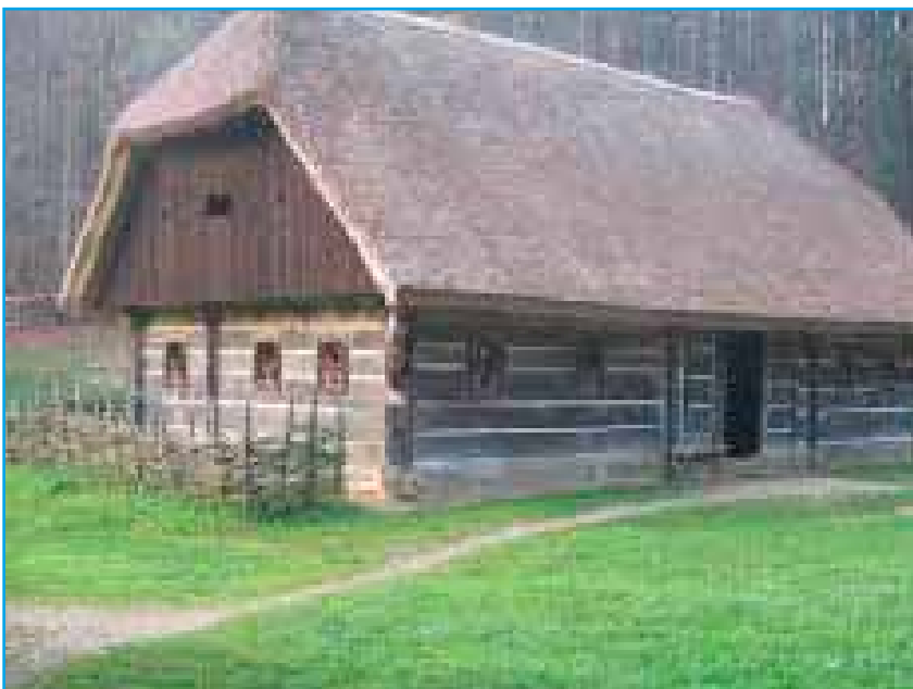
An open-air museum lies at the approaches to the monastery complex, showcasing the village life at the end of the 19th century.

More information and source: http://www.skansen.si/skansen/Welcome.html http://pleter.si/ http://www.kartuzija-pleterje.si/ang/index_ang.html http://www.kostanjeviska-jama.com/