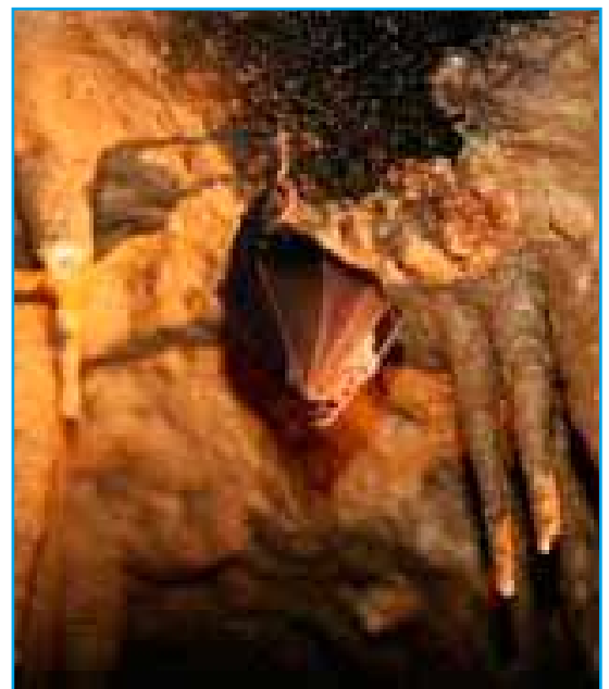
Kostanjevica cave is also the natural habitat of the horseshoe bat.