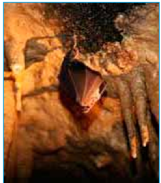
Kostanjevica cave is also the natural habitat of the horseshoe bat.