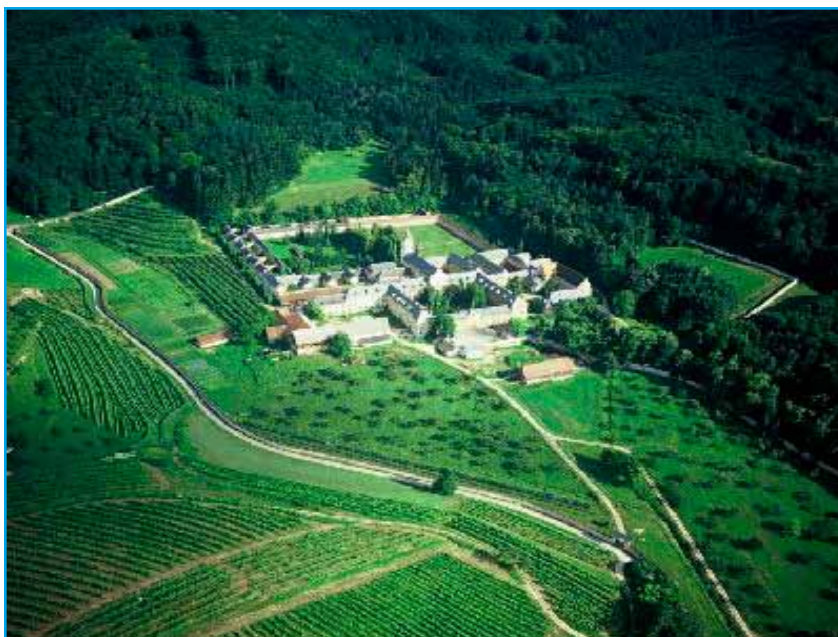
The Pleterje monastery from air.

The monastery complex consists of two distinct parts. The first is the Old Carthusian Monastery, which consists of the Old Gothic Church, the storied sacristy, as well as the remains of the cloisters with part of the chapter house and refectory. The second is the New Carthusian Monastery with its component buildings that are