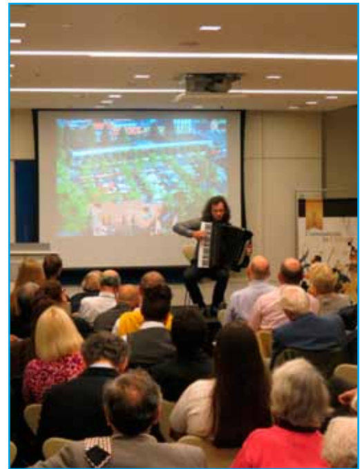
The event was attended by some 100 guests.