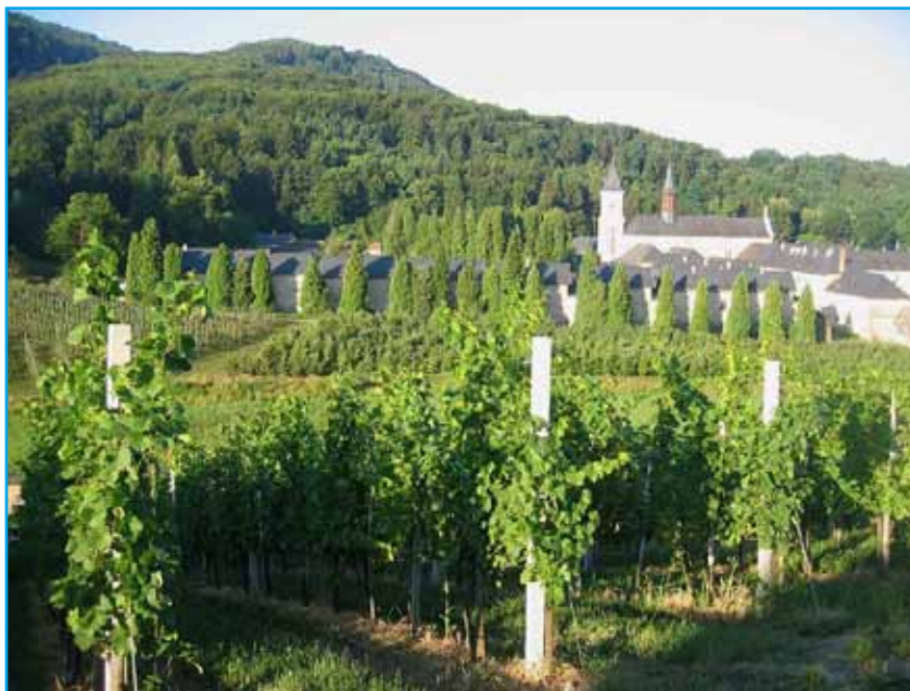
The wine-bearing slopes of the Pleterje hill.

An open-air museum lies at the approaches to the monastery complex. Beautifully set in a secluded valley, Pleterje Skansen is situated in the village of Vratno, with the parking place for the monastery. The open-air museum is spread out across a