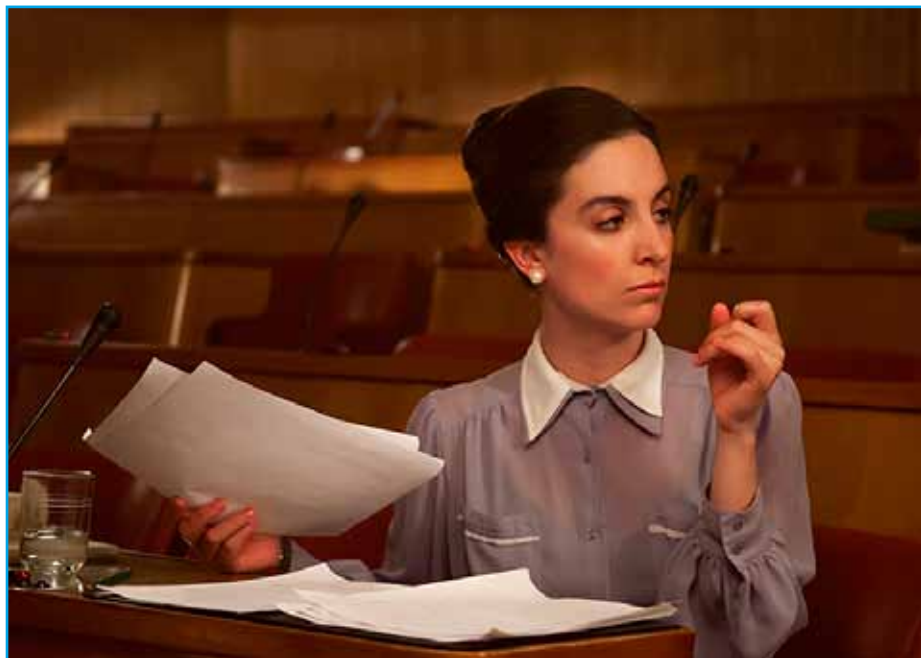
Scene from J.Cibic: Fruits of Our Land , Single channel HD video, 11 min 43 sec, 16:9, stereo, 2013

The opening was very well attended and the project was very well received. In attendance was a mixture of New York and European curators and artists as well as art world insiders. The opening