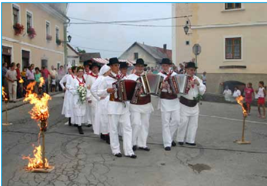
Folklore Group Semiška ohceta

krajina, as many folk traditions have managed to survive the passage of time. Some traditions are preserved by the Folklore Group Semiška ohceta in its performances, and in summer festivals. The most famous of them is »Semiška ohceta«, in which the memory of old wedding customs and traditions is kept alive by the performance of an actual wedding ceremony. Semič is nowadays known for its good wine, rich cultural tradition, successful entrepreneurs and craftsmen and -- last but not least -- its modern Cultural Center Semič.