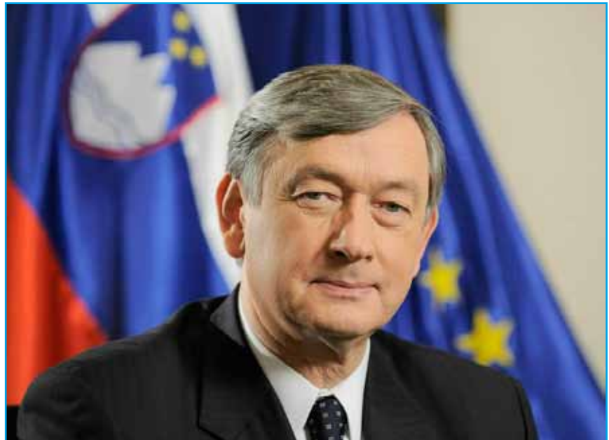
Dr. Danilo Türk.

At the gala dinner on Friday, April 11, the participants were addressed by the Slovenian international law expert and former president of the Republic of Slovenia, Dr. Danilo Türk. The event was attended by many judges and former judges of the International Court of Justice, other international courts and tribunals, representatives of academia, lawyers working in foreign ministries and international organizations, and