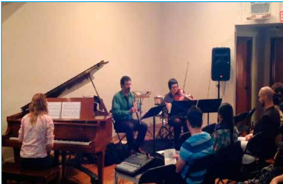
Concert in New York.