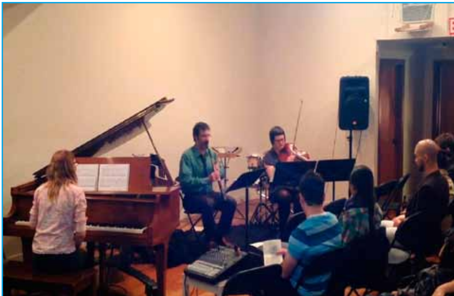
Concert in New York.