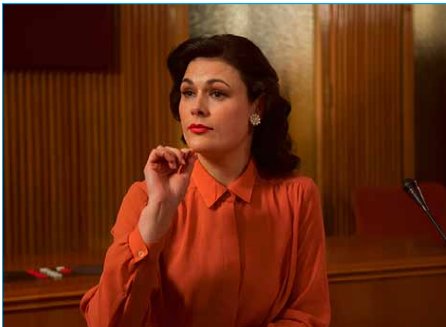
Scene from J.Cibic: Fruits of Our Land , Single channel HD video, 11 min 43 sec, 16:9, stereo, 2013

The exhibition remains on display till May 11, 2014, at LMAKprojects, 139 Eldridge Street, New York, NY 10002.