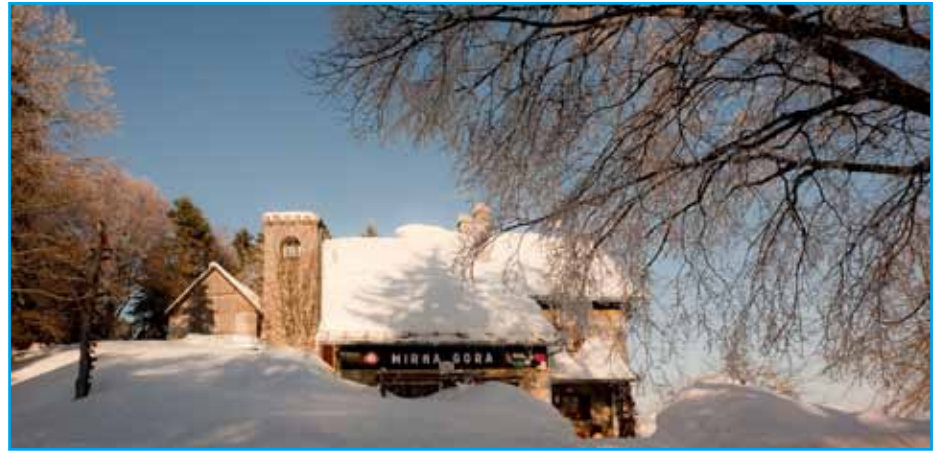
Mirna gora.

of Mirna gora is a favorite goal of many hikers in Bela krajina. The forests surrounding the mountain are a part of the vast Rog forests, which form one of the largest forested areas in Europe when counted together with those of the neighboring dinaric plateaus. The area surrounding Mirna gora offers countless well maintained and richly equipped educational, hiking, and horseback riding and cycling trails; in Gače above Črmošnjice there is also a ski-center.