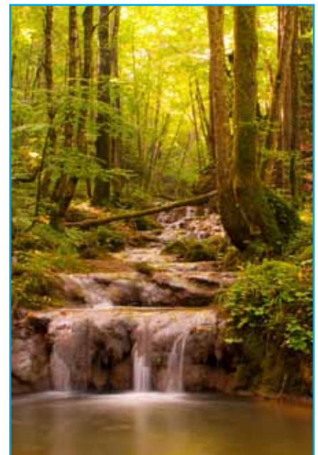
Divji potok stream. (By Z- Butala)