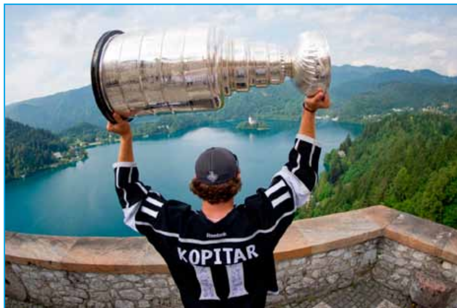
Anže Kopitar in Bled two years ago.

Traditionally, every member of the team who has won the Stanley Cup gets to hold the cup for 24-hours to take it to his home state or country. The Stanley Cup had already been to Slovenia once, in June 2012, and it was not long afterwards to find its way back. Thanks to Anže Kopitar, the Stanley Cup visited Slovenia again on July