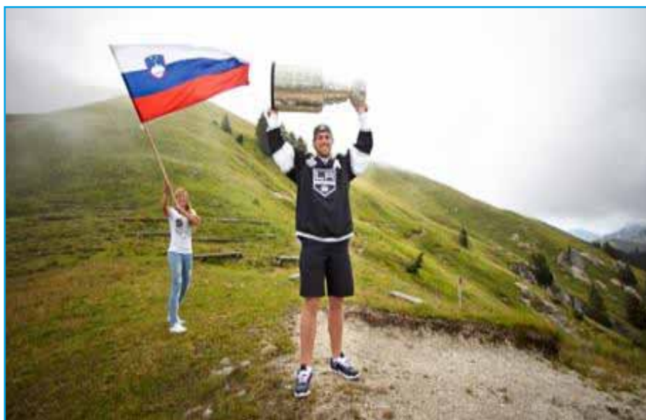
Anže Kopitar in Golica.

Once again, Slovenian hockey fans have shown that hockey is becoming more and more popular in Slovenia and that, arguably, it may become the nation's most popular sport. Due to the fact that Kopi is one of the most successful and best-recognized Slovenian athletes, more and more youngsters are deciding to play the game and Anže is their best inspiration and role model.