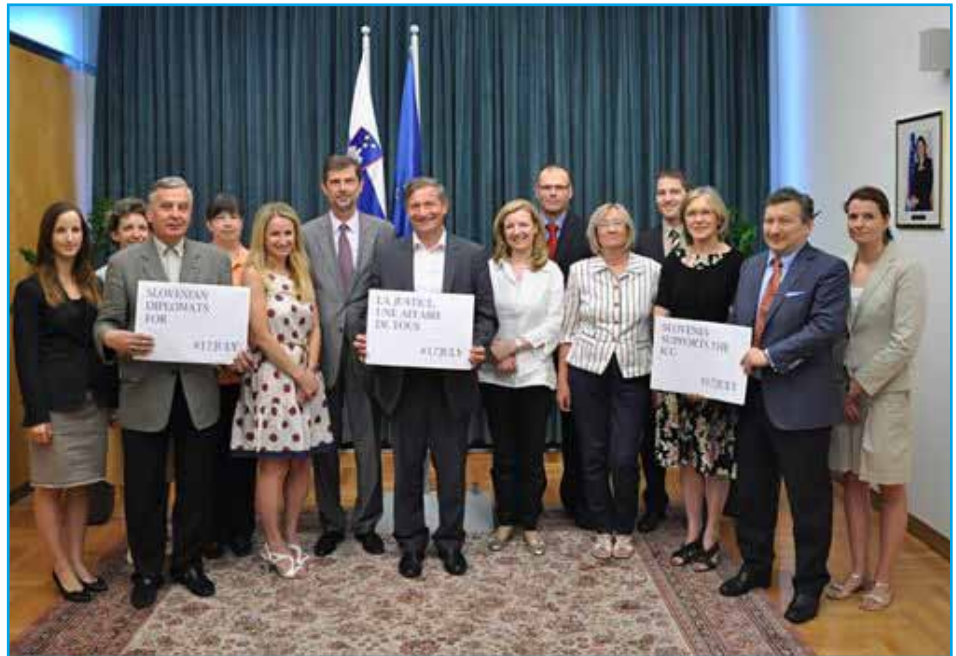
Foreign Minister Erjavec joined the campaign and on #17July, called on all countries to join the @IntlCrimCourt's efforts.

Today, the ICC has 122 States Parties from all parts of the globe and ensures protection to more than 2.3 billion people. It is currently investigating eight cases, namely, in the Sudan (the Darfur case), the Democratic Republic of the Congo, Uganda, the Central African Republic, Kenya, Libya, the Ivory Coast, and Mali. Furthermore, preliminary examinations are being conducted in eleven cases: in Afghanistan, Georgia, Guinea, Honduras, Iraq, Colombia, the Comoros, Nigeria, the Republic of Korea, the Central African Republic, and Ukraine. The Court has also been assisting more than 100,000 victims of crimes.