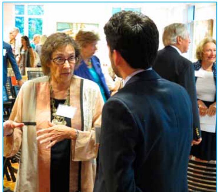
The event was part of Beyond the Headlines series.