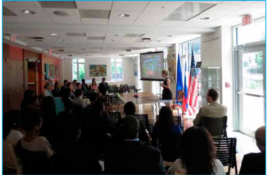
GYLC participants came to WASHINGTON, D.C. from 15 different countries.