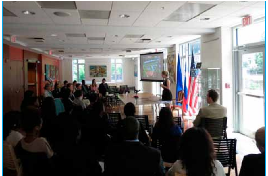
GYLC participants came to WASHINGTON, D.C. from 15 different countries.