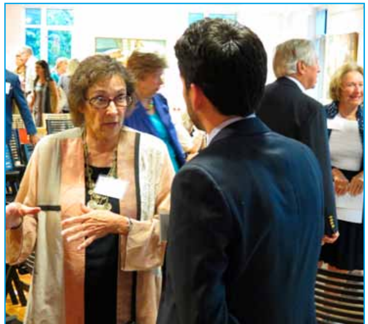
The event was part of Beyond the Headlines series.