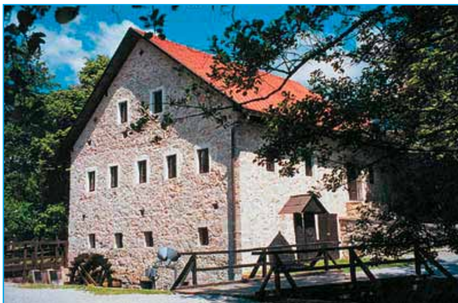
Memorial house of Primož Trubar in Rašica.

A circular cultural hiking trail links the birthplaces of three great Slovenes: Levstik, Stritar and Trubar. It begins in Velike Lašče, is about 10 miles long and takes about three to four hours to walk.