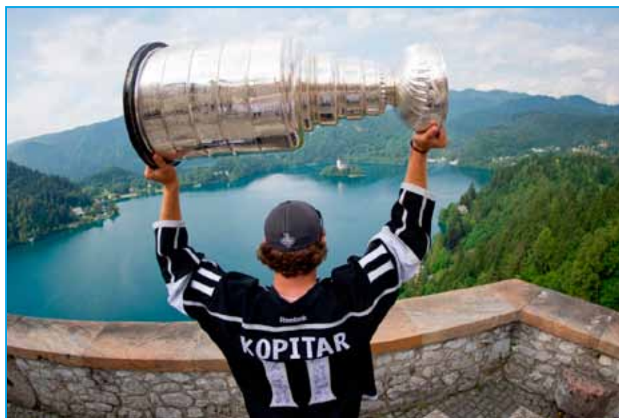
Anže Kopitar in Bled two years ago.

Traditionally, every member of the team who has won the Stanley Cup gets to hold the cup for 24-hours to take it to his home state or country. The Stanley Cup had already been to Slovenia once, in June 2012, and it was not long afterwards to find its way back. Thanks to Anže Kopitar, the Stanley Cup visited Slovenia again on July