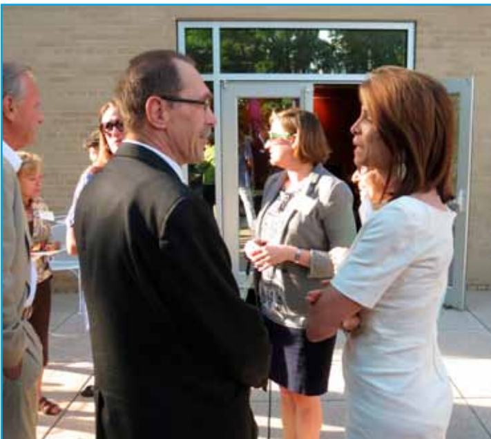
Around 50 guests attended the discussion on Iraq.

Times. At the end of the lecture, several other issues were raised by the audience, such as the role of the U.S. in the region, and also comments and opinions on the importance of the stability in the Middle East.