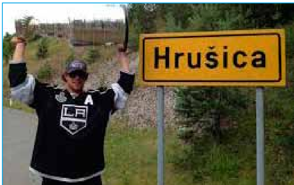
Anže Kopitar brought Stanley Cup to his hometown Hrušica already in 2012.