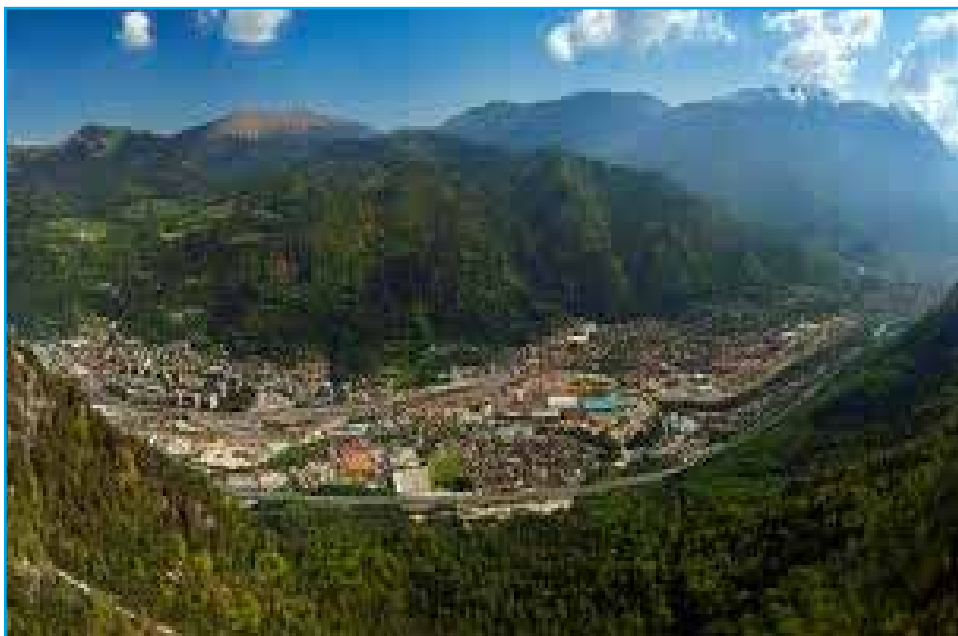
Panoramic view on Jesenice

is closely connected with its ironworks and metallurgy. The oldest source on the early history of Jesenice is a list of mining rights, issued to the Carinthian counts of Ortenburg, dating to 1381, but the first settlements in the area were founded on the southern slopes higher