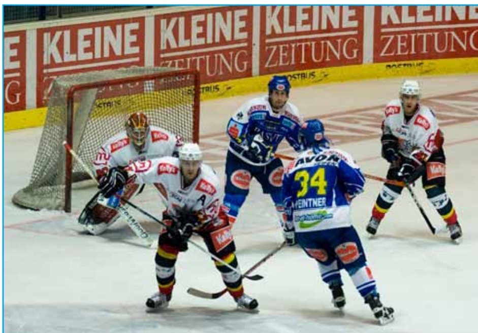
The town of Jesenice is the cradle of Slovenian ice hockey.

Different iron foundries belonged to different owners (the Zois, Ruard, and Bucellini families) and did not interact. This situation continued until the 19th century, when the Luckmann family from Ljubljana agreed to modernize the iron foundries through the new shareholder company, the