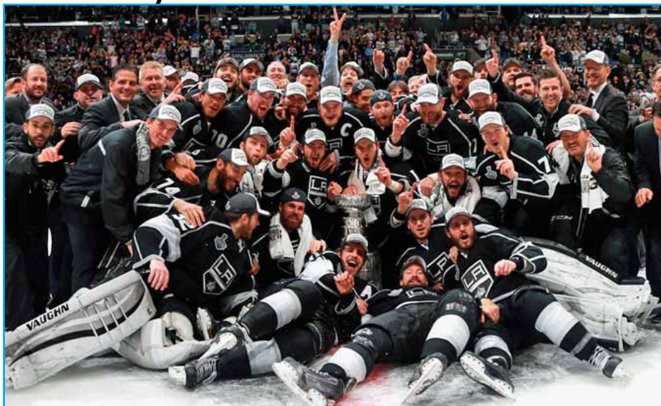
LA Kings with the cup after defeating the New York Rangers on June 14.

Kopitar, also known as "Kopi", played a crucial role already during the race to the 2012 Stanley Cup Championship and at that time the 24-year-old Slovenian superstar gained much attention. This year, his outstanding performances led him to become the first Slovenian hockey player to win the Stanley Cup as a scoring leader, with a starring performance in points (26) and goals (5). Already before the beginning of the Stanley Cup play-off final, the former Canadian