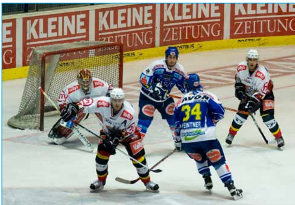
The town of Jesenice is the cradle of Slovenian ice hockey.

Different iron foundries belonged to different owners (the Zois, Ruard, and Bucellini families) and did not interact. This situation continued until the 19th century, when the Luckmann family from Ljubljana agreed to modernize the iron foundries through the new shareholder company, the