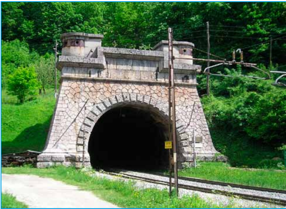
Hrušica is best known for the 7,976 m (cca. 5 miles) long two-track Karavanke railway tunnel connecting Slovenia with Austria, which was finished in 1906.

Anže Kopitar originally comes from the village of Hrušica, a settlement 2 miles west of Jesenice along the main road to Kranjska Gora. The settlement has less than 2000 inhabitants and is, next to its famous athlete, best known for the 7,976 m (cca. 5 miles) long two-track Karavanke railway tunnel connecting Slovenia with Austria, which was finished in 1906, and the 7,864 m (cca. 4.8 miles long road tunnel, completed in 1991.