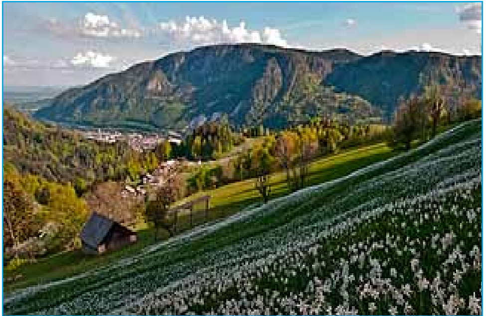
Above the town of Jesenice, one can find Golica (6,024 ft), a peak especially known for its fields of wild white narcissi, swathes of which cover Golica and surrounding pastures in late April and early May.

Kranjska Industrijska Družba - Carniolan Industrial Company (KID). Thus, in 1869, all the Upper Carniolan ironworks were joined -- for the first time -- by the Luckmann family under a single administration, with central management in Ljubljana and business administration in Jesenice. The greatest achievement of KID was the discovery of a process for obtaining ferromanganese in a smelting furnace. This innovation brought KID a gold medal at the World Exhibition in Vienna in 1873 and worldwide fame.