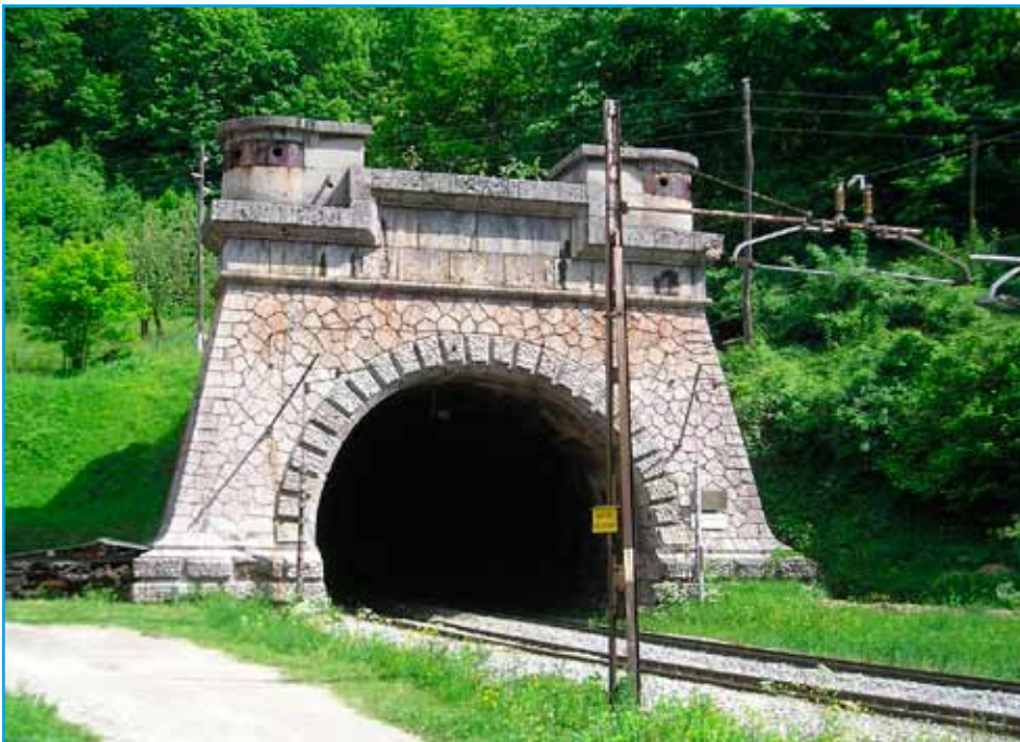
Hrušica is best known for the 7,976 m (cca. 5 miles) long two-track Karavanke railway tunnel connecting Slovenia with Austria, which was finished in 1906.

Anže Kopitar originally comes from the village of Hrušica, a settlement 2 miles west of Jesenice along the main road to Kranjska Gora. The settlement has less than 2000 inhabitants and is, next to its famous athlete, best known for the 7,976 m (cca. 5 miles) long two-track Karavanke railway tunnel connecting Slovenia with Austria, which was finished in 1906, and the 7,864 m (cca. 4.8 miles long road tunnel, completed in 1991.