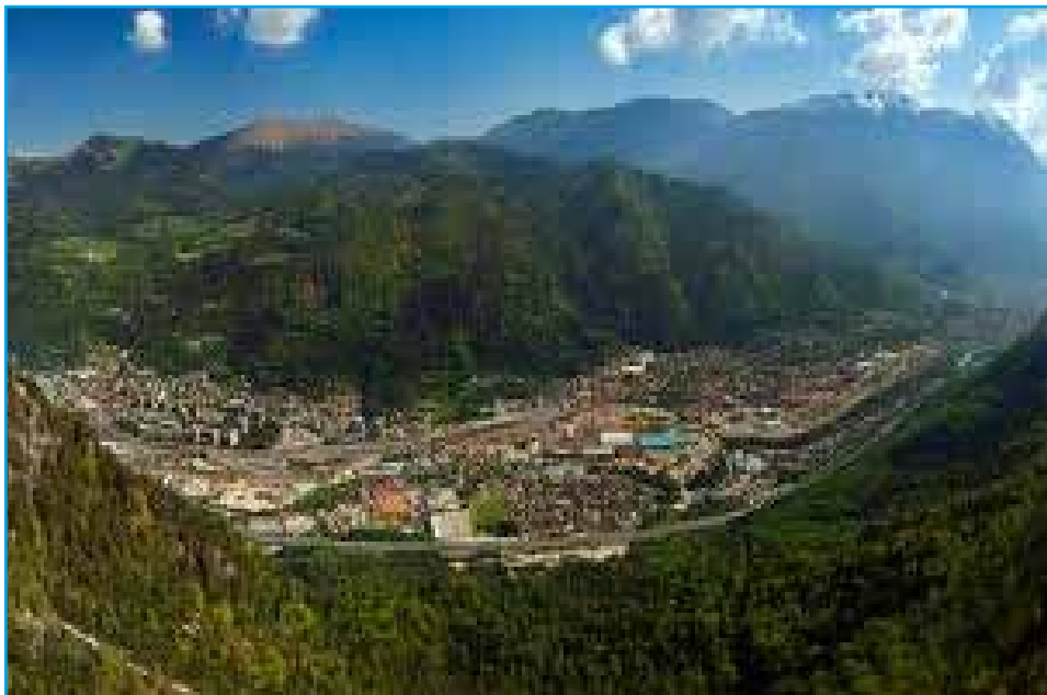
Panoramic view on Jesenice

is closely connected with its ironworks and metallurgy. The oldest source on the early history of Jesenice is a list of mining rights, issued to the Carinthian counts of Ortenburg, dating to 1381, but the first settlements in the area were founded on the southern slopes higher