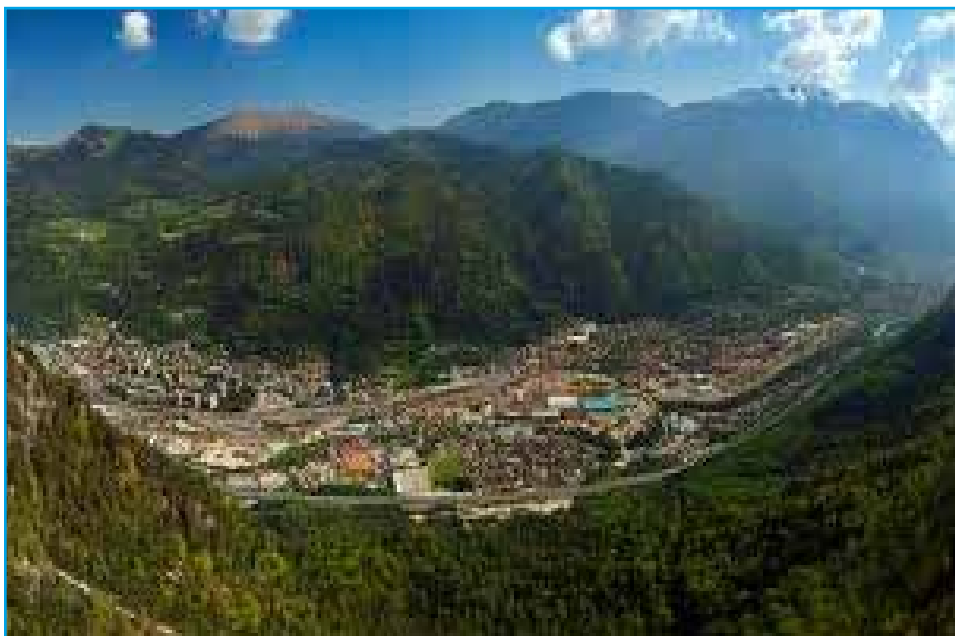
Panoramic view on Jesenice

is closely connected with its ironworks and metallurgy. The oldest source on the early history of Jesenice is a list of mining rights, issued to the Carinthian counts of Ortenburg, dating to 1381, but the first settlements in the area were founded on the southern slopes higher