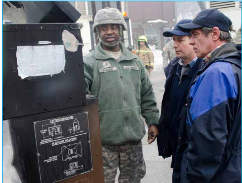
173rd BCT's paratroopers assist Slovenian partners during ice storm.

Moreover, Prime Minister Alenka Bratušek sent a letter to U.S. President Barack Obama thanking him for the timely assistance by the U.S.