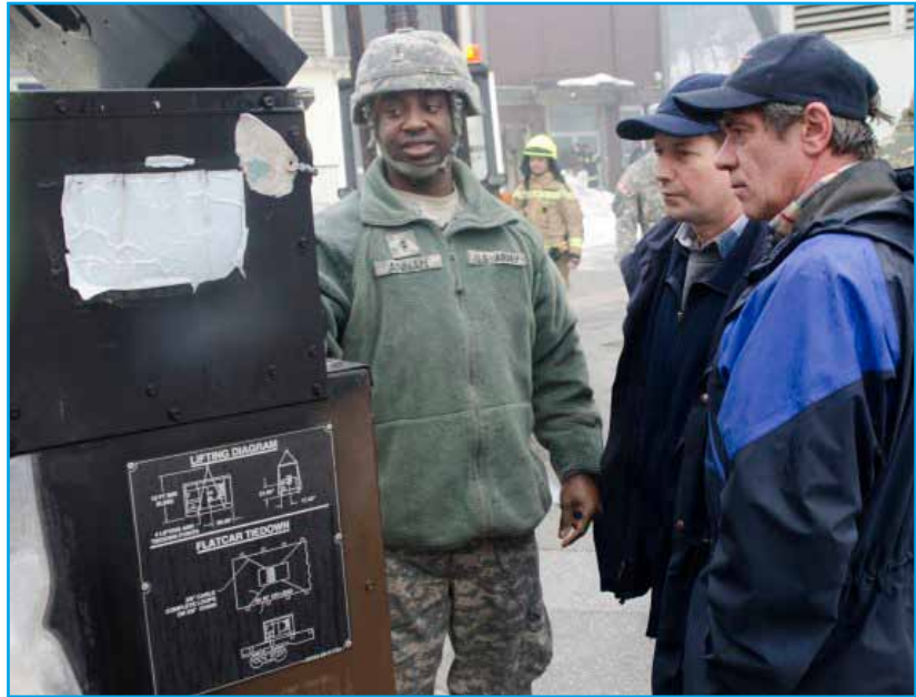
173rd BCT's paratroopers assist Slovenian partners during ice storm.

Moreover, Prime Minister Alenka Bratušek sent a letter to U.S. President Barack Obama thanking him for the timely assistance by the U.S.