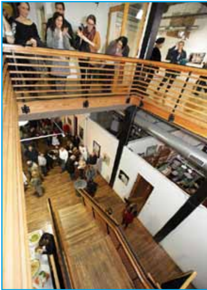
A public reception took place on Friday, February 7.