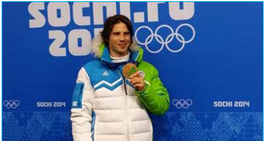
Žan Košir won bronze in Wednesday's snowboard parallel giant slalom.

Slovenian skier Tina Maze won gold in women's giant slalom on Tuesday, February 18, her second gold at the 2014 Winter Olympics. With bib 1, Maze was flawless in the first run to take the lead, and managed to keep it in the second run, finishing 0.07 seconds ahead of Anna Fenninger of Austria and 0.27 seconds ahead of Viktoria Rebensburg of Germany. Maze won her and Slovenia's first Olympic gold previous Wednesday, beating the competition in the downhill. She now has four Olympic medals, including two silvers from Vancouver. The 30-year-old Slovenian joined Marie-Theres Nadig of Switzerland as the only Alpine skiers in history to win