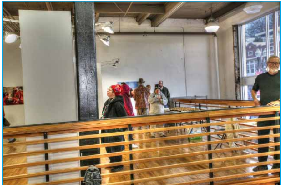
The 20 images in the exhibition, titled "Afghanistan: Unordinary Lives", portray civil society in Afghanistan.