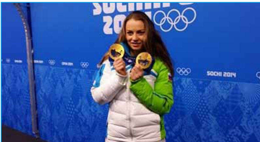
Tina Maze and Peter Prevc both won two medals at the games.