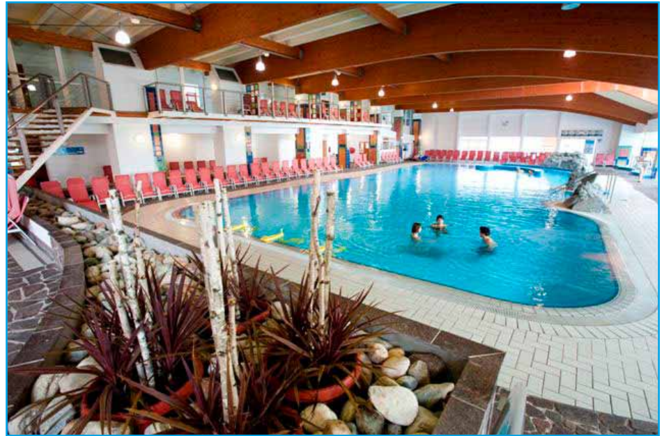
Zreče thermal spa.

More information is available at: http://www.rogla.eu/en/winter/ or www.destinacija-rogla.si and tic.zrece.lto@siol.net