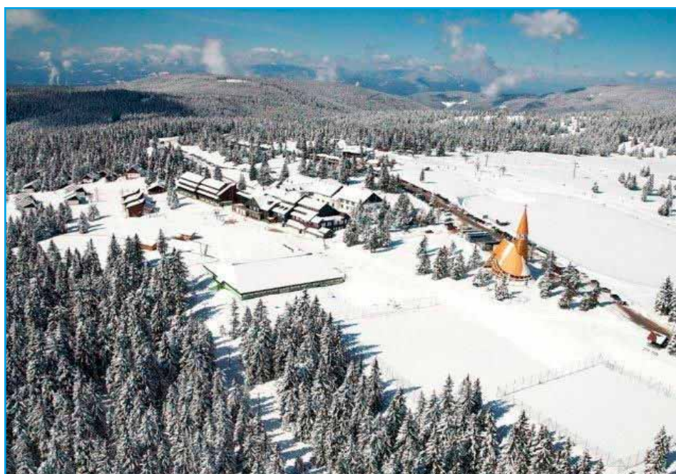
Rogla ski resort.

Rogla, located at 1517 meters (almost 5000 ft) above sea level, has been since 1996 an acknowledged health resort. Excellently equipped, Rogla Olympic and Ski Center is a paradise for hikers, cyclists and