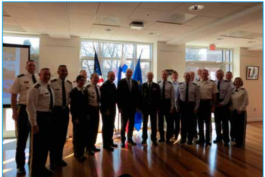
CONG senior military staff members at the embassy.