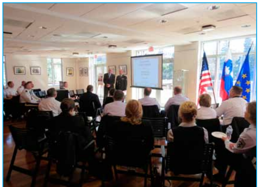
The meeting was dedicated to discussing the strengthening of future cooperation between the Slovenian Army (SV) and Colorado National Guard (CNG) within the framework of State Partnership Program.