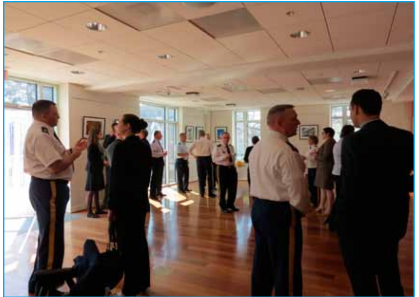
Colorado's partnership with the Republic of Slovenia began in 1993, when the Colorado National Guard was chosen to help Slovenia in meeting the NATO standards.

The peak in the partnership program was the exercise and training of members of the SV and CNG in Colorado and Slovenia for the operations and management of the OMLT (Operational Mentor and Liaison Team) in Afghanistan.