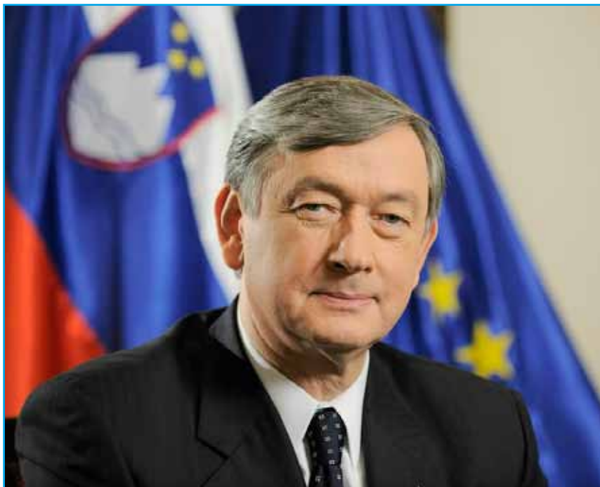
Dr. Danilo Türk.

Dr. Türk served as President of the Republic of Slovenia from 2007 to 2012 and was the first Slovenian Permanent Representative to the United Nations. During his tenure, Slovenia was a non-permanent member of the Security Council. Later, he was appointed U.N. Assistant Secretary-General for Political Affairs, before returning to Slovenia where in 2007 he was elected as the third President of Republic of Slovenia, in which office he served until 2012. A former professor and director of the Institute for International Law at the University of Ljubljana, Dr. Türk