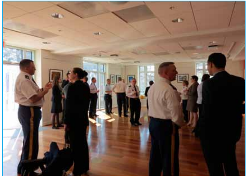
Colorado's partnership with the Republic of Slovenia began in 1993, when the Colorado National Guard was chosen to help Slovenia in meeting the NATO standards.

The peak in the partnership program was the exercise and training of members of the SV and CNG in Colorado and Slovenia for the operations and management of the OMLT (Operational Mentor and Liaison Team) in Afghanistan.