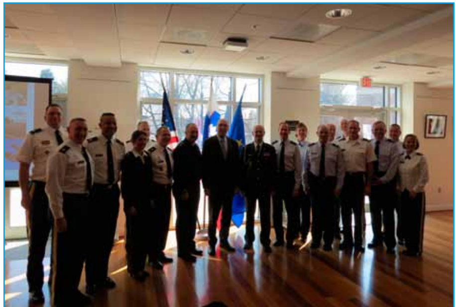
CONG senior military staff members at the embassy.