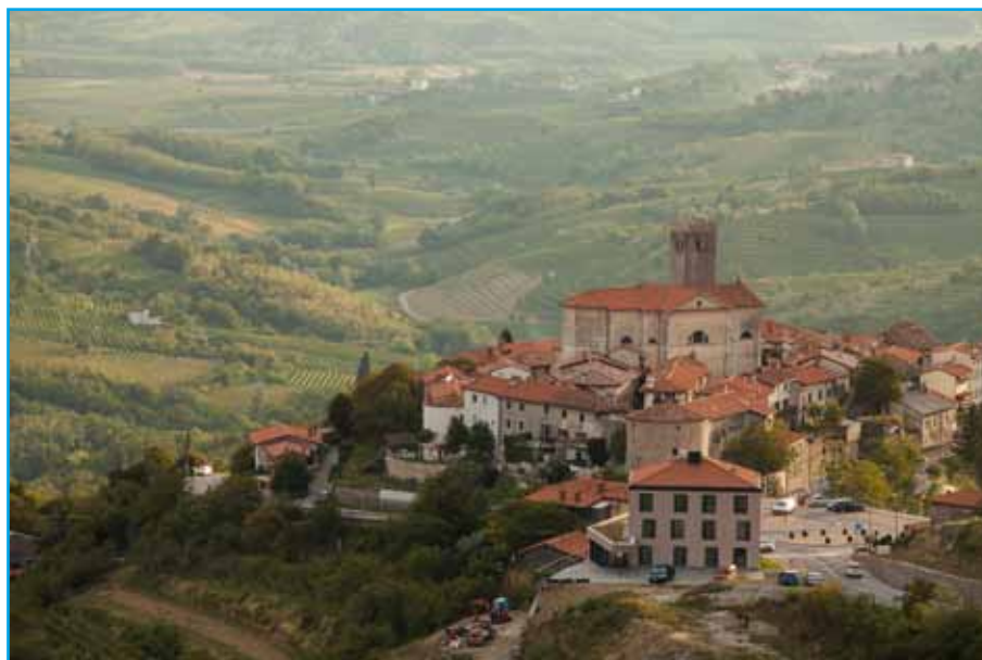
Šmartno. (Photographer: Boris Pretnar).

In the westernmost part of Slovenia, where the views reach toward Venice as well as the regions of Friuli and Veneto, there is a whole new and different world. The abundance of beauties, attractions and experiences attracts each and every traveler. The Brda region is unique, rich, colorful, lively and full of life all year round. This idyllic landscape, genuine and authentic, hides marvelous natural and cultural attractions. A visitor can climb to the top of the 23m (75 ft.) high view tower