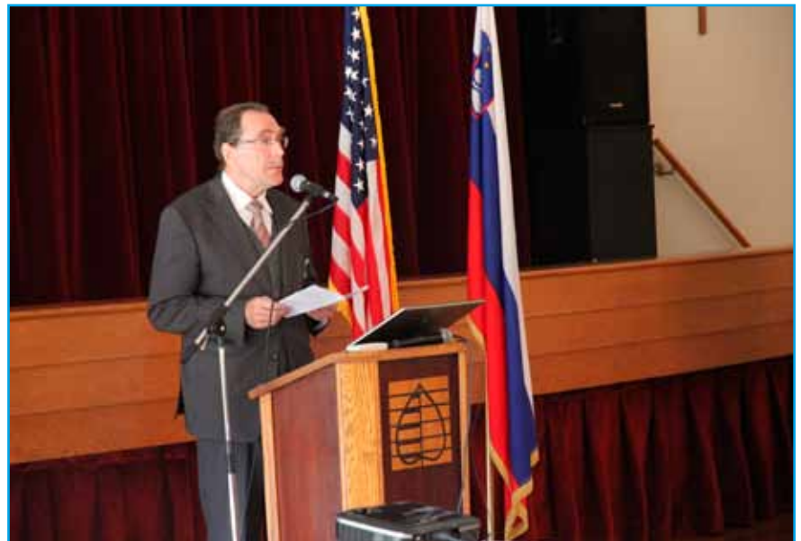
Ambassador addresses S-ABA business conference participants.