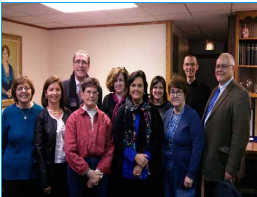
Ambassador at SUA headquarters.