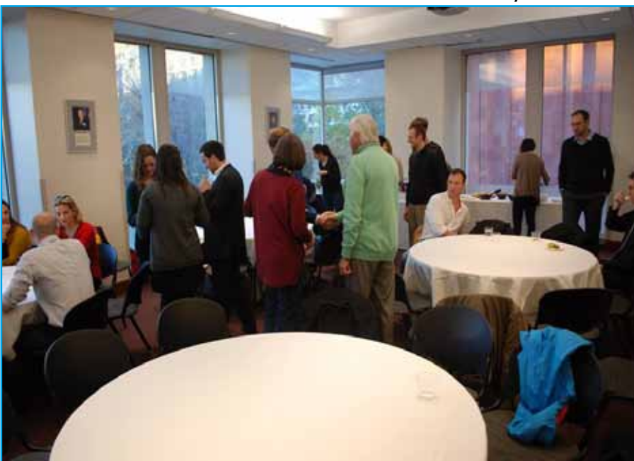
Some 40 people attended the event.