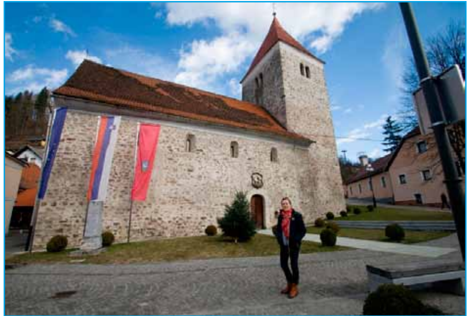
The Romanesque church of St. Vitus is one of the few churches with the bell tower facing east.

A special place in Dravograd has the Bukovje mansion. It was built in the