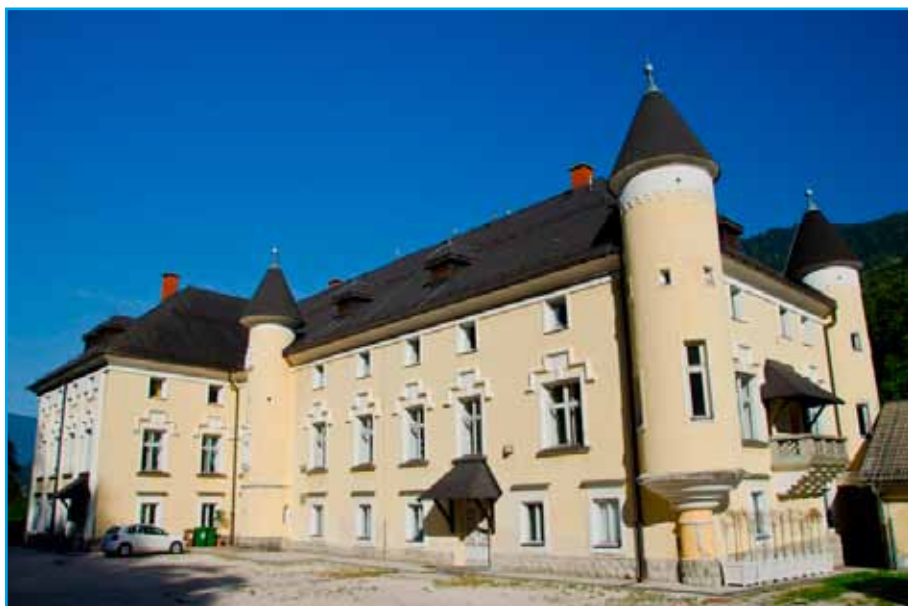
The Bukovje mansion was built in the 18th century.

Indispensable part of Dravograd's history presents a small village Libeliče. Its people are known to Slovenes mainly for the unique historic event after the Carinthian plebiscite. A deep national feeling and a great wish to unite with the mother nation made rebels out of the boys and men of Libeliče, who forced the international community and the Austrian state to allow an exception in the history of Europe: the exclusion from one country and annexation to the other, to their mother nation. Up to the present days Libeliče has remained a rural village with no industry. The locals are proud of their history. With ossuary, the plebiscite museum, the collection of peasantry, the black kitchen, the forest educational trail and above all with their kindness the people of Libeliče attract numerous tourists and visitors.