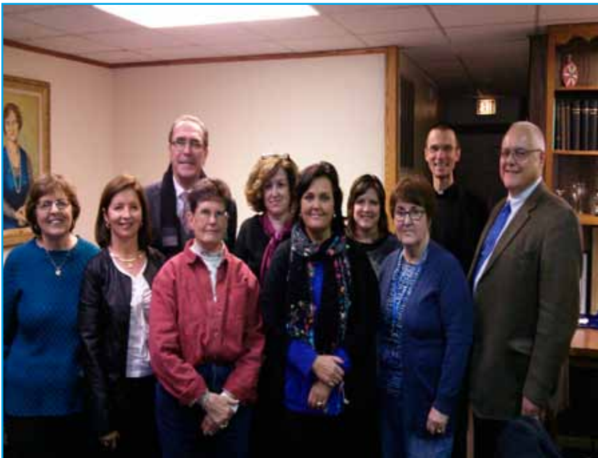
Ambassador at SUA headquarters.