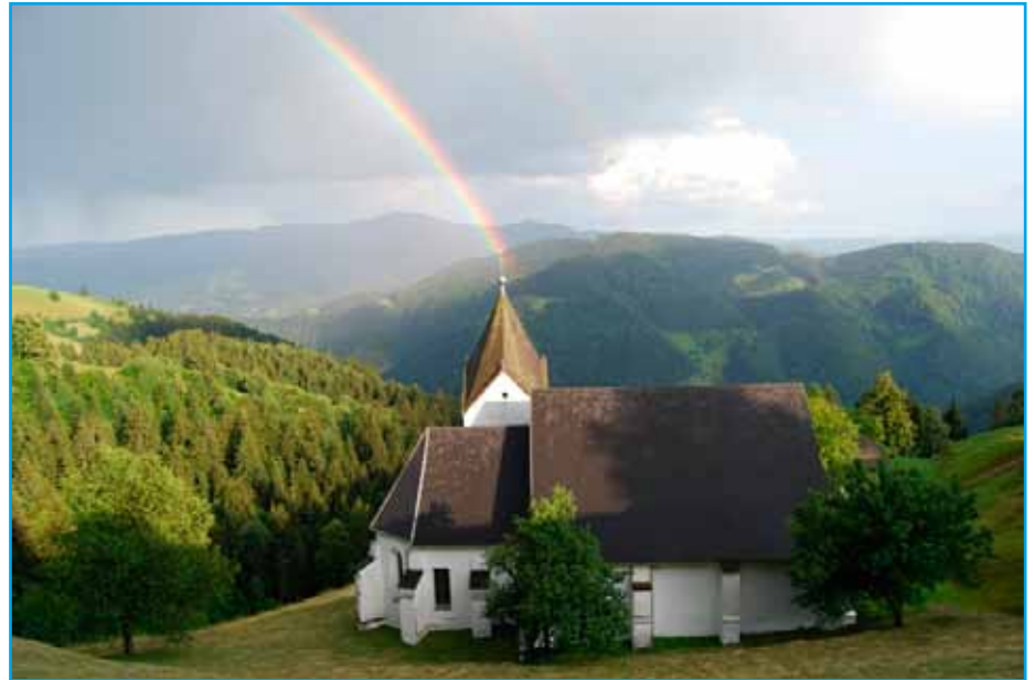
Church of the Holy Spirit in Ojstrica

Other interesting tourist points in the area are church of the Holy Spirit in Ojstrica with unique ceiling painting, church of St. Peter in Kronska gora with two bell towers, ruins of the old castle Dravograd and Pukštajn, Drava cycling path, Dravograd theme route, Nature trail Dravograd-Grad, Path for heart, rafting tour on the Drava river. Source and ore information: www.dravograd.si , www.dravit.si , e-mail: ticrodravograd@dravit.si