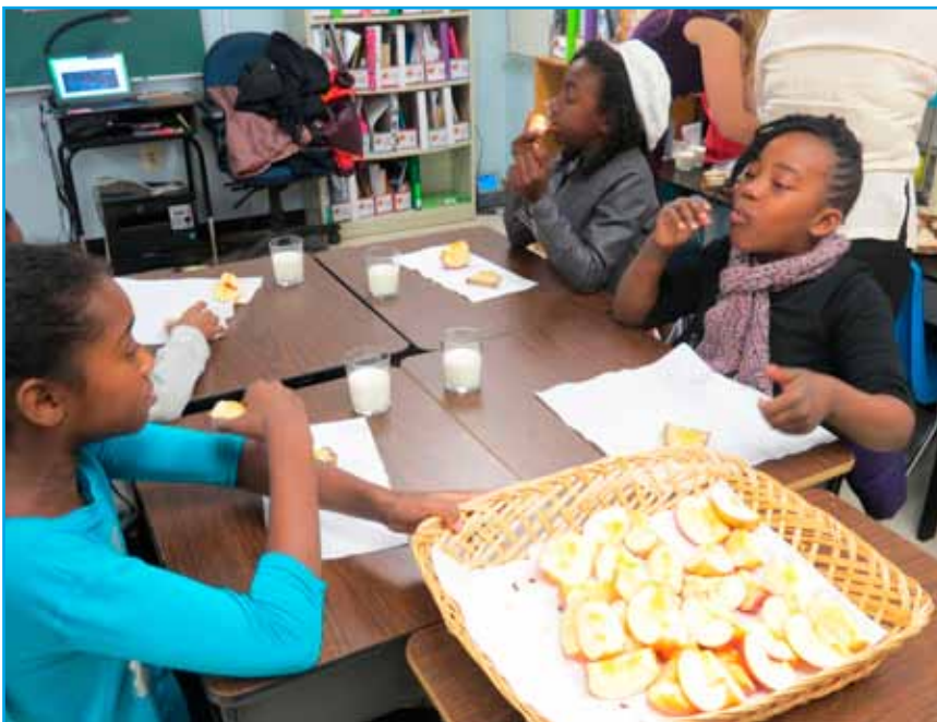
Nov 21 is celebrated as Slovenian Food Day.

The project aims to educate, inform and raise awareness of children in kindergartens and elementary schools -- and the same time also of the general public -- particularly of the importance of eating breakfast, of benefits of locally grown food, of agricultural activities for the environment, and of beekeeping for agricultural production and economic activity. It is also important to raise public awareness of youth of the importance of a healthy lifestyle, including health-enhancing physical activity and sports.