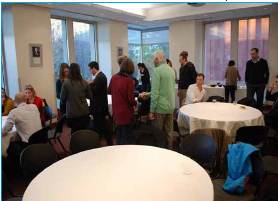
Some 40 people attended the event.