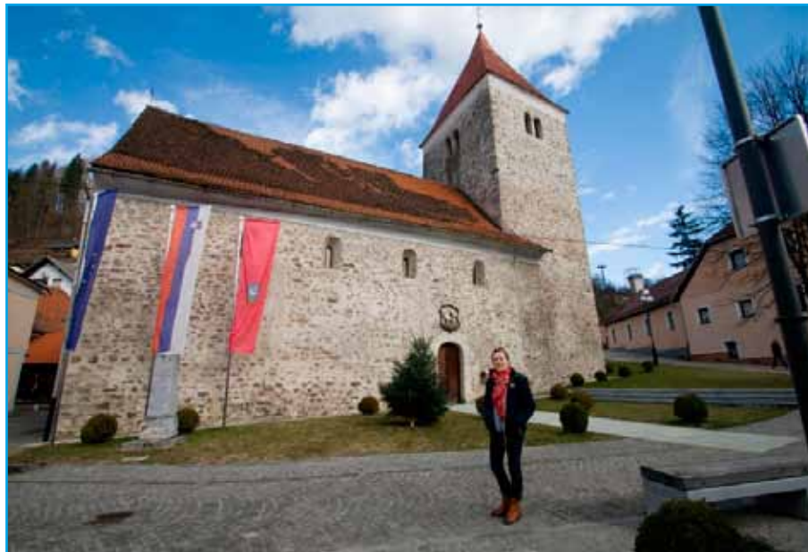
The Romanesque church of St. Vitus is one of the few churches with the bell tower facing east.

A special place in Dravograd has the Bukovje mansion. It was built in the