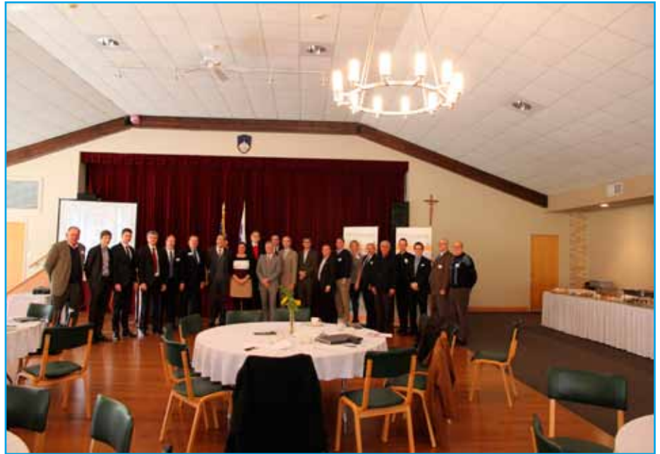
S-ABA business conference took place on the premises of the Slovenian Catholic and Cultural Center in Lemont, IL.