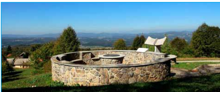
A stone marker of the 15th Meridian on Vrh-trebnje

Next to its cultural and historic features, the town of Trebnje and its surroundings invite visitors to engage in sports activities such as biking, hunting and fishing. The south side of the town is covered by the wooded slope of Bukovje, a popular walking and hiking destination. On the top of the hill Vrh-trebnje, there stands a marker of 15th eastern meridian -- a stone plaque with a sundial and a bronze relief of Slovenia. It is a lookout point with a lovely view of the wavy, vineyard-covered landscape of Dolenjska (Lower Carniola), and, in clear weather, the eye can see all the way to the nation's highest mountain -- Mt. Triglav. More information is available at: tic@trebnje.si .