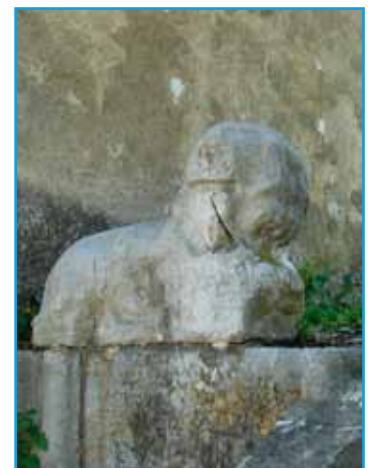
A stone lion