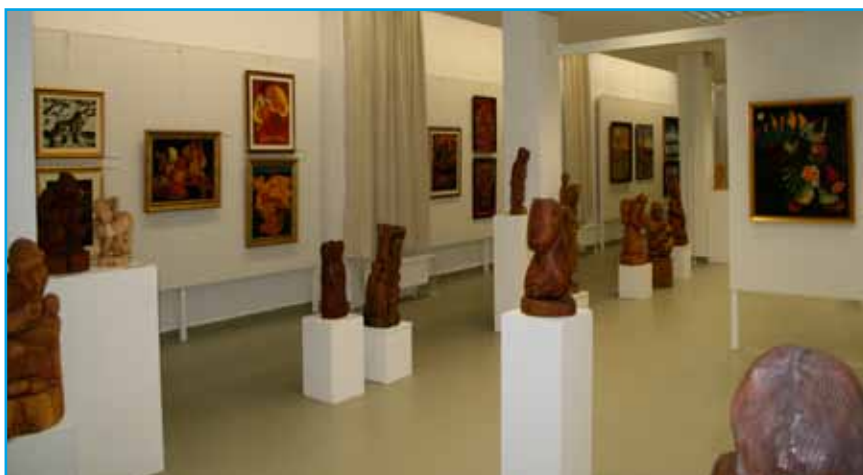
The Gallery of Naïve Artists.

The town is also very proud of The Gallery of Naïve Artists, which was a result of the activity of annual International Meetings of Naïve Artists (first organized in 1968, and still held every year in June). The Gallery is known as the only public collection of naïve art in Slovenia and as one of the more important collections of its kind in the world.