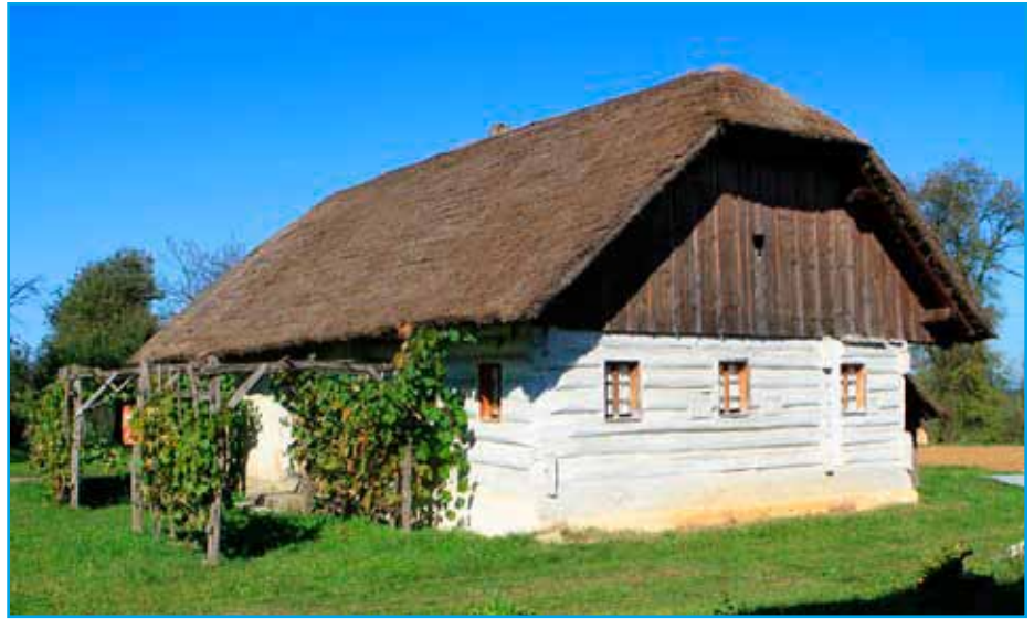
The Jurij homestead is compact and consists of a single-storey farmhouse, an outhouse, a wooden granary, a barn, a well, a trellis and an orchard.

Near the Gallery stands the parish church of the Assumption of Our Lady. The Late Gothic church with three naves and six octagonal pillars from 1443 stands on the site of an older church. It boasts a late Baroque presbytery with a fresco of the Assumption, painted by the Slovenian painter Matevž Langus, and built into its wall is a Roman relief of three busts. In 2012, a monument to the honorary citizen of Trebnje, the Archbishop and Metropolitan of Ljubjana, Dr Alojzij Šuštar, was unveiled on the south side of the church.