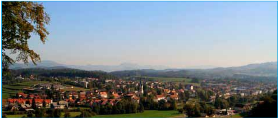
Panoramic view on Trebnje from Bukovje

In the dynamic area of the southeastern Slovenia in the region of Lower Carniola lies the town of Trebnje. The Celtic Latobici tribe lived here already in prehistoric times. In the Roman period, this was a famous staging post along the road Emona – Siscia, and the Roman emperor Vespasian named the settlement Municipium Praetorium. However, the name of Trebnje was most likely derived from the verb "trebiti", which in Slovene means clearing a forest, or from the German word "treffen" (to encounter). The linear, urbanized settlement, which climbs the terraces and hills on the left bank of the disappearing karst river Temenica, is a nowadays also a center of Trebnje municipality. A railroad has connected Trebnje with Novo Mesto and Ljubljana ever since 1894 and with the town of Sevnica since 1938.