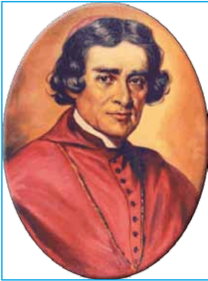
Missionary Baraga was a scholar of Native American languages.