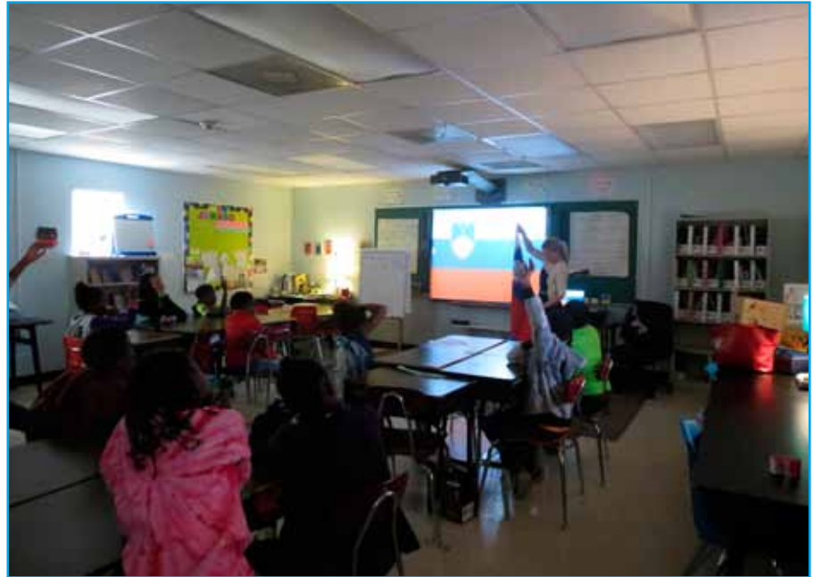
Learning about the national insignia.

The program is designed to combine embassy officials, teachers, and students from participating schools in order to expand the students’ knowledge of different countries worldwide. Teachers work with their students to help them learn about their adoptive country, and representatives from each embassy provide frequent cultural visits to their adopted