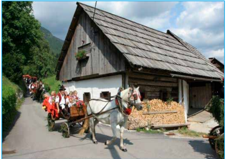
The Oplen House.

The Mrcina ranch offers horseback riding on Iceland