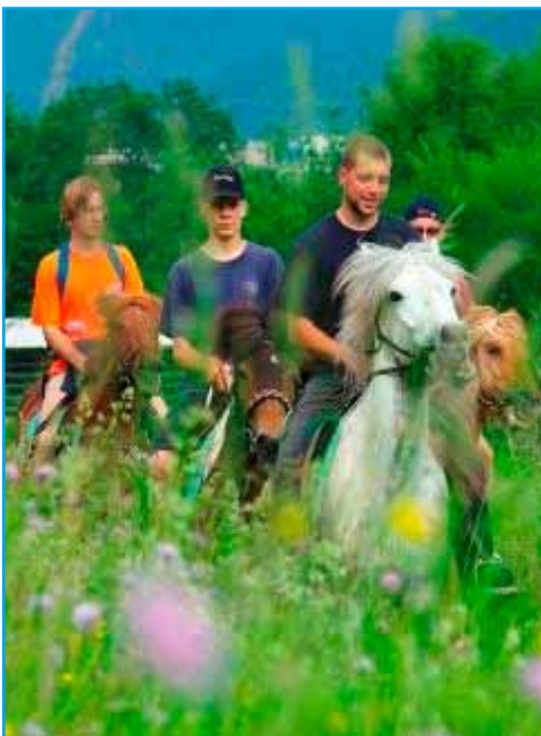
Horseback riding is a popular sport in Studor mountain behind Studor village. Studor.