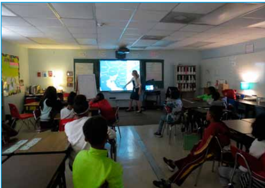
Learning where Slovenia lies in Europe.