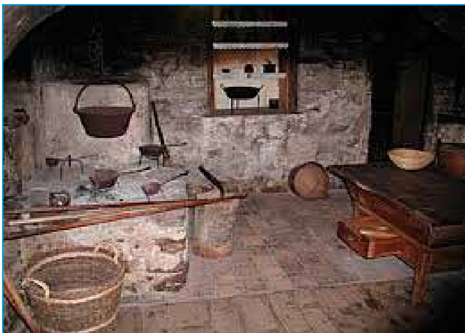
The black kitchen in the Oplen homestead.

The Oplen homestead, with a "black kitchen", lies in the compact core of the village of