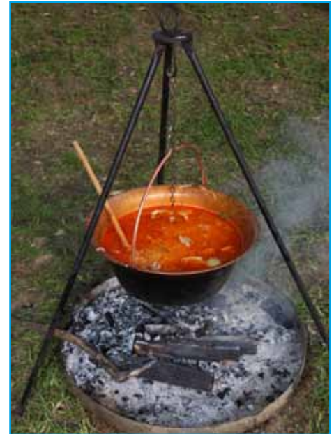
"Bujta repa", a delicious traditional dish.

The largest event is the Pomurski poletni festival (The Pomurje Summer Festival), which lasts eight days and offers a rich program with something for everyone and is also considered one of the largest festivals in Slovenia. More about the festival and its program can be found at http://www.strk.si . The ŠTRK Slovenia association is also the bearer of the Guinness World Record in cooking "bujta repa", a delicious traditional dish of