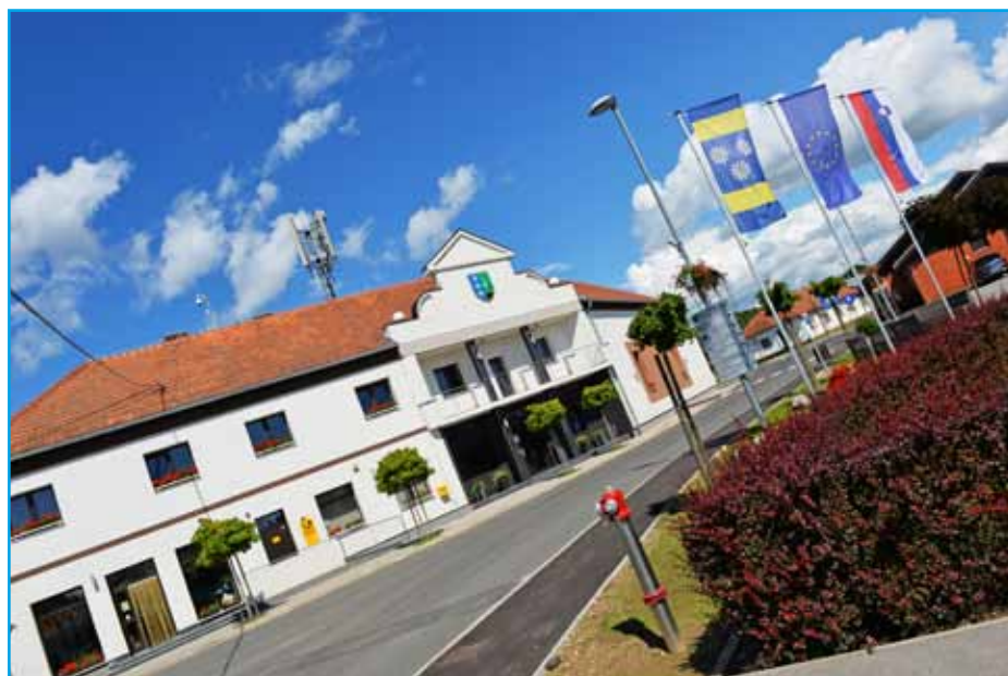
Townhouse in Velika Polana.

Among the mysterious Mura river, black meadow woods and silhouettes of the nearby hilly vineyards, lies the Velika Polana municipality. Consisting of only three villages: Velika Polana, Mala Polana and Brezovica, it is a rich mosaic of natural and cultural heritage and friendly people and, hence, the reason why a visitor should stop and discover more. It is home to the largest population of storks in Slovenia -- the reason why the »Euronatur“ foundation bestowed on Velika and Mala Polana the title "European village of storks". "Polanski log", the largest complex of black alder in Europe, offers shelter to many endangered