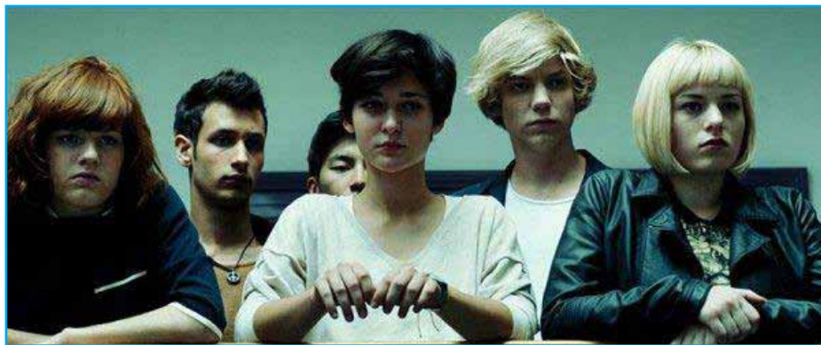
A scene from the film.

A complex feature film, Class enemy is based on actual events that occurred in the high school of debut filmmaker Rok Biček. The film charts moral disintegration in a high school following a shy student's suicide.