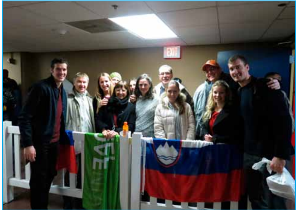
Phoenix Suns' Goran and Zoran Dragić, of Slovenia, meet with the embassy staff after the game in the locker room of the Verizon Center.

Goran Dragić began his professional career at the age of 17 in 2003 with Ilirija Ljubljana. In 2007, he joined the Slovenian League, Adriatic League, and Euroleague club Olimpija Ljubljana, where he played for one year, during the 2007-08 season, winning the Slovenian League championship. In 2008, he signed with the Phoenix Suns and joined the NBA. In 2011, he was traded to the Houston Rockets; however, Dragić returned to Phoenix Suns