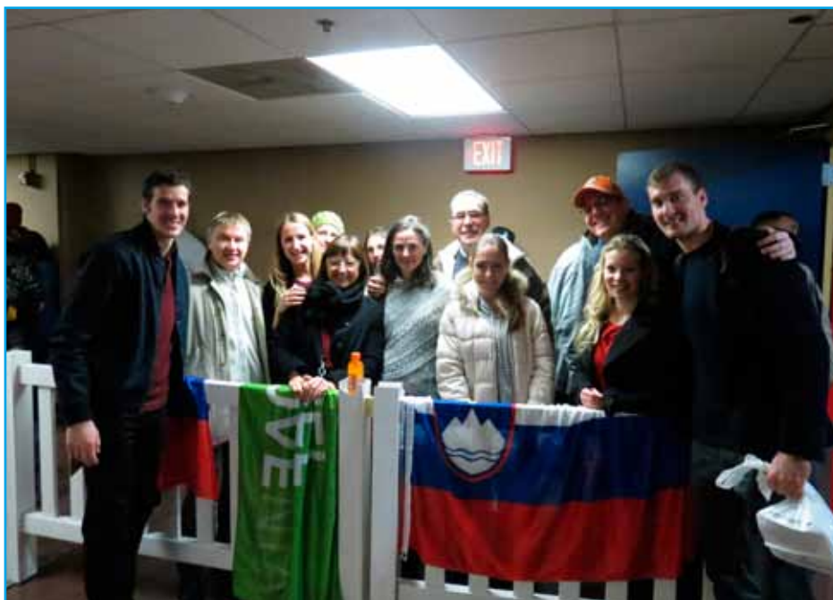
Phoenix Suns' Goran and Zoran Dragić, of Slovenia, meet with the embassy staff after the game in the locker room of the Verizon Center.

Goran Dragić began his professional career at the age of 17 in 2003 with Ilirija Ljubljana. In 2007, he joined the Slovenian League, Adriatic League, and Euroleague club Olimpija Ljubljana, where he played for one year, during the 2007-08 season, winning the Slovenian League championship. In 2008, he signed with the Phoenix Suns and joined the NBA. In 2011, he was traded to the Houston Rockets; however, Dragić returned to Phoenix Suns