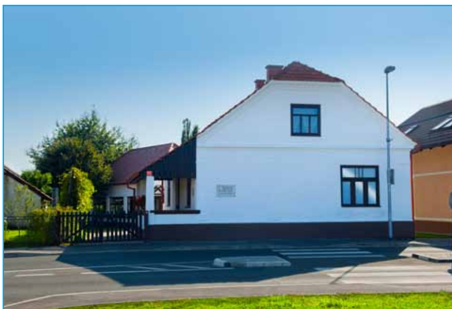
Homestead of famous Slovene writer Miško Kranjec.

The tourist story of Velika Polana is meant for those who seek genuine contact with the natural and cultural heritage and for those who wish to feel the