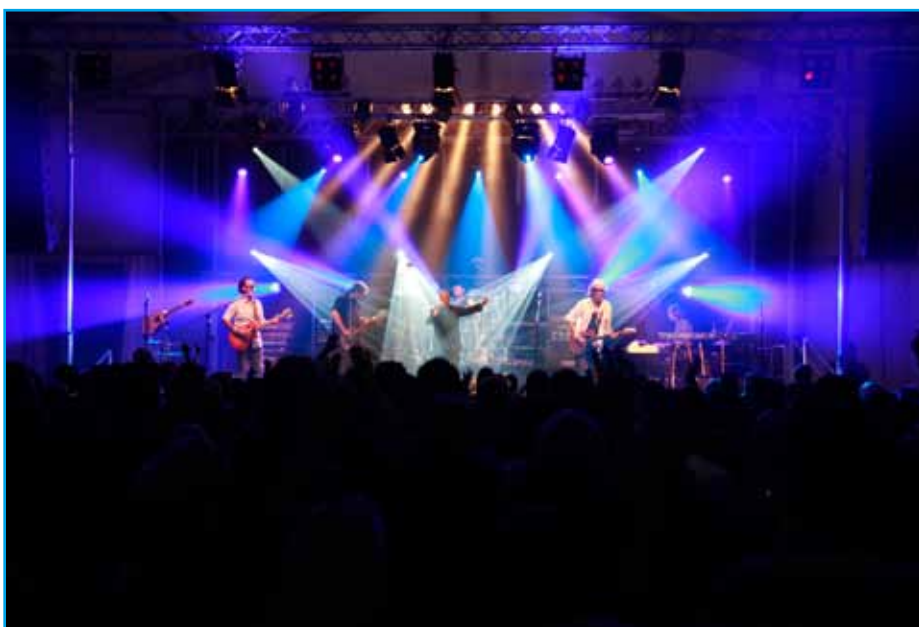
The largest event in the town is The Pomurje Summer Festival.

*OBČINA VELIKA POLANA, Velika Polana 111, 9225 Velika Polana, Slovenia; e-mail: obcina@velika-polana.si