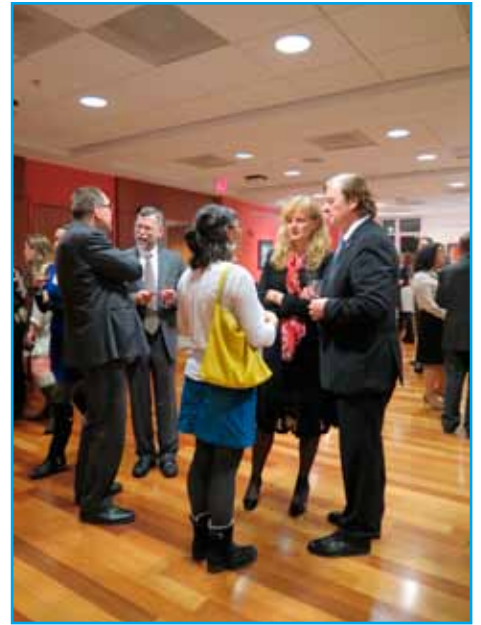
More than 80 guests attended the event.

June 25, 1991, and on December 23, 1991, exactly one year after the referendum, to adopting the Constitution of the Republic of Slovenia. In his speech, the ambassador recognized the role of the Slovenian community in the U.S. in the process of gaining recognition from the United States and also thanked it for its support on Slovenia's pathways to NATO, the 10 years of membership in it Slovenia celebrated this year. In his remarks, the ambassador also