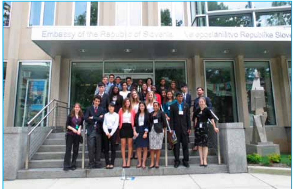
Students in front of the embassy,

The conference was organized by the U.S.-based organization Envision, which has already since 1985 been offering experimental programs for motivated high school students and in which approximately 800,000 students from more than 145 countries have already participated. The main aim of the program is to gain the real-world leadership experiences and skills that students need to succeed in college and in their future career. During the program, the students visit several institutions, such as the House of Representatives