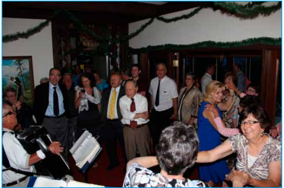
After dinner in Ely, Ambassador joined several people in singing Slovenian folk songs.