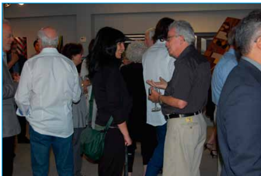
Opening of the exhibition.