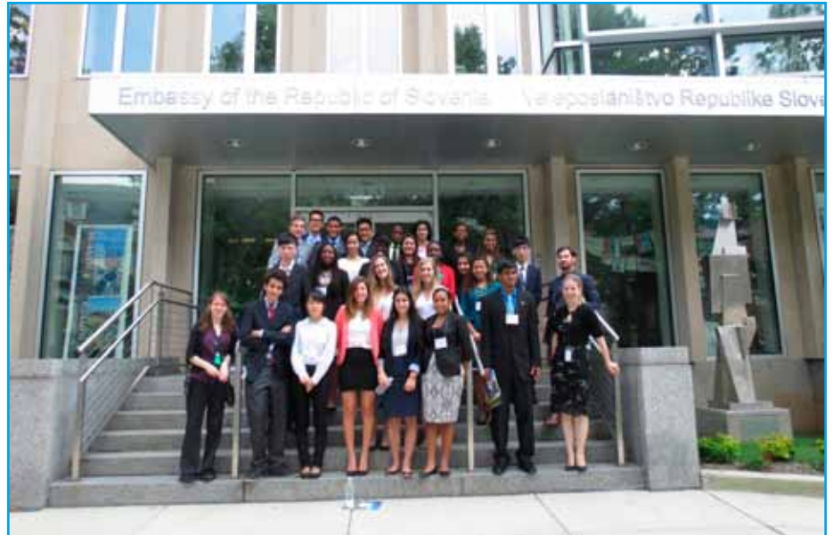
Students in front of the embassy,

The conference was organized by the U.S.-based organization Envision, which has already since 1985 been offering experimental programs for motivated high school students and in which approximately 800,000 students from more than 145 countries have already participated. The main aim of the program is to gain the real-world leadership experiences and skills that students need to succeed in college and in their future career. During the program, the students visit several institutions, such as the House of Representatives