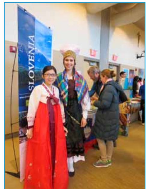
Chinese and Slovenian traditional outfit.