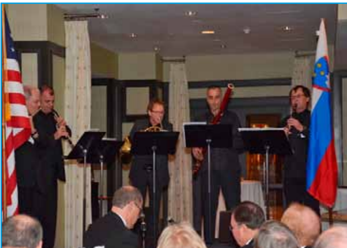
Performance by SLOWIND woodwind quintet.

If you wish to be involved, you can help the ASEF enable talented students and educators transcend borders and reach their full potential by contributing to ASEF's cause, identifying individuals and institutions as sponsors of our students and programs, helping ASEF build their network, sharing your ideas about what else they could do, and spreading the word! Please, visit the website at http://www.ase-fund.org and get in touch.