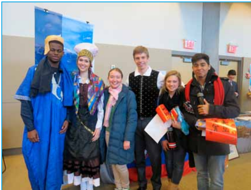
Visitors at the Slovenian booth.

The free event, featuring cultural displays, performances, and a sampling of foods from around the world, was a great success. More than two dozen embassies in the Washington area accepted the invitation to set up booths and displays. They shared information about their respective cultures and traditions with over 200 attendees, including CUA students, faculty and staff.