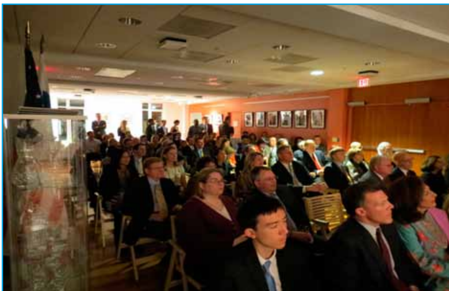
The event was attended by 120 guests.