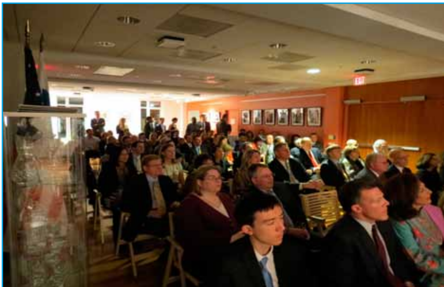
The event was attended by 120 guests.