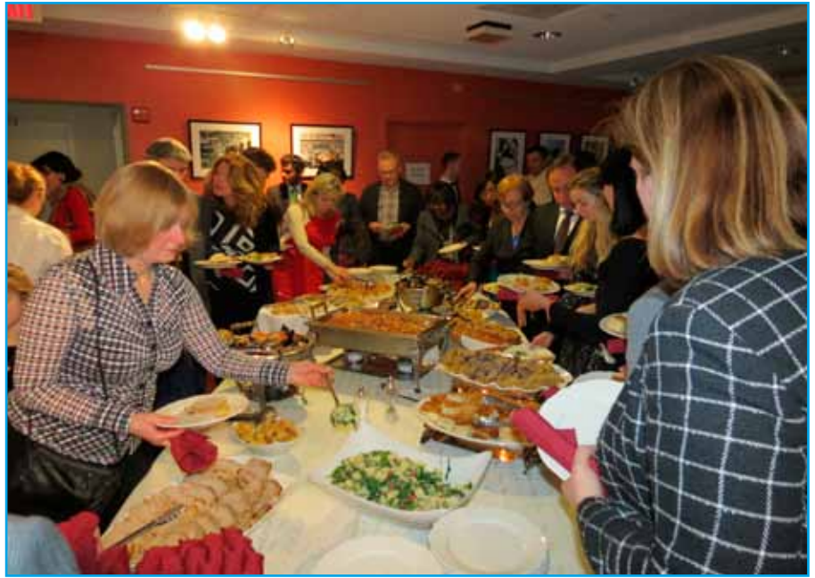
Concert was followed by buffet dinner featuring Slovenian cuisine.