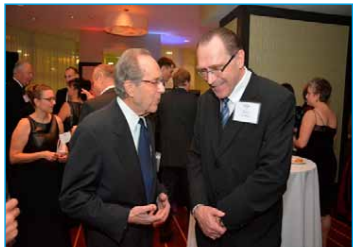
Around eighty people attended the gala.