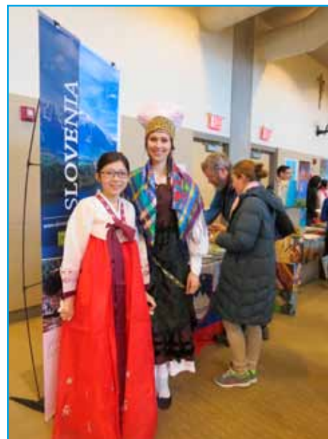
Chinese and Slovenian traditional outfit.