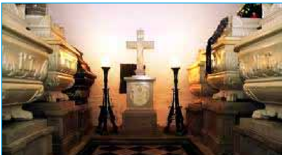
A crypt in Kostanjevica Monastery where lie the remains of the last members of the French royal house of Bourbon, among them also the last King of France.

All information can be obtained at: Tourist Board – Nova Gorica Tourist Information Center (Turistična zveza - TIC Nova Gorica) at tzticng@siol.net or www.novagorica-turizem.com