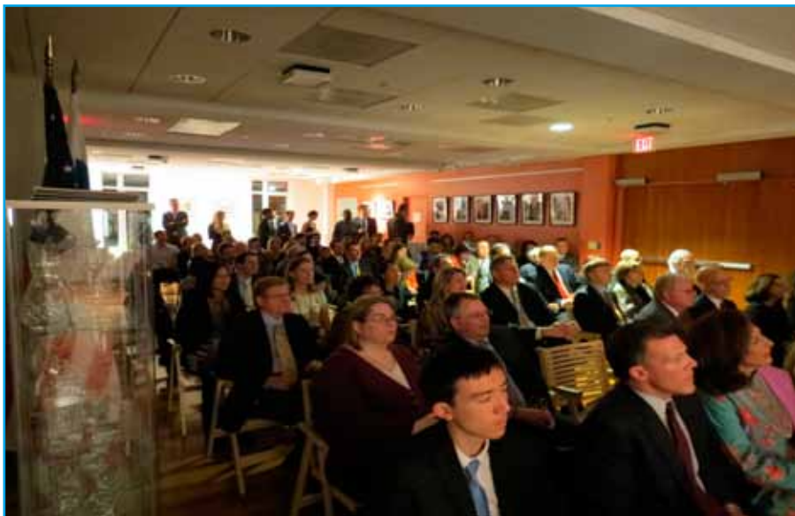
The event was attended by 120 guests.