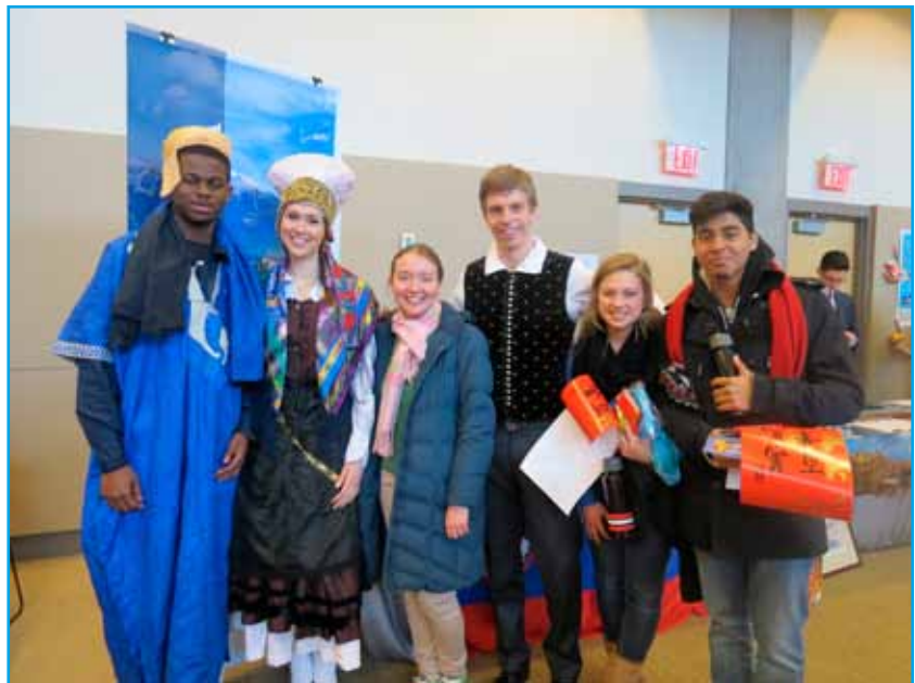
Visitors at the Slovenian booth.

The free event, featuring cultural displays, performances, and a sampling of foods from around the world, was a great success. More than two dozen embassies in the Washington area accepted the invitation to set up booths and displays. They shared information about their respective cultures and traditions with over 200 attendees, including CUA students, faculty and staff.