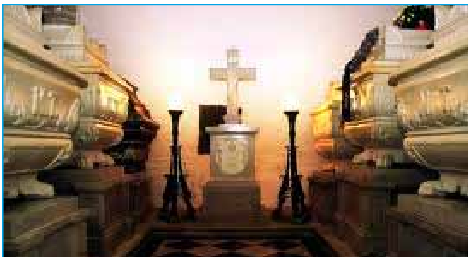
A crypt in Kostanjevica Monastery where lie the remains of the last members of the French royal house of Bourbon, among them also the last King of France.

All information can be obtained at: Tourist Board – Nova Gorica Tourist Information Center (Turistična zveza - TIC Nova Gorica) at tzticng@siol.net or www.novagorica-turizem.com