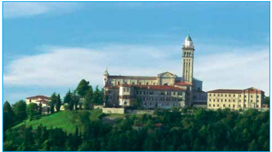
Pilgrimage basilica of Sveta Gora.

Nova Gorica with its surroundings invites with an extensive network of hiking trails and roads suitable for road and mountain-bike cycling or horseback riding. The courageous and audacious will row a kayak over the white-water rapids of the Soča, jump from the bridge attached to an elastic cord, or visit the Adventure Park. Exceptional gliding conditions are a real challenge for paragliders and hang gliders, and the vertical rock walls above the Lijak creek challenge numerous climbers.