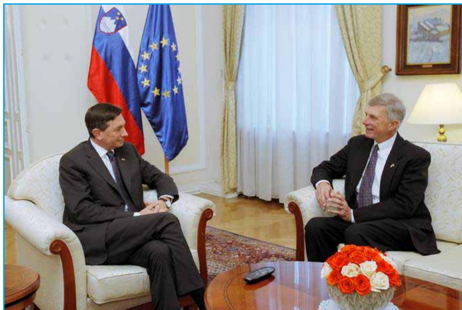
President Borut Pahor receives Ronald Michael Šega, former U.S. astronaut of Slovenian descent.

Šega, whose origins are from Loški Potok, also met with President Pahor and addressed the American Chamber of Commerce event on Tuesday, when AmCham launched a