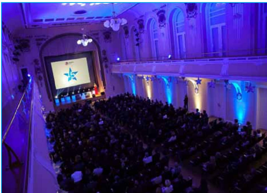
Celebration of the 15th anniversary of AmCham Slovenia

Presently, he is professor of systems engineering and Vice President for Energy and the Environment at the Colorado State University Research Foundation. He received a doctorate in electrical engineering from University of Colorado in 1982.