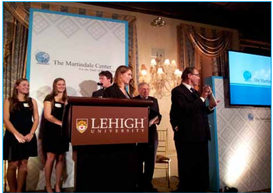
Ambassador with the students that did their research trip to Slovenia at the presentation.