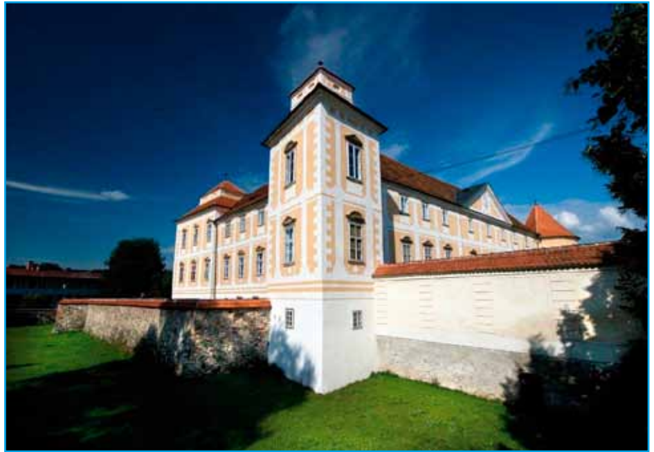
Slovenska Bistrica castle.

Slovenska Bistrica is on one of the oldest Slovenian towns. Interesting town squares, picturesque portals, historic buildings in various styles, which are standing the