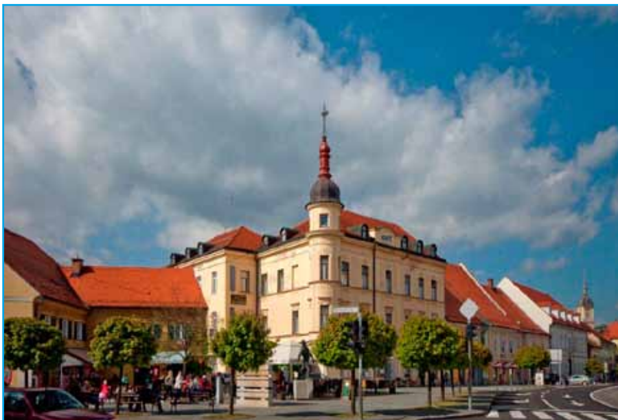
Downtown of Slovenska Bistrica.

Slovenska Bistrica is a great place to learn about history, while it can also serve as a starting point for getting acquainted with the municipality stretching from Pohorje all the way to the hillsides of Dravinjske gorice. The rich and interesting cultural heritage of this area tells countless stories about the creativity of its people, their activities, progress, and the events that have shaped the cultural landscape of this region through time. Numerous archaeological finds are evidence that this area became settled very early. The