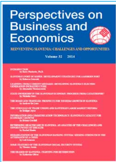
Cover of the journal.