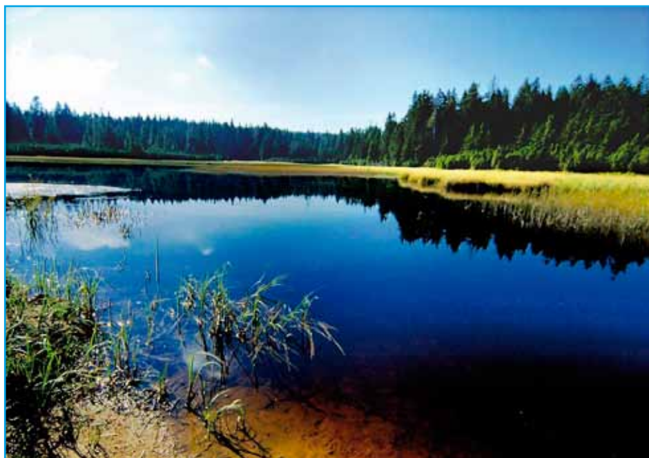
Black lake in Pohorje.

Traditional events, folklore, and traditional home-made products all play an important part in preserving the cultural heritage of the area.