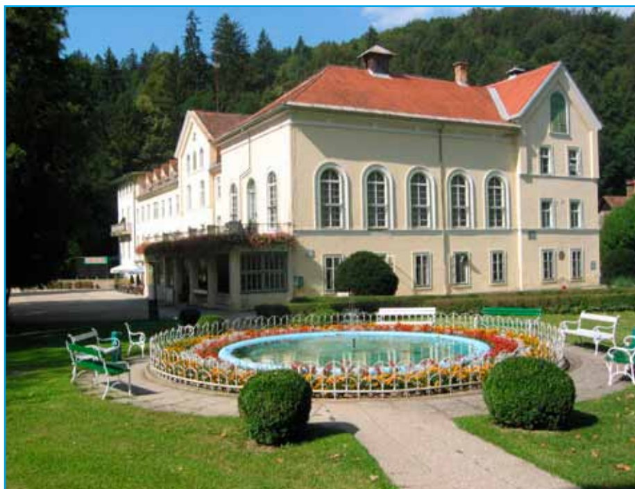
Terme Dobrna is nowadays a modern, dynamic health and tourist resort.

until 1613, when the estate was taken over by the Gačnik family. In 1666, Emperor Leopold I elevated the then-owner of Dobrna to the aristocracy, conferring on him the name von und zu Schlangenberg auf Schlangenburg; this is where the folk name of the castle comes from: Kačji grad (Snake Castle). The ruins of the castle can still be easily seen on the hill of Lokovina.