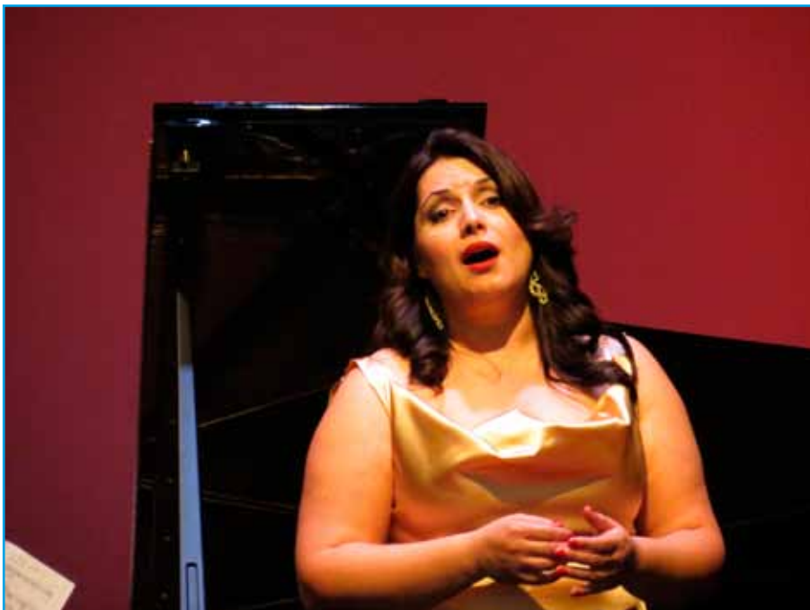
The concert featured works by acclaimed Slovenian composers from the 19th and 20th centuries, namely, Benjamin Ipavec, Josip Ipavec, Rado Simoniti, Anton Lajovic, and Lucijan Marija Škerjanc.

Scotland, Slovakia, Slovenia, Spain, Sri Lanka and Sweden, performing with renowned orchestras and soloists. She was invited by Montserrat Caballé to perform in her concert of arias by Giacomo Puccini in Zaragoza, Spain, which marked the 150th anniversary of the composer's