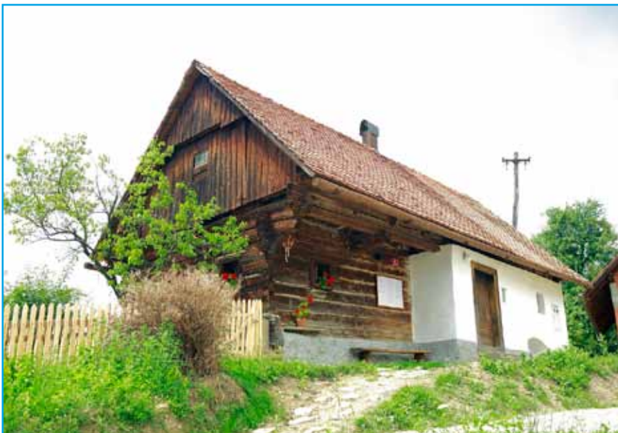
Traditional house from centuries ago.