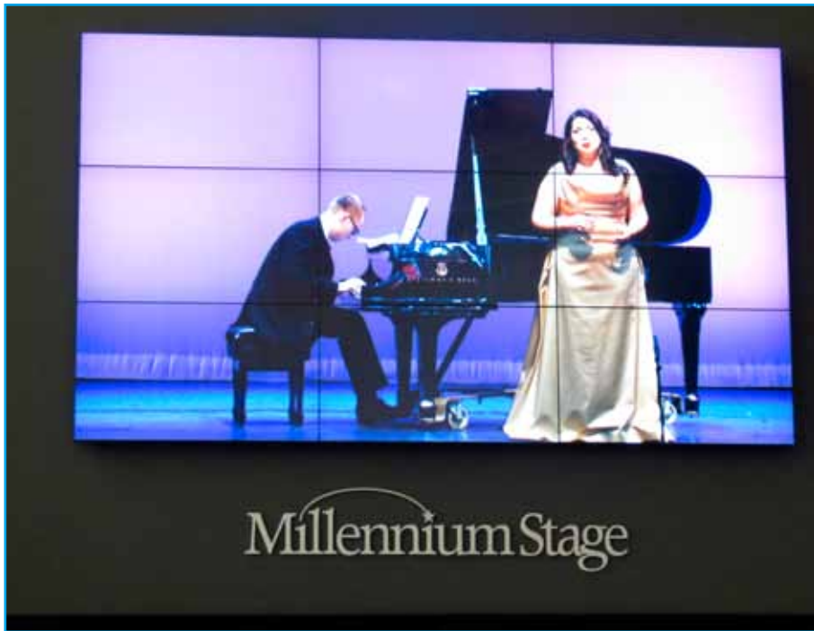
The concert was broadcast live online.

made her operatic debut in the lead role of George Bizet's Carmen. She has given recitals in London and across England as well as Austria, Belgium, Bosnia and Herzegovina, Czech Republic, China, Croatia, England, Germany, France, India, Israel, Italy, Macedonia,