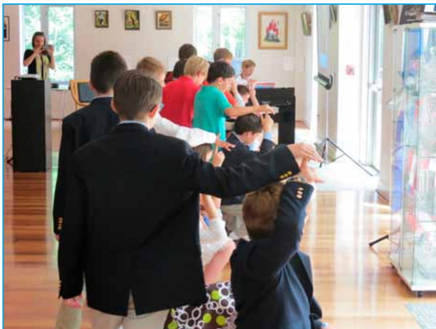
Children danced to the traditional tune of Ob bistrem potoku je mlin.

The final presentation highlighted their knowledge about the country. They demonstrated how one introduces himself/herself in Slovene, sang the Slovenian national anthem, presented the tableau of the Slovenian