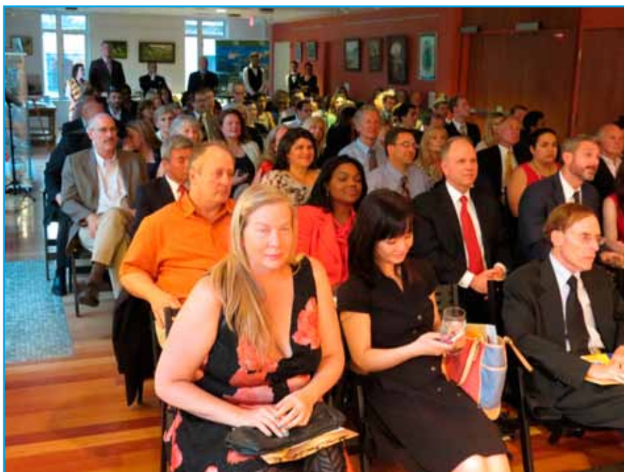
Around 80 people attended the event.

After a musical performance, the guests were invited to feast on a buffet of traditional Slovenian delicacies such as roasted pork with sauerkraut, prekmurska gibanica cake, potica walnut-roll cake, Bled cream cake, dumplings, and Carniolian sausage, along with wine served at the open bar. The evening provided a guest also with the opportunity to meet diplomatic personnel at the embassy as well as the performing artists, and to enjoy a warm spring evening on the embassy terrace.