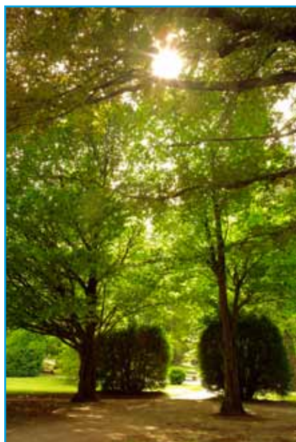
A dominant feature of Dobrna, the spa park, is a precious gem of irreplaceable natural heritage.

In the heart of green forests, some 15 miles north of Celje, lies the town of Dobrna, distinguished by its healing thermal water that was known even to the ancient Celts and Romans. The gravestones of an ancient necropolis offer plenty of evidence of these ancient cultures in the area. The Slovenian name Dobrna was first mentioned in a document in 1155, whereas its German name, Neuhaus, first appeared in 1275 and was initially used only for the local castle. The latter was owned by the knights of Dobrna