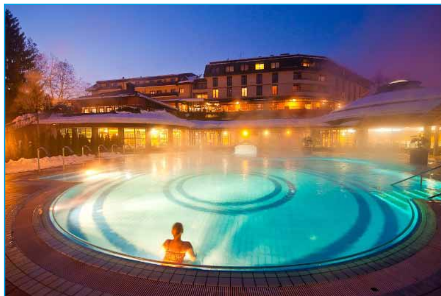
Šmarješke Toplice spa.

Tourist industry of Šmarješke Toplice developed principally with the discovery of