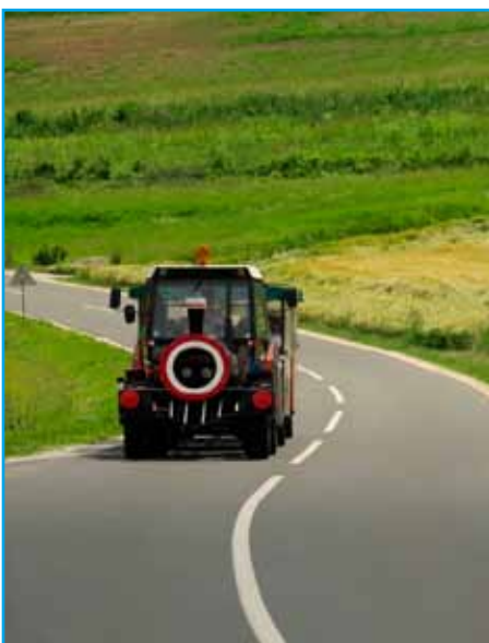
A tourist train in Šmarješke Toplice.

the bishops of Freising in the Dolenjska Region. In the area, under a nearby knoll rest the ruins of the Klevevž castle, the Radulja creek forms a picturesque gorge of with waterfalls, there are caves with a unique thermal spring, and the Klevevška Toplica spring (hypothermal spring with temperatures from 70 to 77°F). Source and more info: E-mail: info@smarjeske-toplice.si ; Web: www.smarjeske-toplice.si ; www.tic.smarjeske-toplice.si