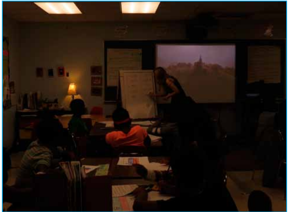
Learning numbers in Slovenian language.

The Embassy Adoption Program is designed to combine embassy officials, teachers, and students from participating schools in order to expand the students' knowledge of different countries worldwide.