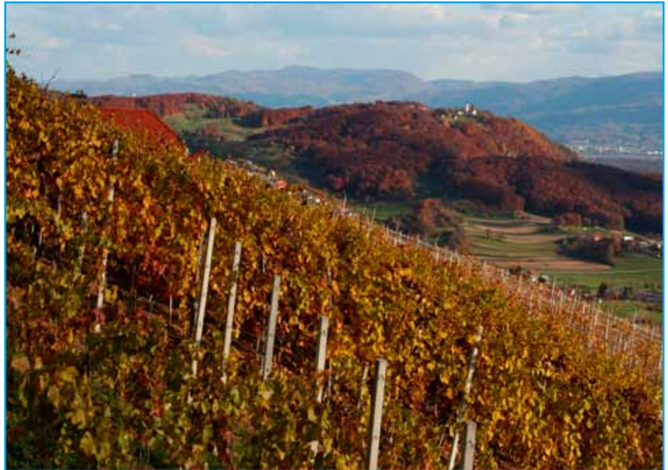
Vineyards in autumn.

Dolenjska region is known for its vineyards and another specialty – vineyard cottages. Šmarješke Toplice was among the first to offer this