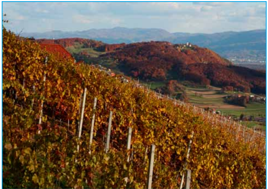
Vineyards in autumn.

Dolenjska region is known for its vineyards and another specialty – vineyard cottages. Šmarješke Toplice was among the first to offer this