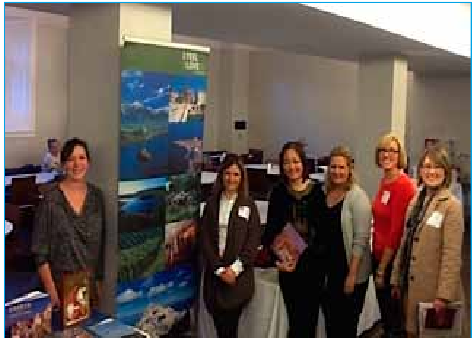
The organizing committee.

Slovenia was recently presented at the Washington National Cathedral School's International Day Luncheon. The goal of the international luncheons organized by the Parents Association is to introduce the girls to the culture of different countries and regions around the world. A lunch for the entire school (grades 4 - 12) on October 30 focused on the Southeastern Europe, including Slovenia. A large poster and various brochures featuring Slovenia's hiking, skiing, and cultural attractions were very popular among the participants. International Committee of the Parents Association even donated two copies of each item to the teachers at the National Cathedral School for use in their classrooms.