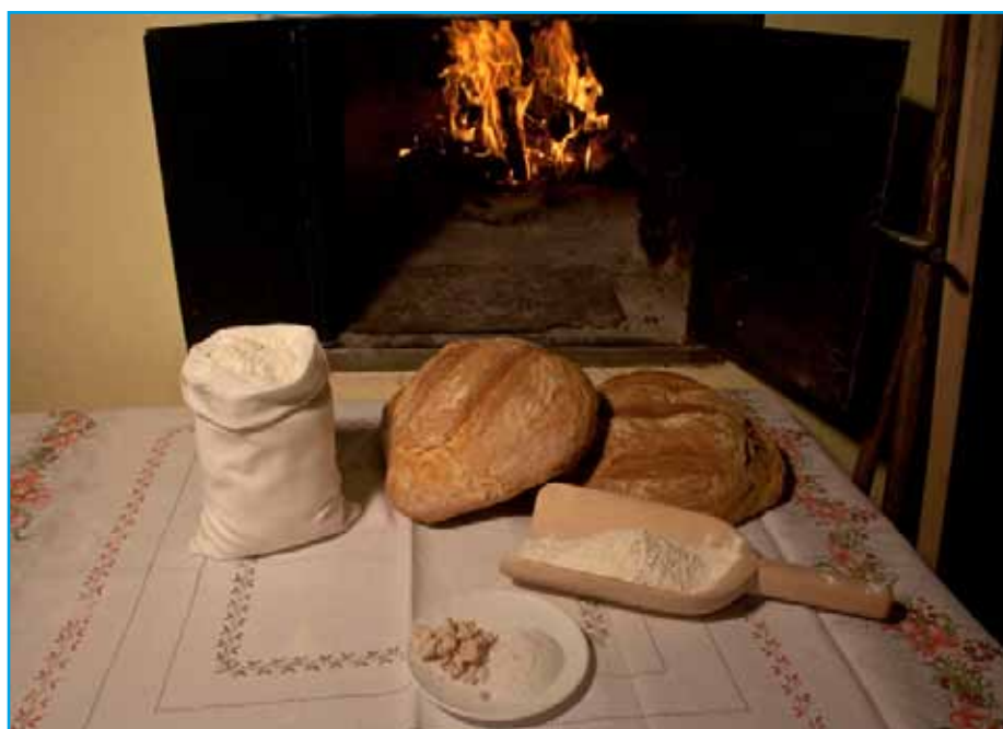
Tradition of baking home made bread in Šmarješke Toplice.