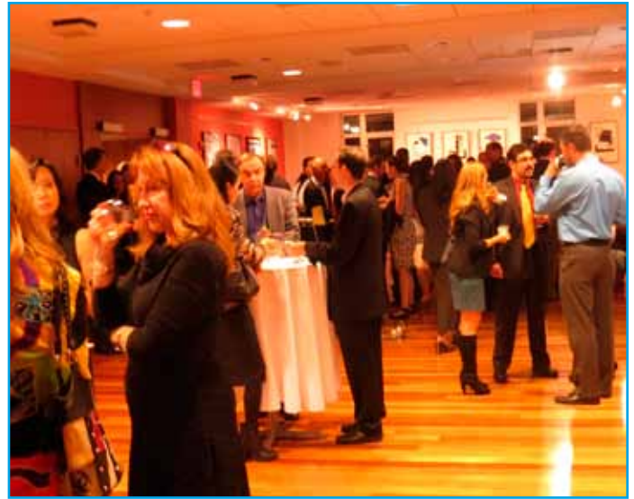
Vines from different regions of Slovenia were introduced.