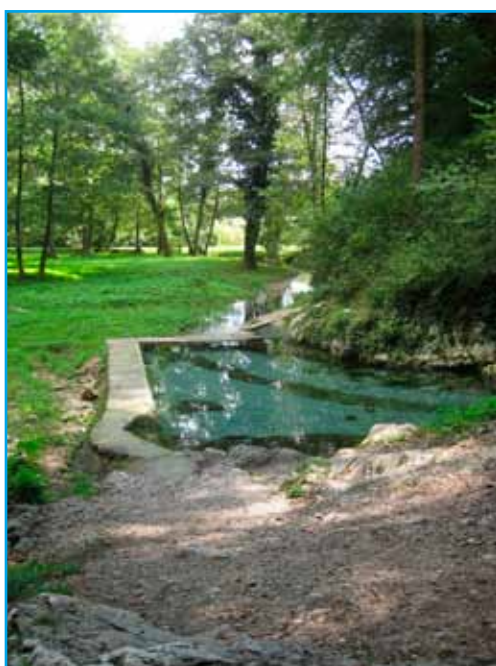
Klevevška Toplica spring.

local thermal spring. Its positive characteristics are exploited by a top medical team for treatment of cardiovascular diseases. Along with medical services, there developed also »family« and »bussines« tourism. Šmarješke Toplice, with its picturesque and peaceful nature, historic and cultural sights, and authentic gastronomic offer, satisfies a wide range of tourists.