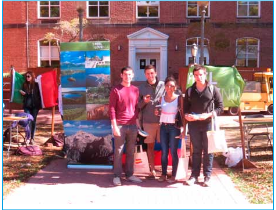
Visitors at the Slovenian booth at GWU Yard.

Embassy of Slovenia, on Sunday, October 26, participated at AIESEC DC Global Village event, which took place at the George Washington University Yard. The 2nd annual event was organized by AIESEC DC, in partnership with the GWU Program Board, the G.W. Office for Study Abroad and Student Exchange, and the Student Association at The George Washington University (SA). Next to the Embassy of Slovenia, 16 student organizations, 14 embassies, 7 performance groups and 4 cultural organizations promoted cultural diversity, showcased their respective traditions and food with students on the campus.