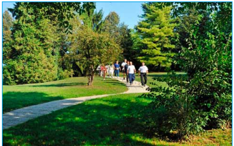
Nordic walking is very popular among tourists.